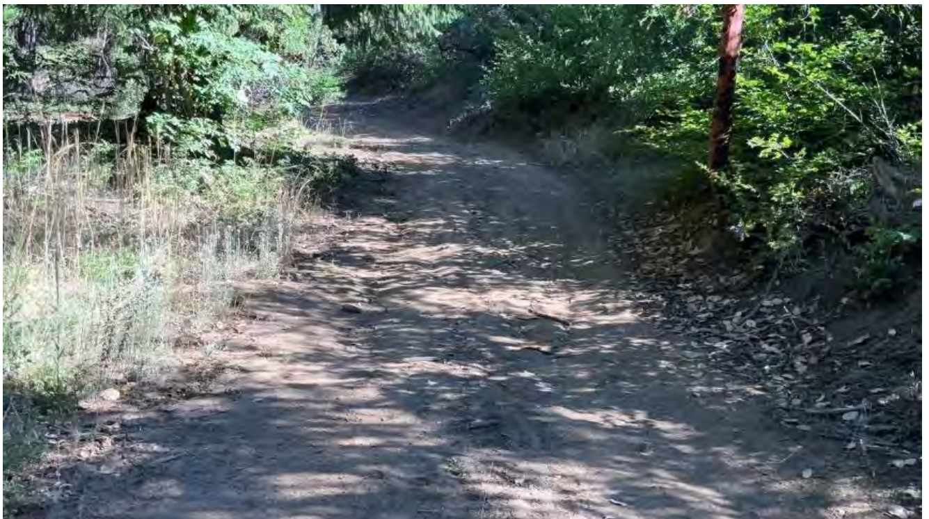
Figure 18. Point Feature 16 – rilled road surface.