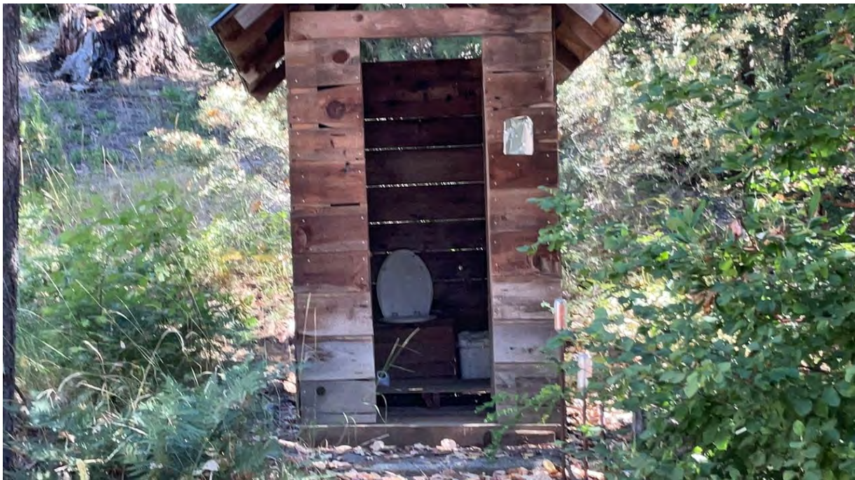
Figure 20. Point Feature 17 - Pit privy