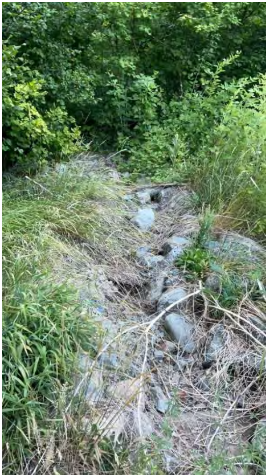
Figure 7. Point Feature 6 - Constructed channel to pond from Corral Creek.