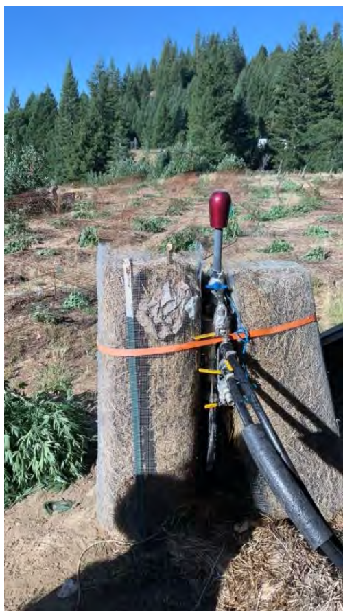
Figure 14. Point Feature 11 – well next to outdoor cultivation area.