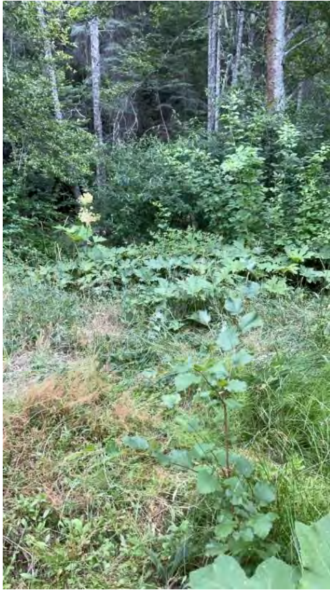
Figure 8. Point Feature 9 – Pond berm along Corral Creek.