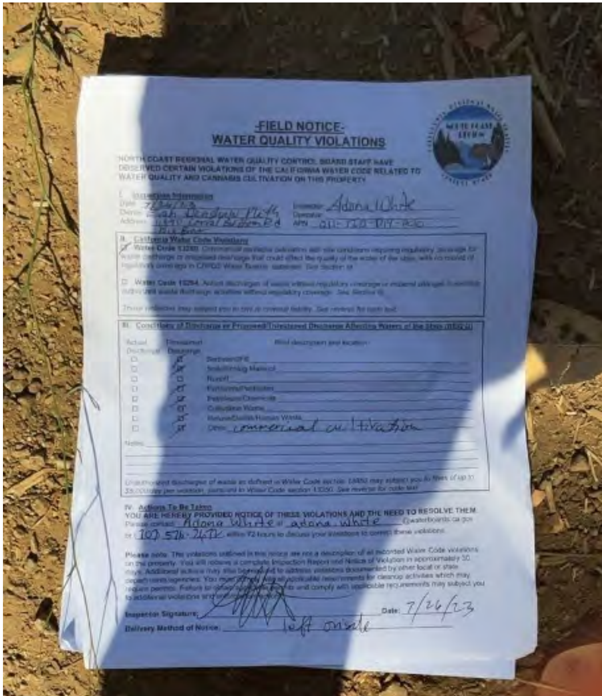
Figure 21. Field form I left onsite. I received a call from Evan Henshaw-Plath, as requested.