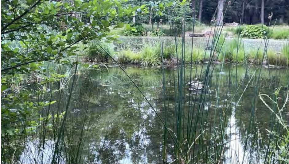
Figure 4. Polygon Feature 3 – pond located next to Corral Creek, with inflow and outflow structures from Corral Creek and a berm along the edge of Corral Creek