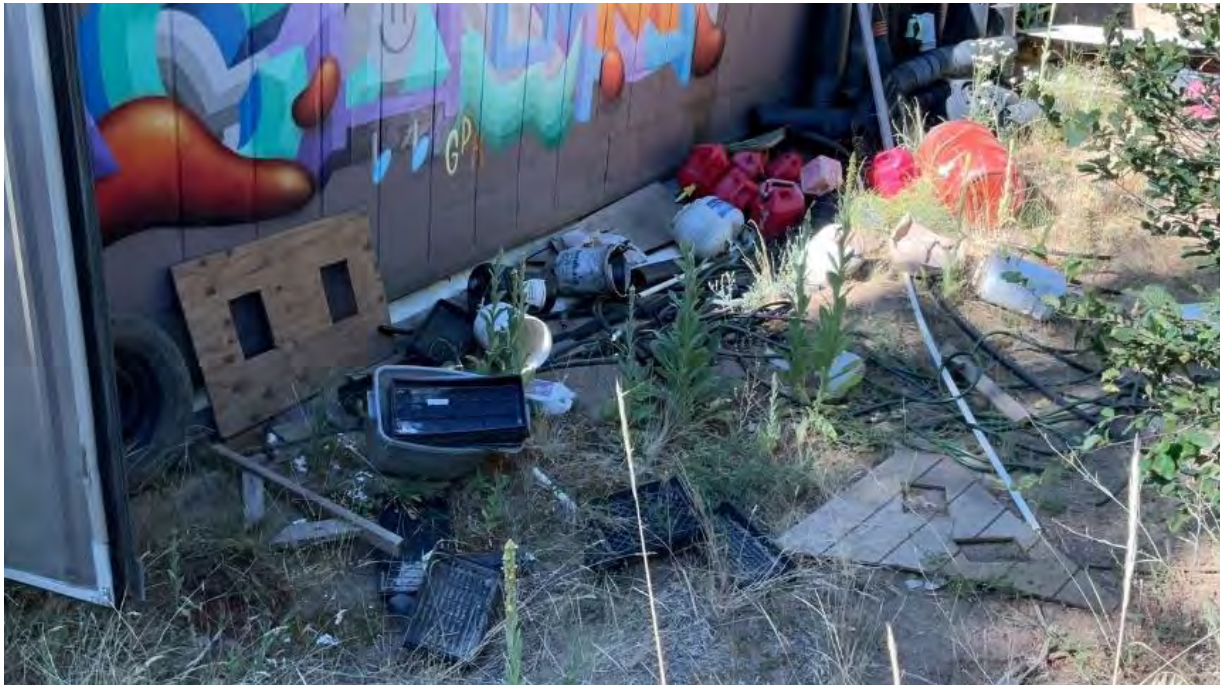
Figure 19. Point Feature 17 – building with refuse.