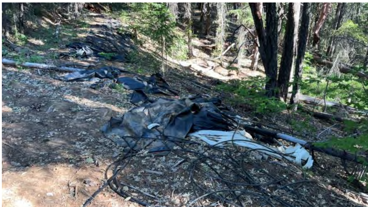
Figure 16. Point Feature 13 - Cultivation-related refuse.