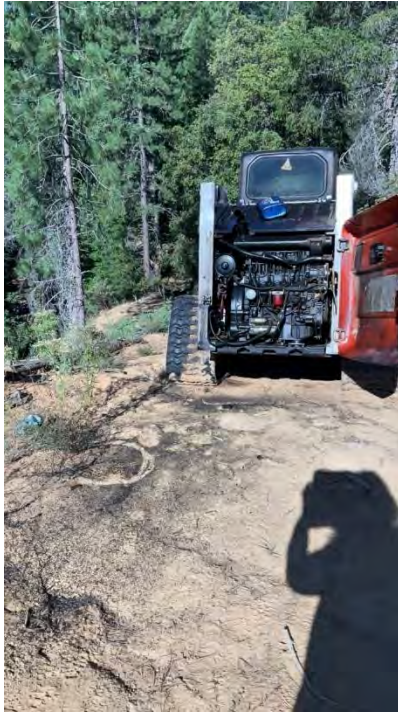
Figure 17. Point Feature 14 – skid steer with spray of dark fluid on ground.