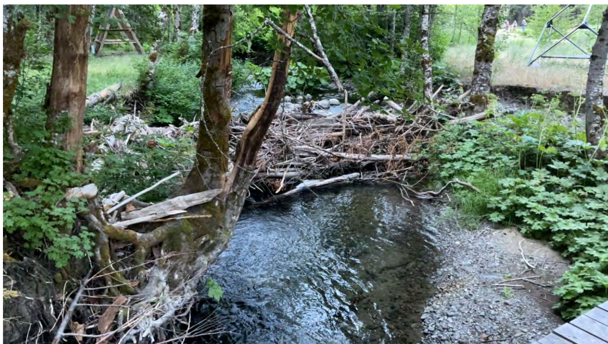
Figure 11. Point Feature 7 - Looking downstream from footbridge.