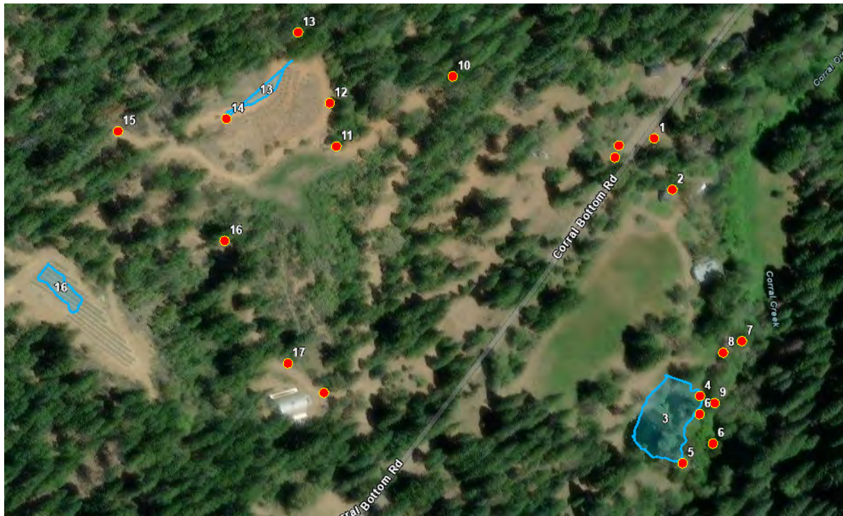
Figure 2. Inspection map with aerial imagery showing the point, line, and polygon feature locations of interest described in the text.