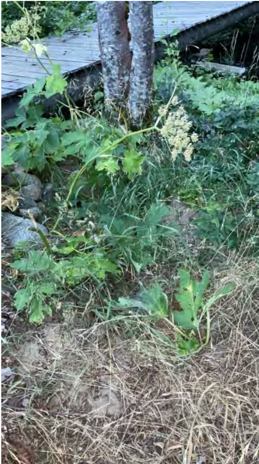
Figure 12. Point Feature 7 – Recent sand deposits on ground surface next to downstream side of right bank abutment, close in elevation to the bottom of the footbridge deck.