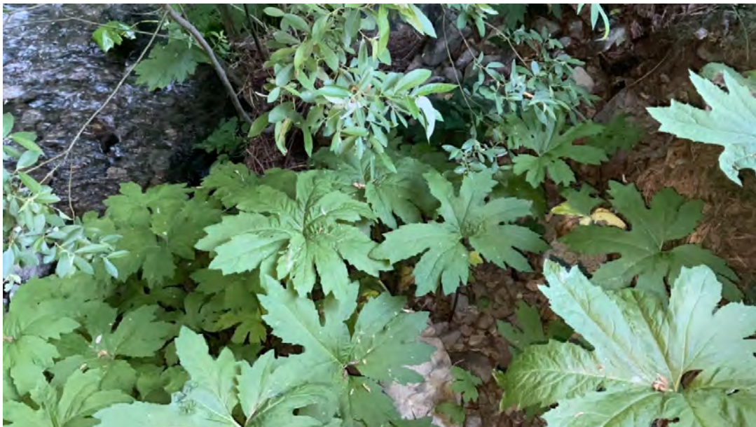
Figure 9. Point Feature 9: Toe of pond berm located next to wet channel of Corral Creek.