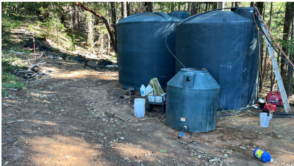
Figure 15. Point Feature 13 – water storage and feed tanks with gas powered generator for pump and fertilizers.