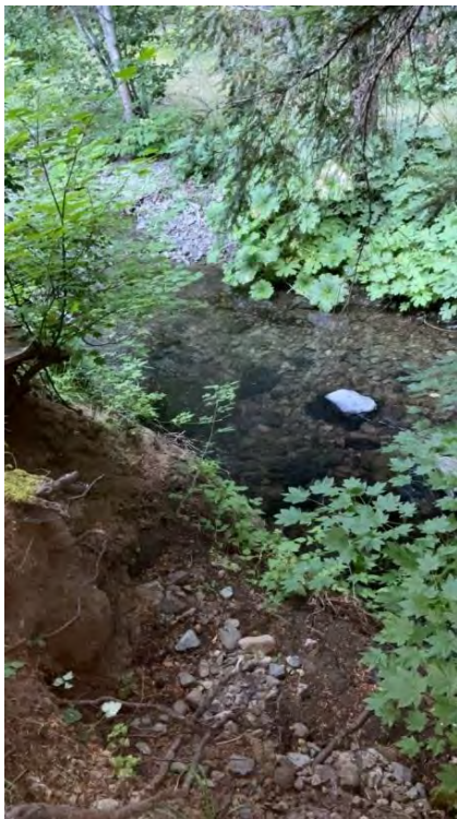
Figure 5. Corral Creek next to pond.