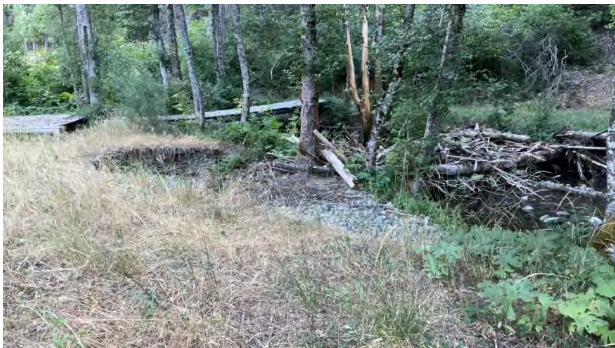
Figure 10. Point Feature 7 - Looking upstream at footbridge over Corral Creek. Debris is raked in nearby trees. Erosional voids are evident on both banks.