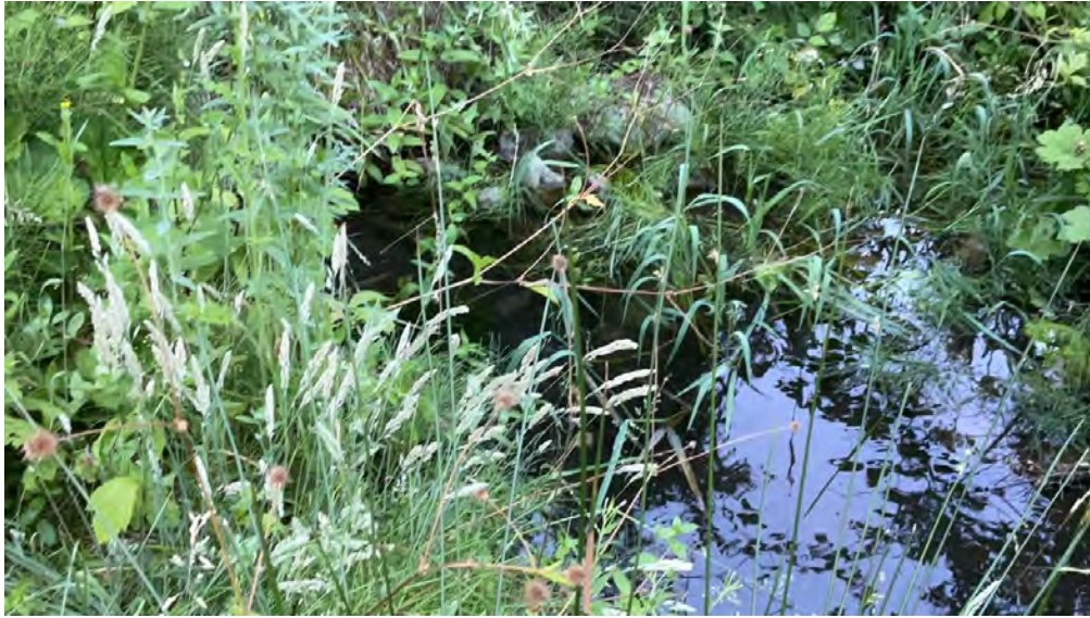
Figure 6. Point Feature 4 - Inlet channel from Corral Creek.