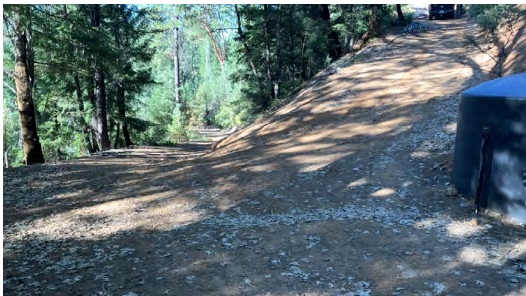
Figure 13. Point Feature 10 - Switchback in steep road to converted areas being used for cultivation-related activities.