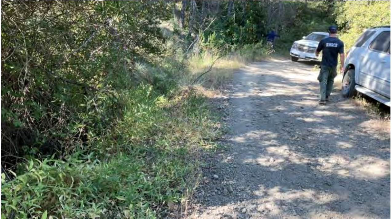
Figure 11. Point 6. Watercourse is diverted into road ditch due to lack of a crossing. The natural channel is abandoned downstream of the road. The road ditch directs the watercourse down and discharges into the next watercourse associated with Point 5, threatening sediment delivery.