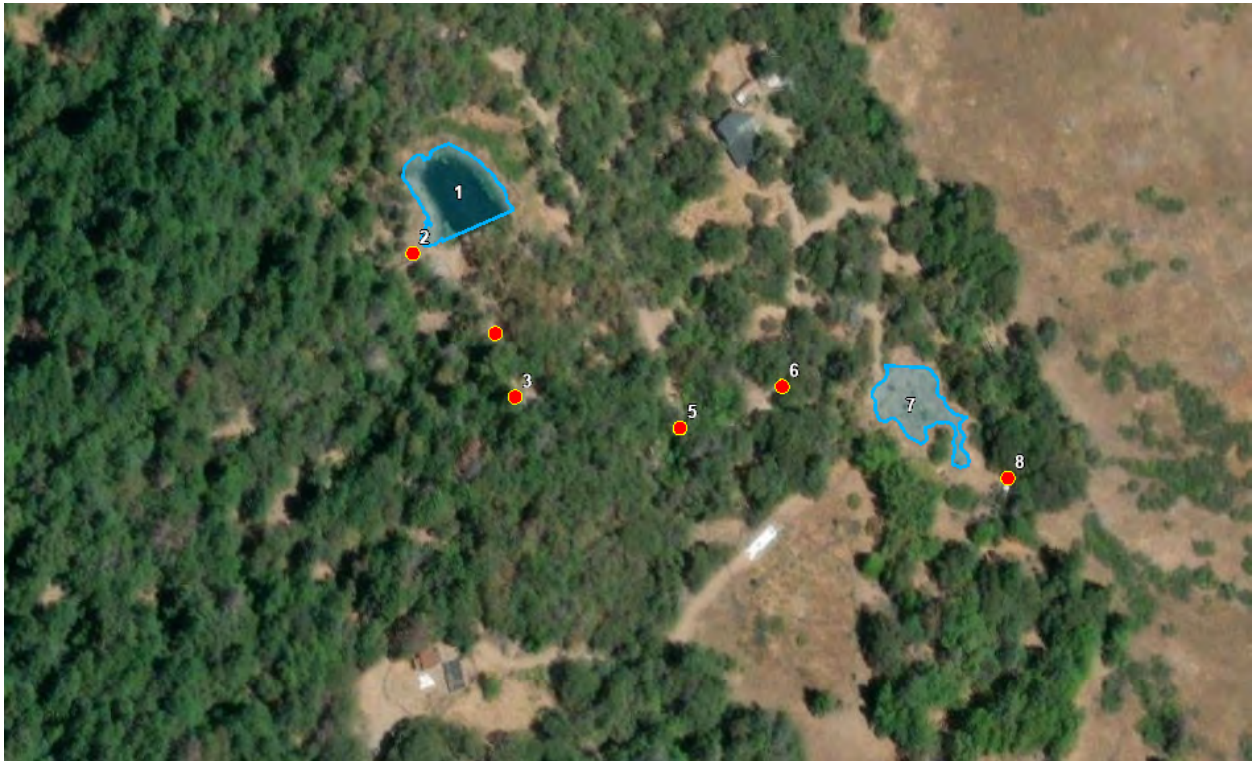
Figure 3. Inspection map with aerial imagery showing the point, line, and polygon feature locations of interest described in the text.