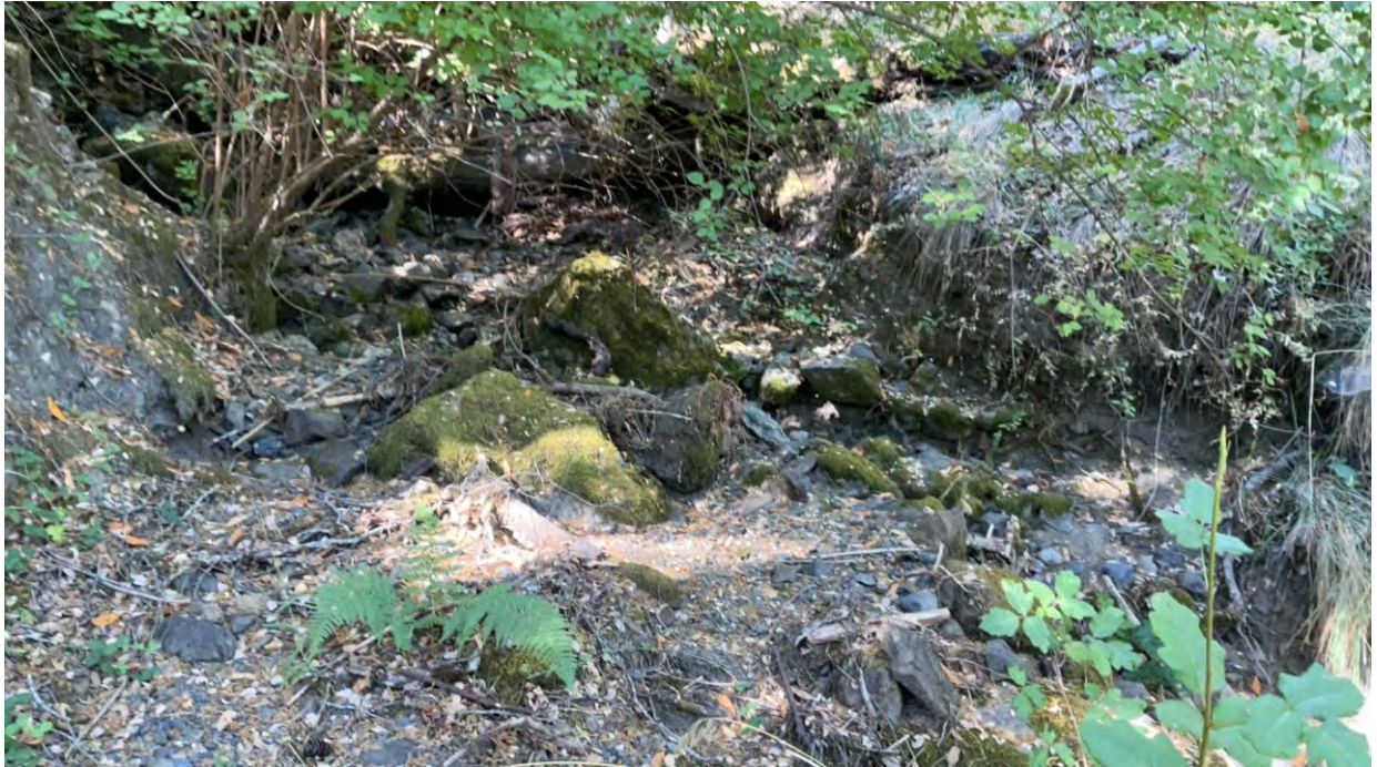
Figure 9. Point 5, upstream channel.