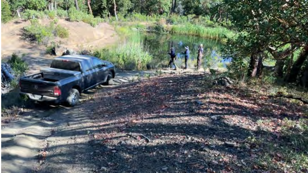
Figure 5. Polygon 1. Pond.