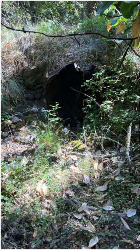
Figure 6. Point 5 culvert inlet.