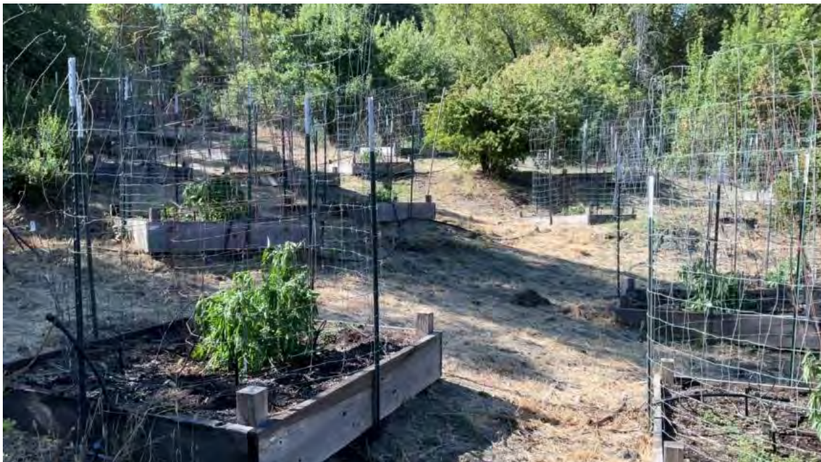
Figure 12. Polygon 7 outdoor cultivation area.