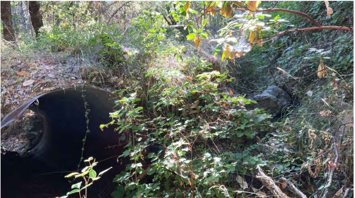
Figure 8. Point 5. Inside ditch delivers to watercourse at culvert inlet.