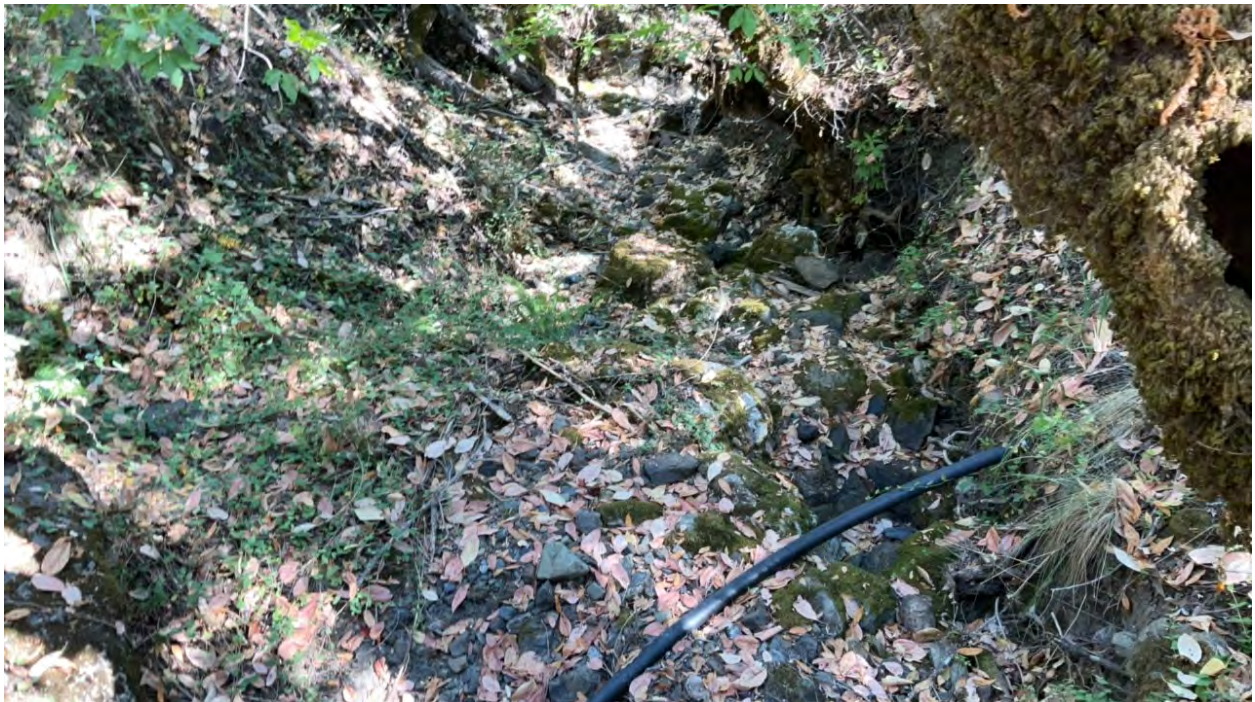
Figure 10. Point 5, downstream channel.