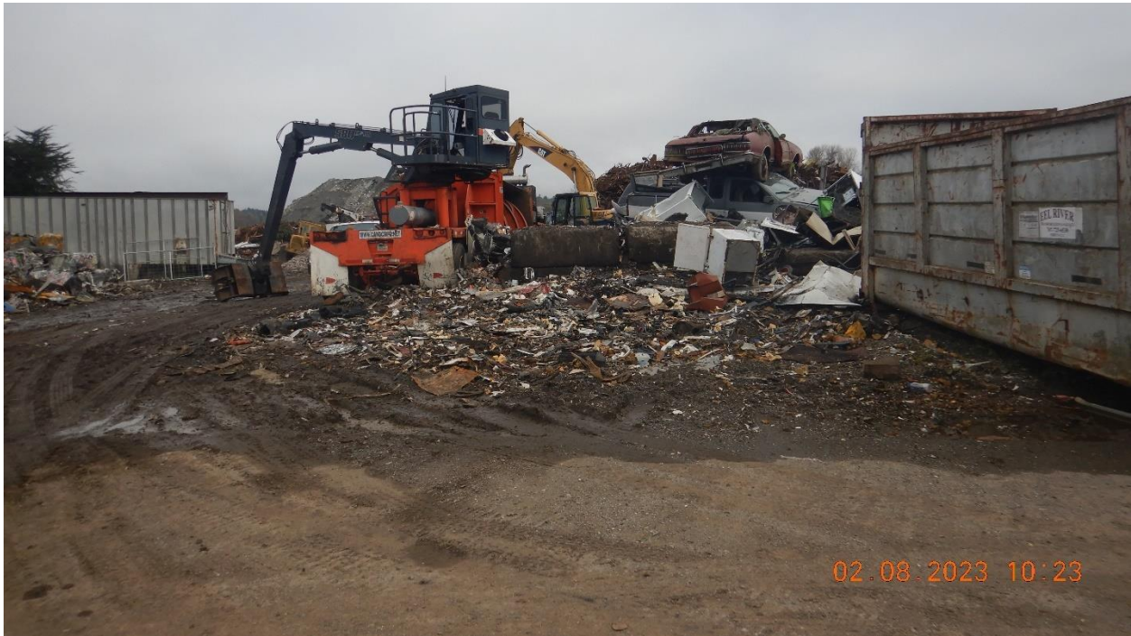
Picture 8- View of wastes on the ground with no BMPs in place. All dumpsters at the Facility are uncovered, in poor condition, and significantly rusty.