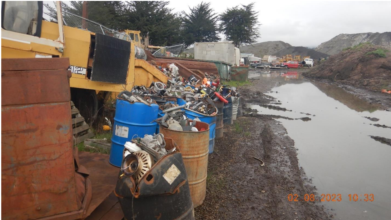
Picture 18 – Looking north at the ponded area within the west side of the Facility. The scrap metals are stored inappropriately in old/rusty barrels. These barrels are in poor conditions and not covered. Note- Background aggregate stockpiles are not associated with this Facility.