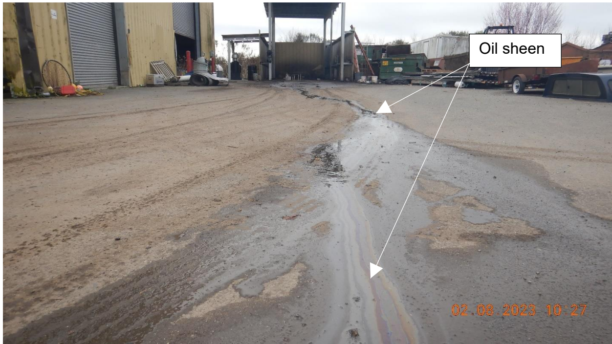
Picture 10 - View of non-stormwater runoff from truck washing area. Oil sheen was observed on the surface of runoff. Generated runoff within this paved area discharges to an onsite storm drain inlet. Pic