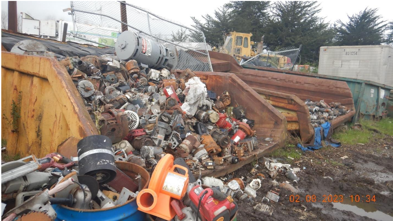
Picture 13 – View of the rusty auto parts and scrap metals that are stored in very old and rusty containments on the west side of the Facility. These storage bins are not sealed, and no lids or appropriate covers are provided.