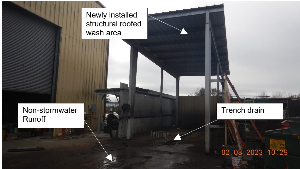
Picture 9- View of the newly installed structural covered area where the trucks are washed. Wash/rinse water (non-stormwater) is not fully captured within the existing trench drain that is connected to the oil/water separator.