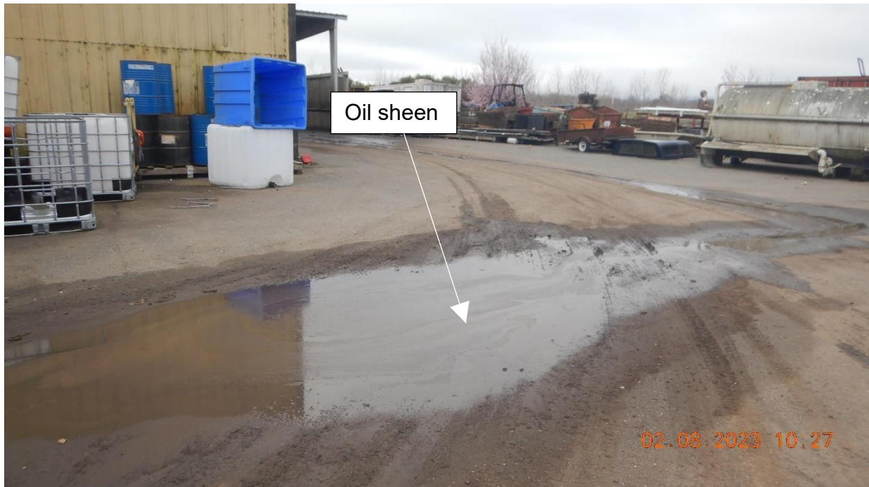
Picture 11 - View of oil sheen that was observed within a ponded area.