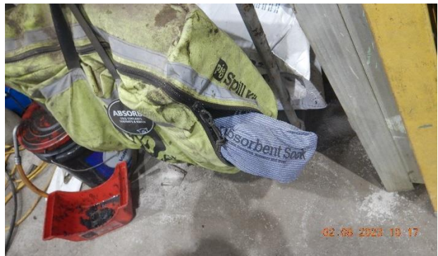
Pictures 7a, 7b – Picture of spill prevention kit including absorbent pads and socks.