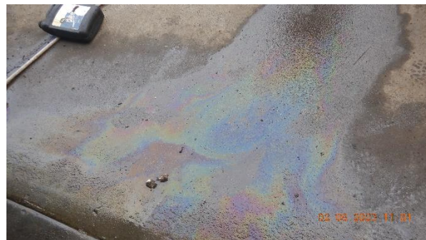
Pictures 17a, 17b – View of the fueling storage area. Oil sheen was observed within this area. No BMPs were present.