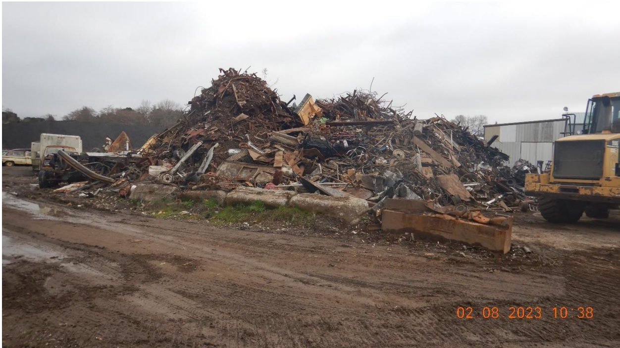
Picture 14 – View of scrap metals and wastes stockpile that are stored on the unpaved area. Source control is not implemented and no BMPs were observed to minimize the exposure to rain. The concrete blocks installed around the waste materials is not considered as a perimeter control BMPs and they are not effective.