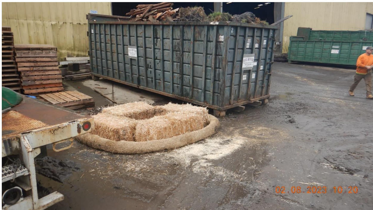
Picture 5- View of a storm drain inlet (sampling point) adjacent to an uncovered dumpster containing waste materials. Haybales and fiber rolls are used for inlet protection.