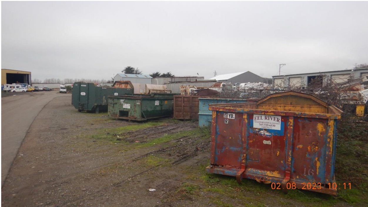
Picture 2- View of the old and rusty dumpsters on the east side of the Facility.