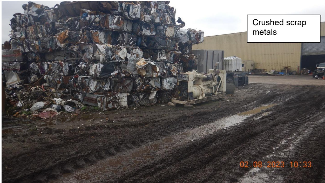
Picture 12 - View of the scrap metals that are baled/crushed and stored within the unpaved area. No BMPs observed to minimize the exposure of industrial materials (pollutant sources) to rain.