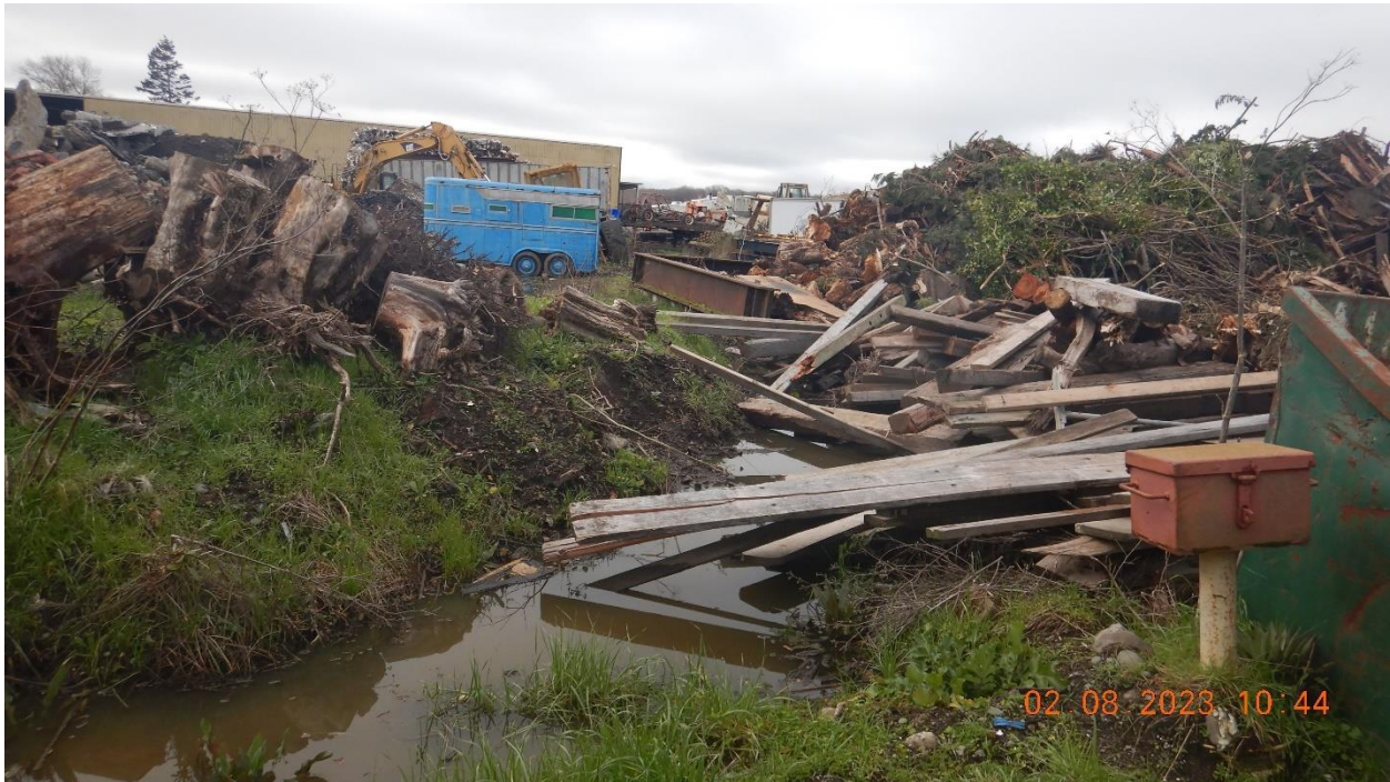
Pictures 16 – View of the existing drainage ditch. The ditch is buried under lumber and wastes and it is not maintained. No check dams were observed within the ditch as indicated on the site map. This drainage ditch eventually discharging off the site to Strongs Creek.