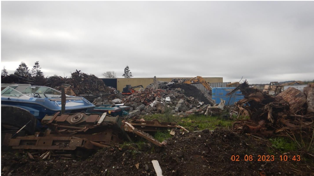
Picture 15 – View of the concrete and scrap metal stockpiles at the central portion of the Facility. Runoff from this area is discharged ton an on-site drainage ditch, that is in need of maintenance, before eventually discharging off the site to Strongs Creek.