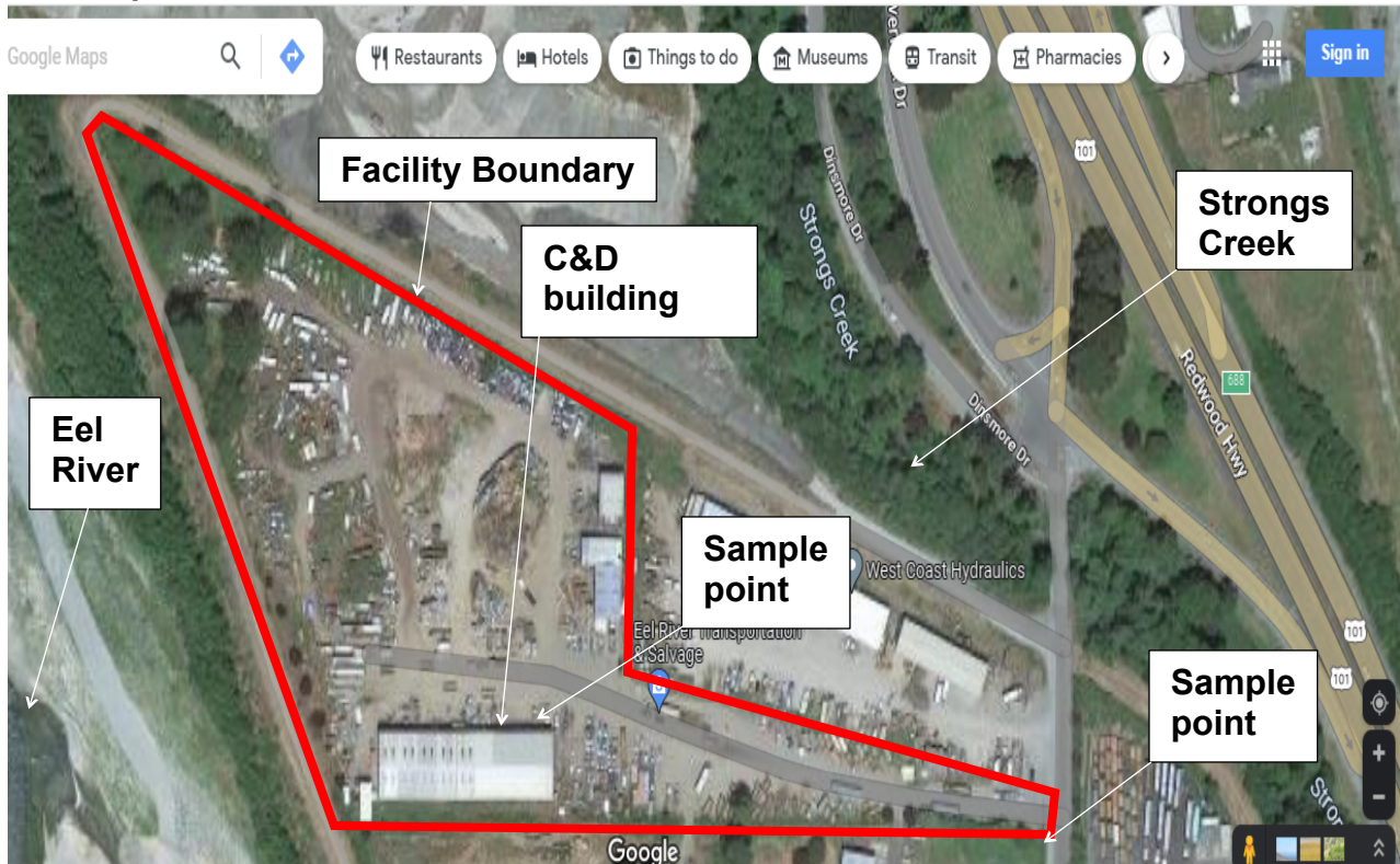
Picture 19 – Site map shows the location of the immediate receiving water (Strongs Creek) and Eel River and sample points.