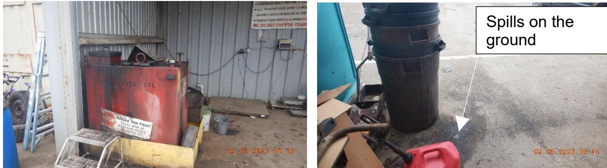
Pictures 4a, 4b - View of the fueling tank and secondary containment stored within a roofed area. Hydrocarbon spill was observed within this area.