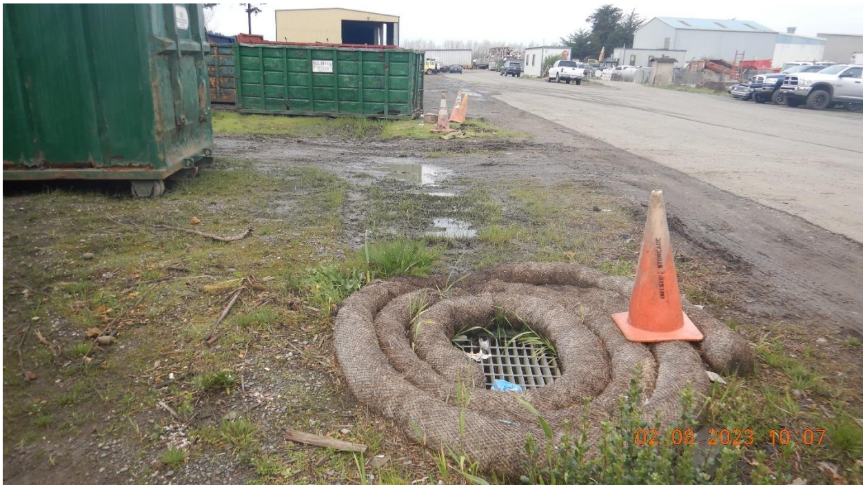
Picture 3- Looking west at the on-site storm drain inlet on the east side of the Facility.