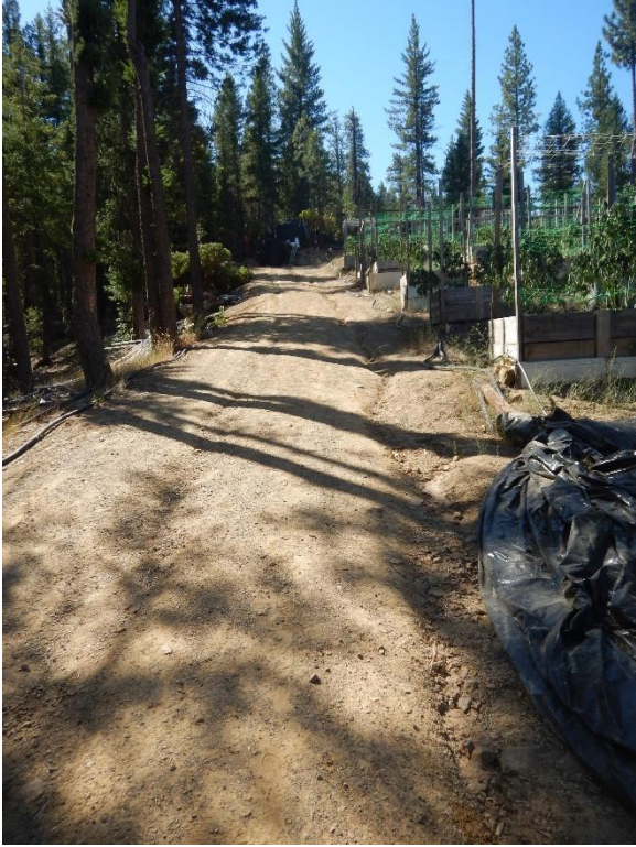
Photo 3: Cannabis plants in raised beds adjacent steep, dirt access road with ruts.