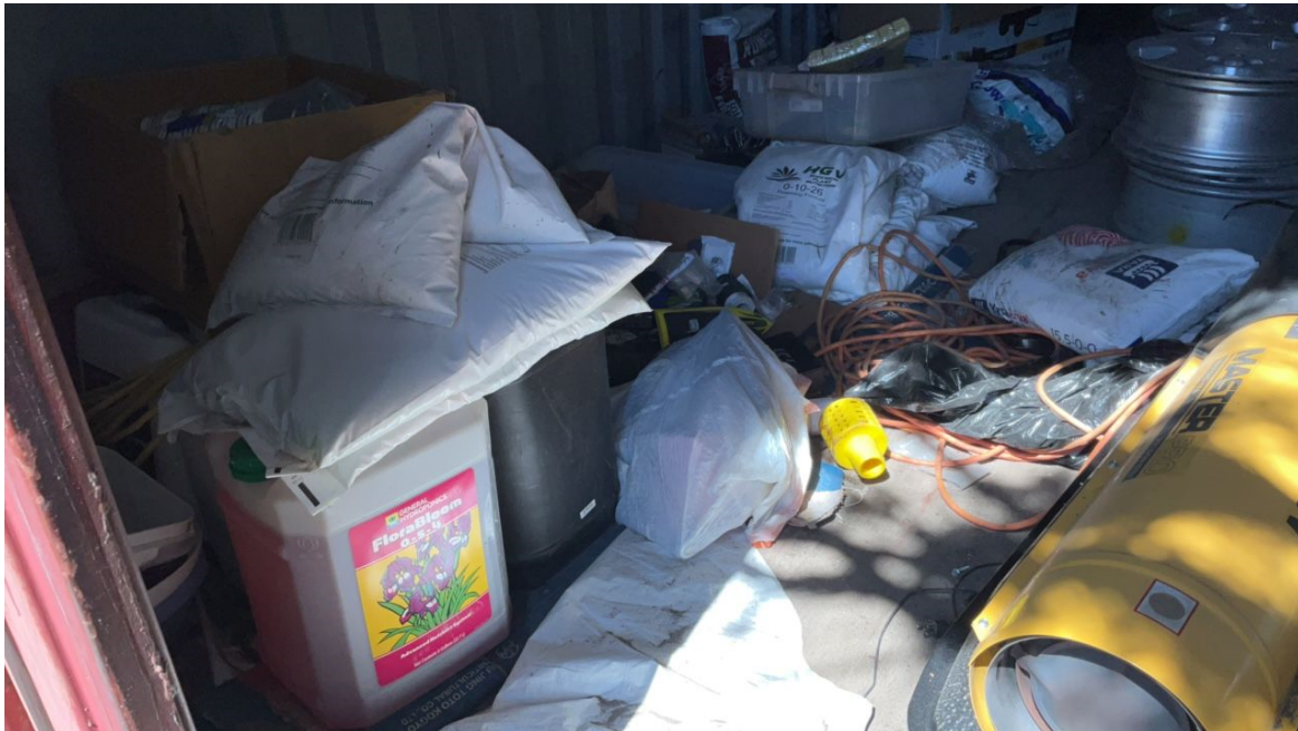
Figure 3. Point Location 1 is fertilizer stored in a shipping container.