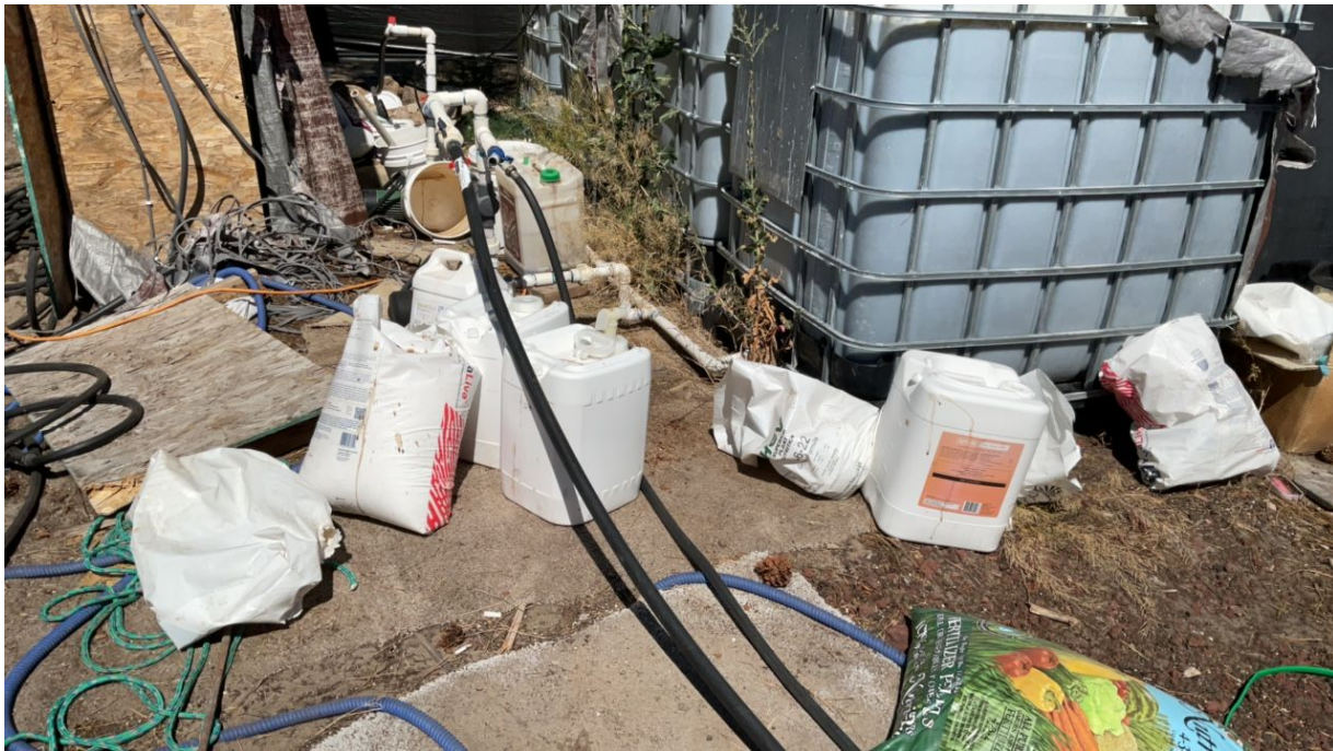
Figure 6. Feed tanks and fertilizers at Point Location 3.