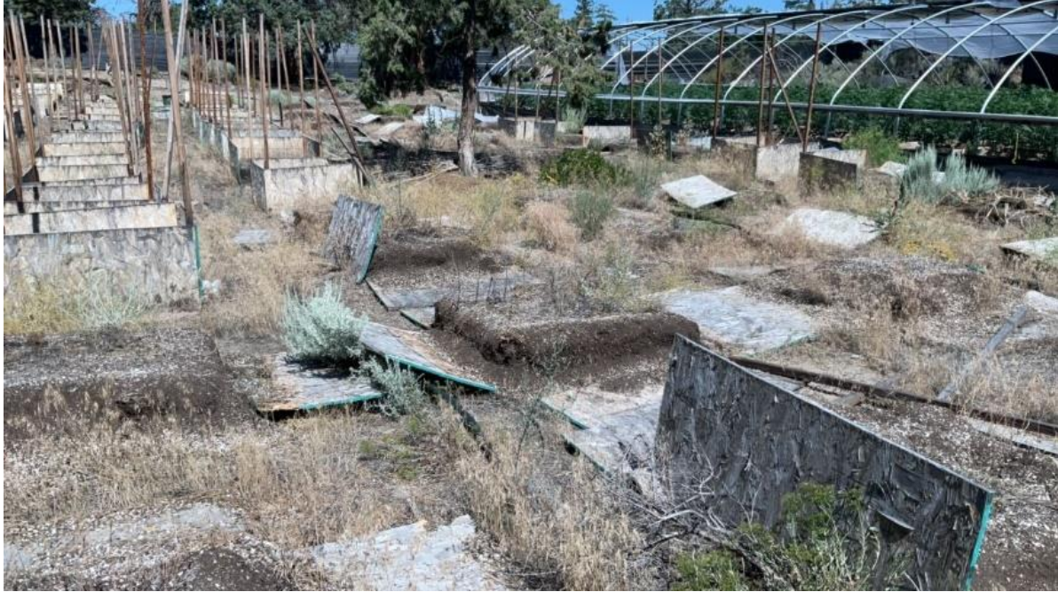
Figure 11. Polygon 6 is inactive outdoor cultivation area.