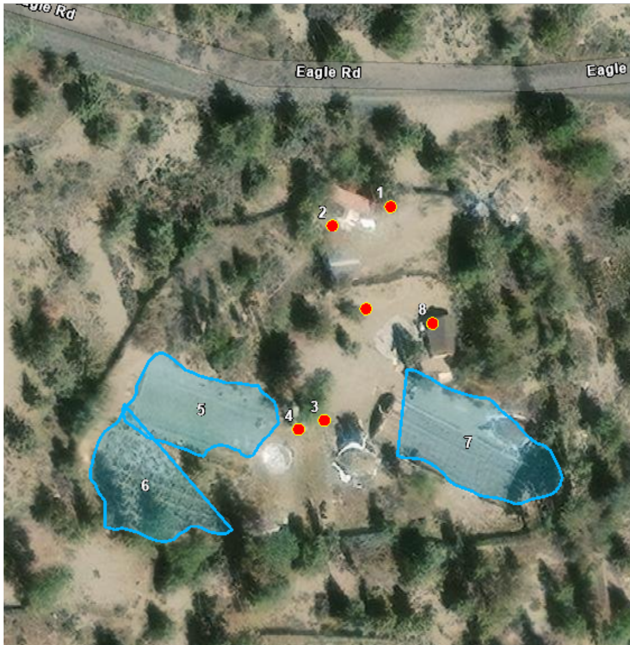
Figure 2. Inspection map.