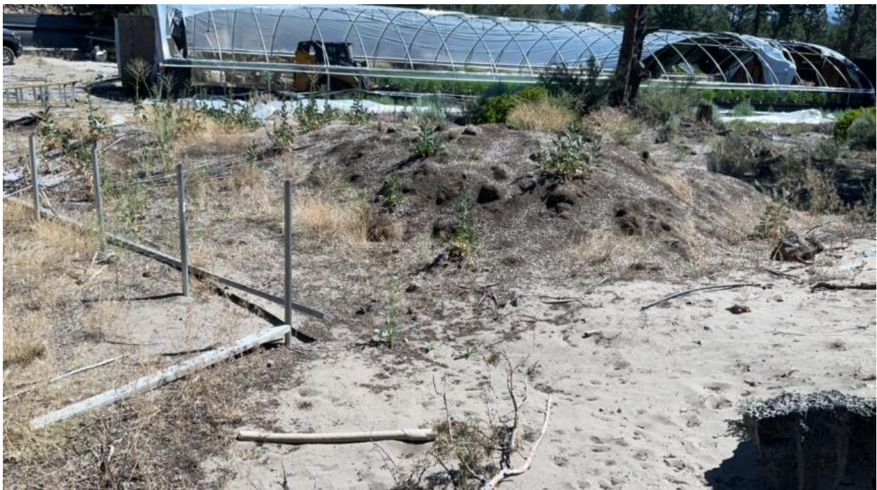
Figure 8. Potting soil pile on native sand soil at Location 4.