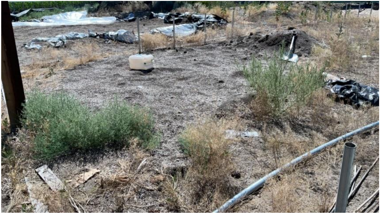
Figure 7. Potting soil pile on ground at Location 4.