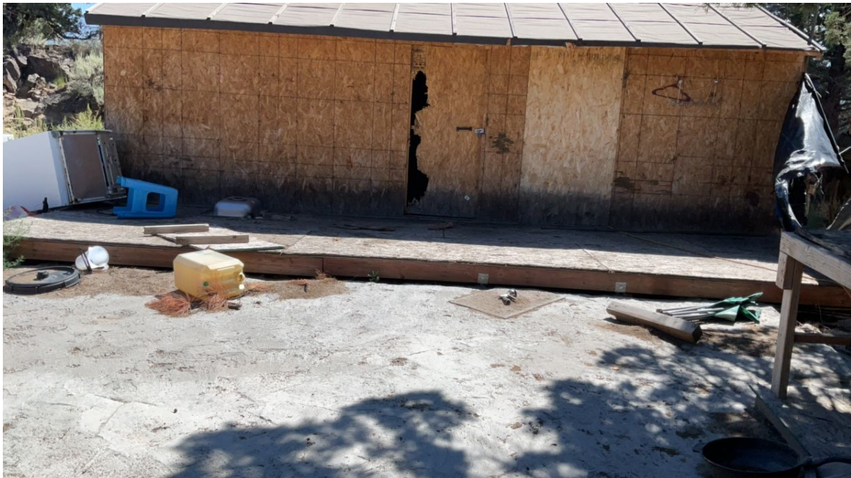
Figure 12. Building at Point Location 8.