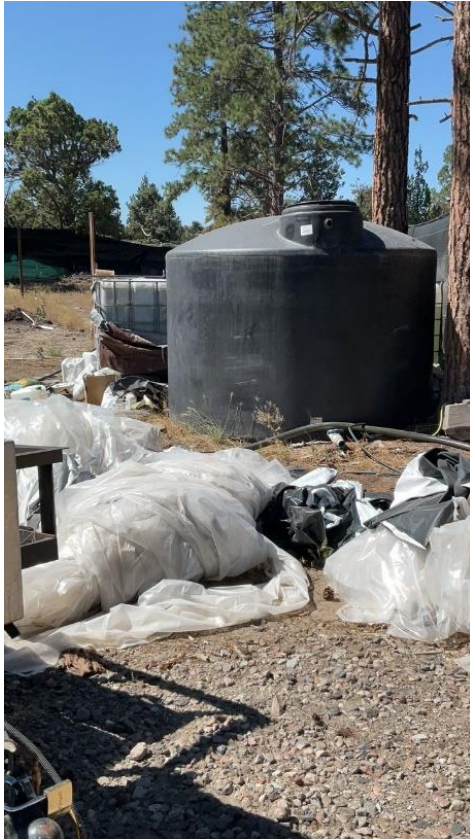
Figure 5. Water tanks and plastic refuse at Point Location 3.