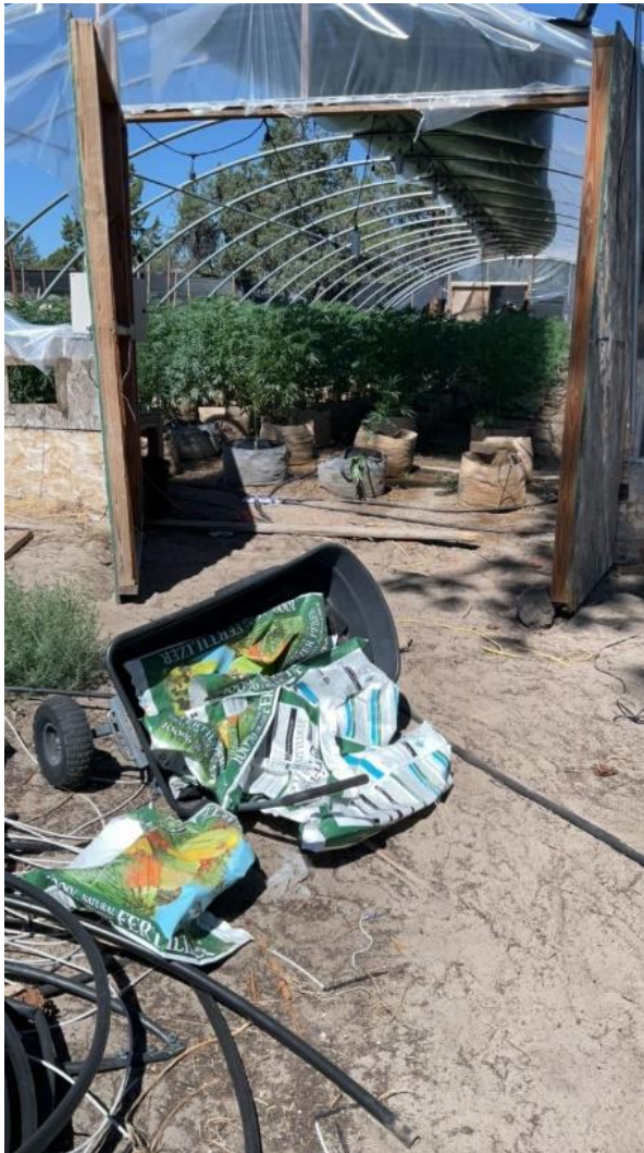
Figure 9. Polygon Location 5 is a greenhouse cultivation area.