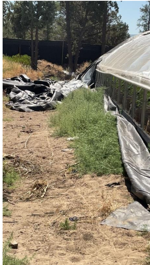
Figure 10. Polygon 7 is an active greenhouse cultivation area.