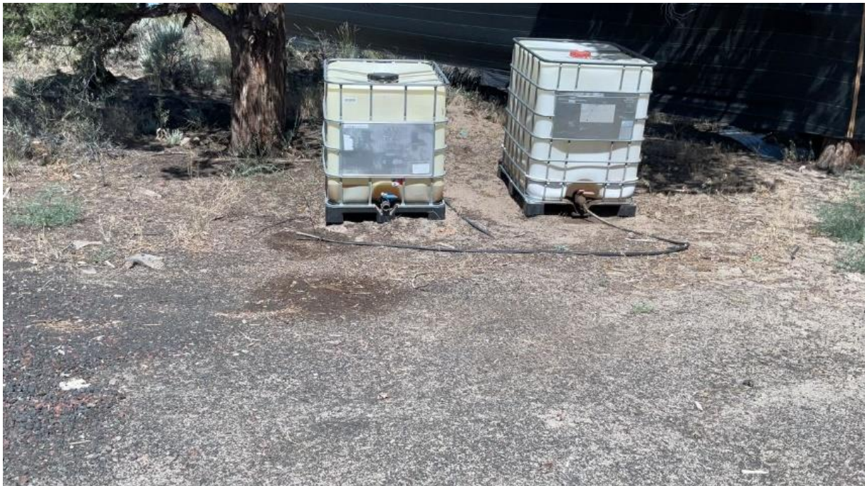
Figure 4. Feed tanks are located at Point Location 2. I observed stained ground indicating discharge of nutrient rich water to land from the feed tanks, posing a threat to groundwater.