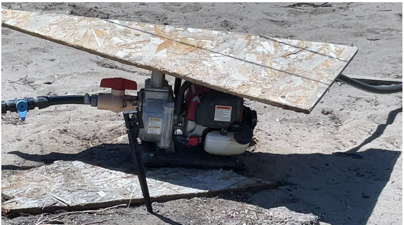
Figure 8. Gas pump located at Point Location 7 does not have containment to prevent drips and spills onto the sandy ground.