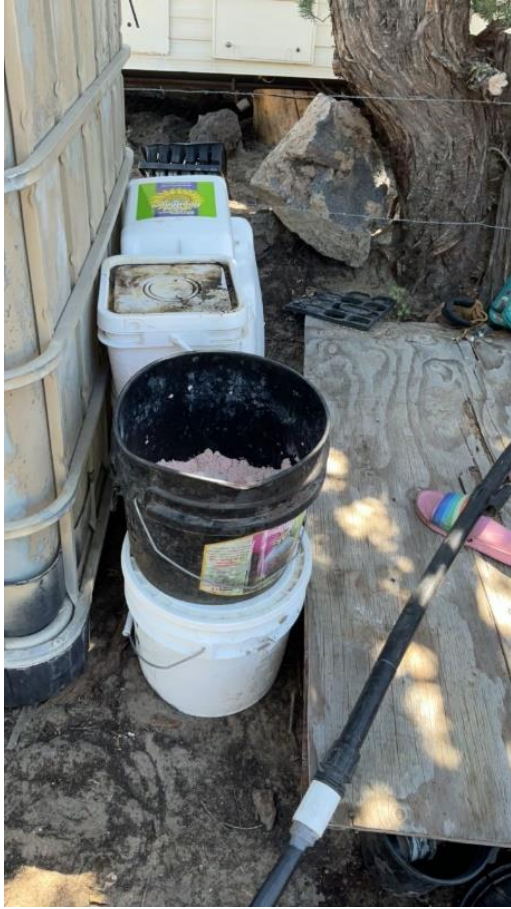
Figure 9. Open contain of high concentration water soluble fertilizer next to a feed tank and water line at Point Location 8.