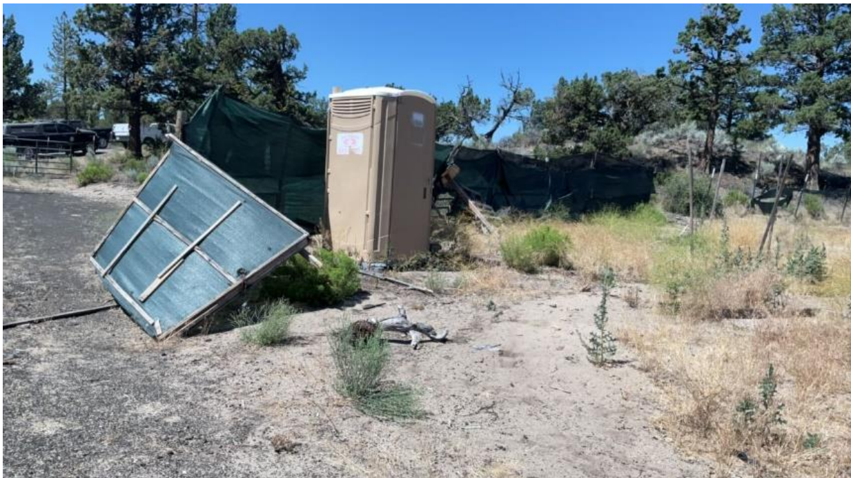
Figure 5. A portopotty is located near the gate at Point Location 3.