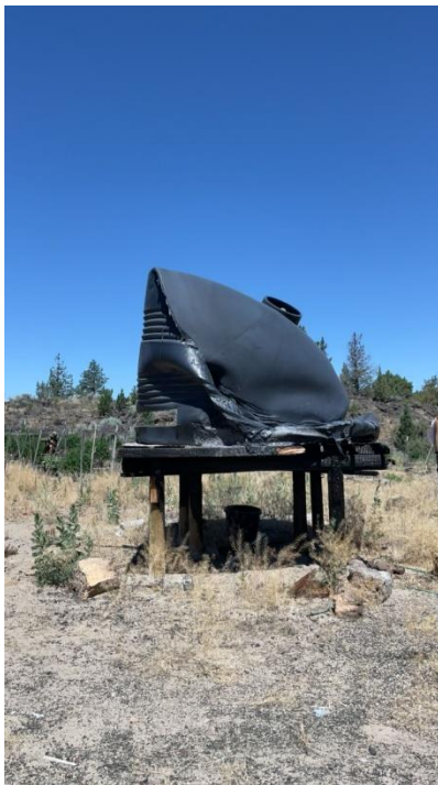
Figure 3. Point Location 1 is melted water tank