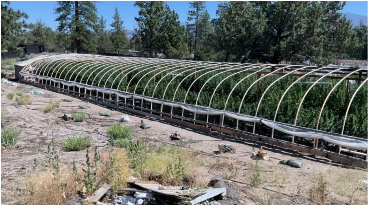
Figure 7. Active greenhouse cultivation at Polygon Location 6.