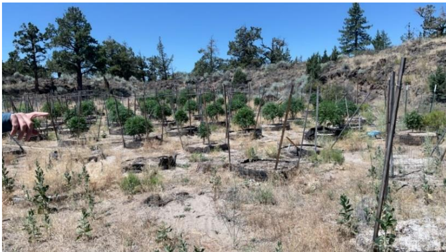
Figure 11. Active outdoor cultivation area at Polygon Location 9.