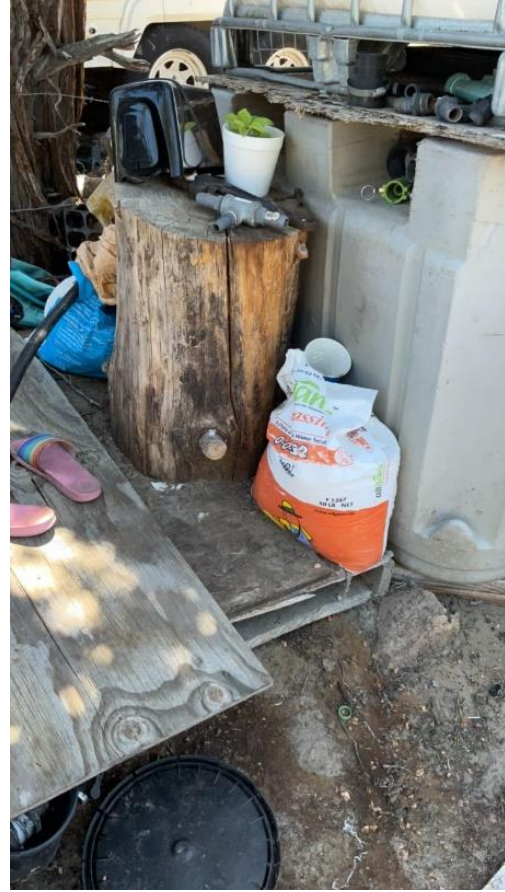
Figure 10. Uncontained and open bag of water soluble sulphate next to the water line at Point Location 8.