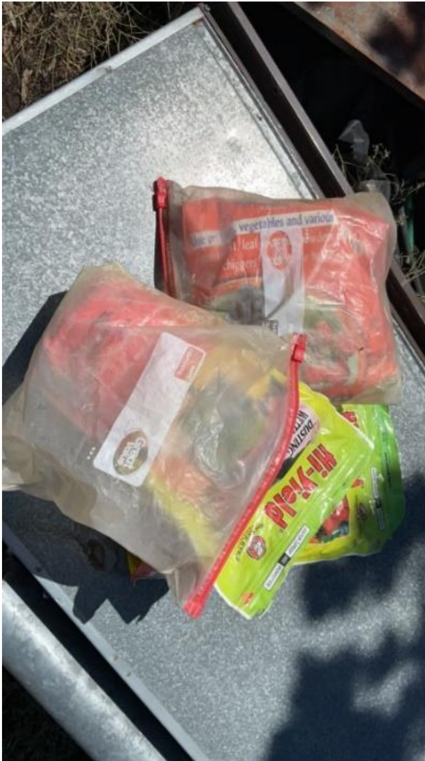
Figure 6. Uncontained Sulphur group fungicide at Point Location 5.