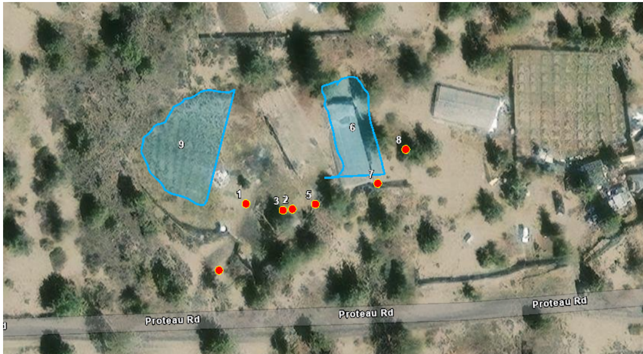
Figure 2. Inspection map.