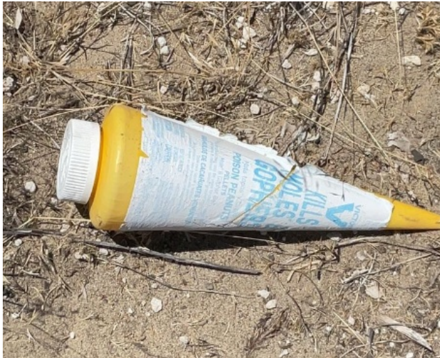
Figure 12. Gopher killer located in outdoor cultivation area at Polygon Location 9.