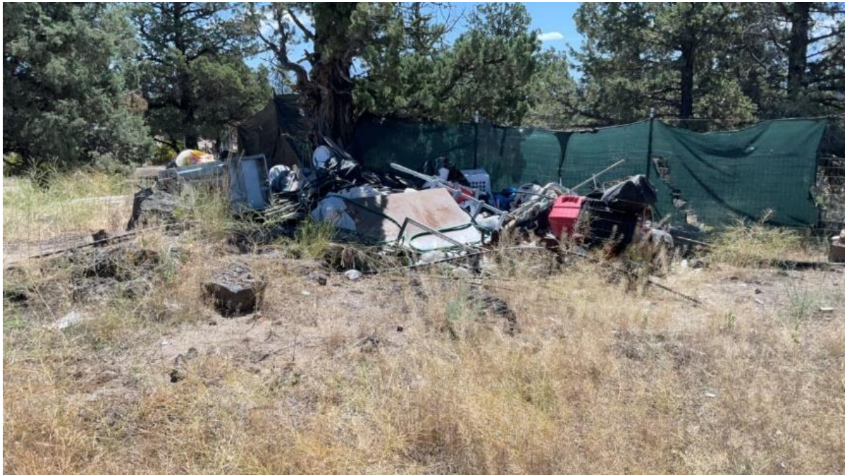
Figure 4. Cultivation-related and household refuse is uncontained at Location 2.