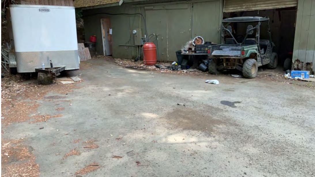
Figure 4. Point 1. Structure with small indoor.