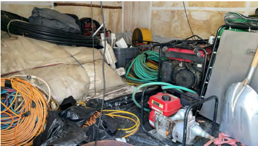
Figure 11. Point 3. Generators and equipment within structure.