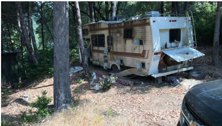
Figure 20. Polygon 9. RV at cultivation area CA3.