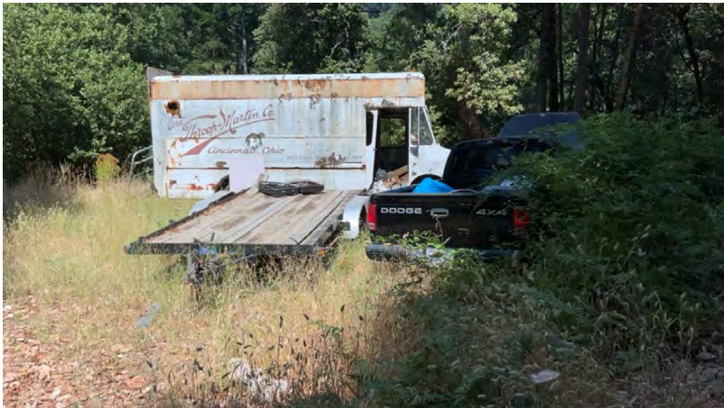
Figure 22. Point 10. Vehicles.