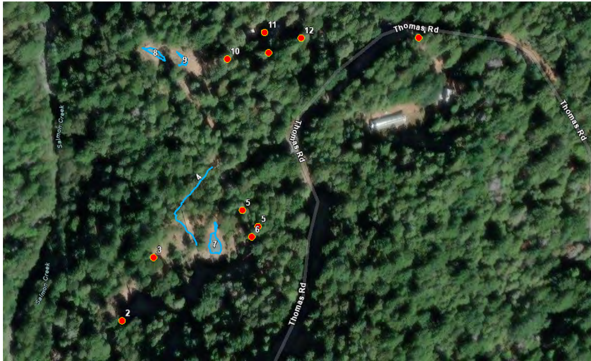
Figure 2. Inspection map with aerial imagery showing the point, line, and polygon feature locations of interest shown in the following photos.