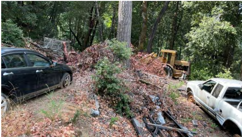
Figure 6. Point 2. Junked vehicles.