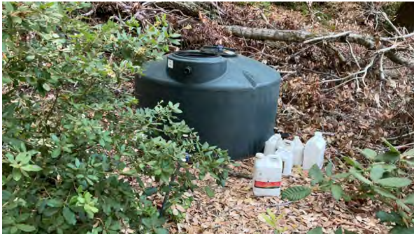
Figure 14. Point 5. Feed tank with open top and uncontained fertilizer jugs, located in swale.