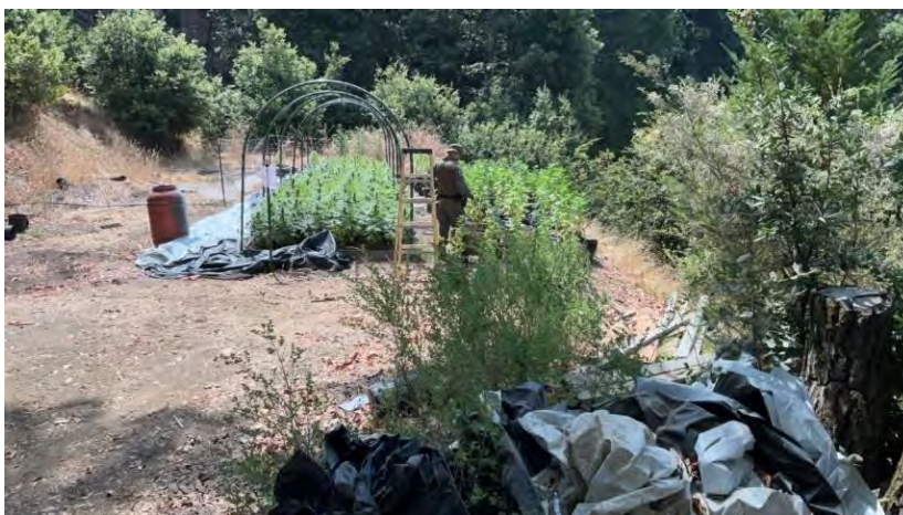
Figure 16. Polygon 7. Cultivation area (CA1).