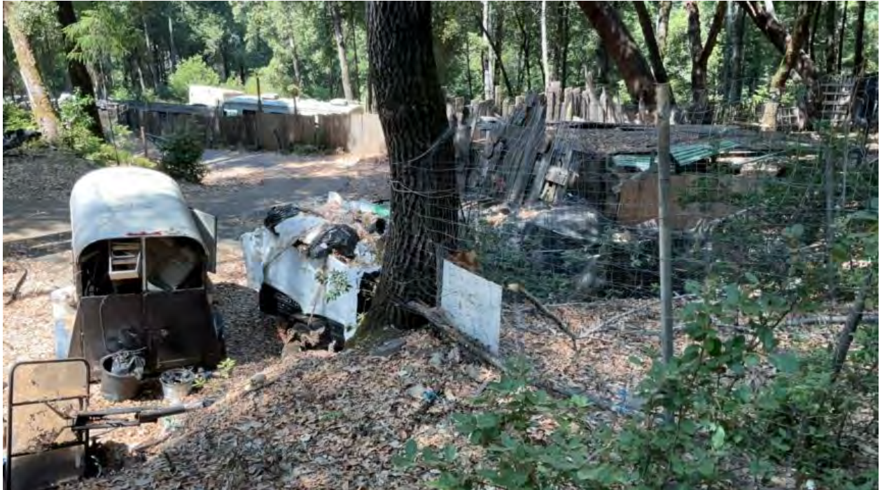
Figure 24. Point 12. Refuse accumulation.