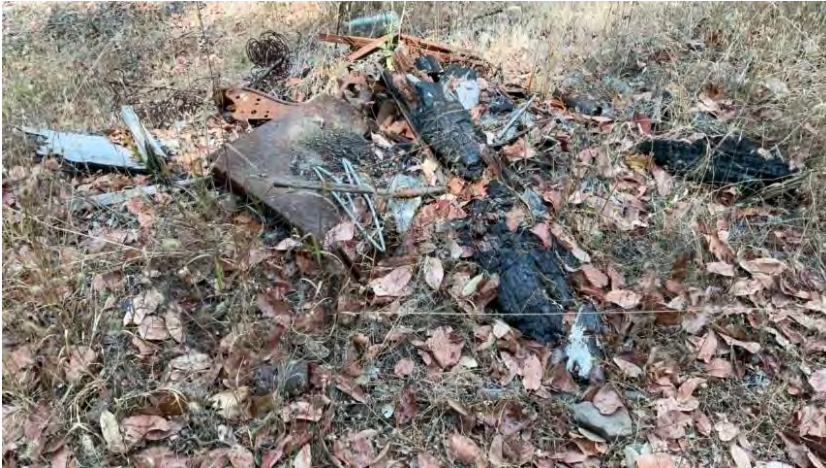
Figure 9. Burn pile with metal.