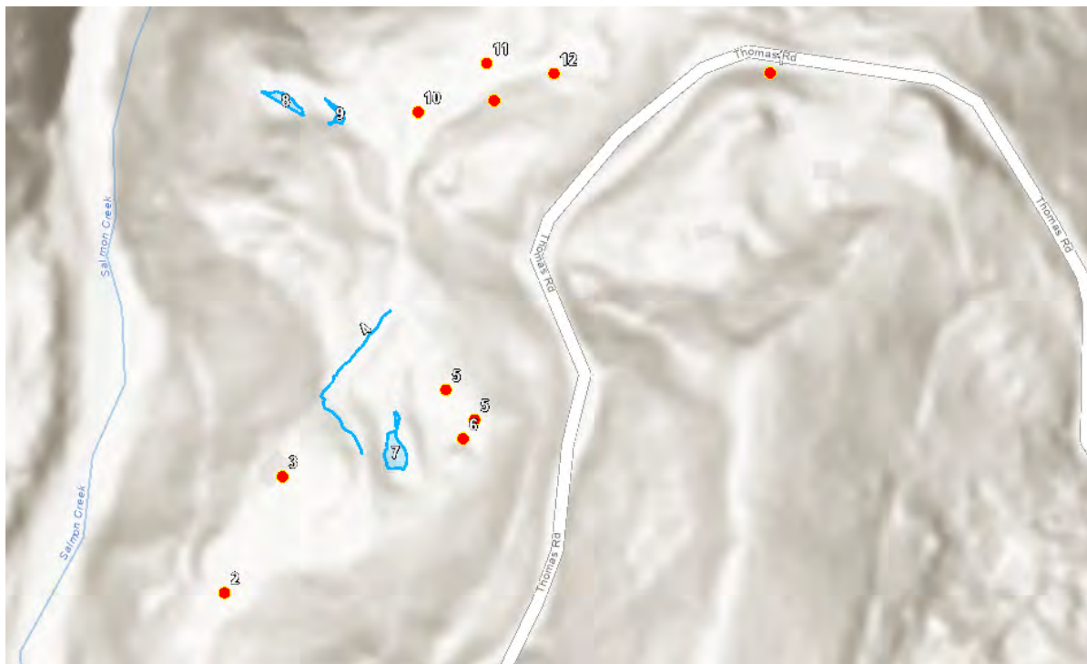
Figure 3 Inspection map with terrain showing features of interest shown in the following photos.