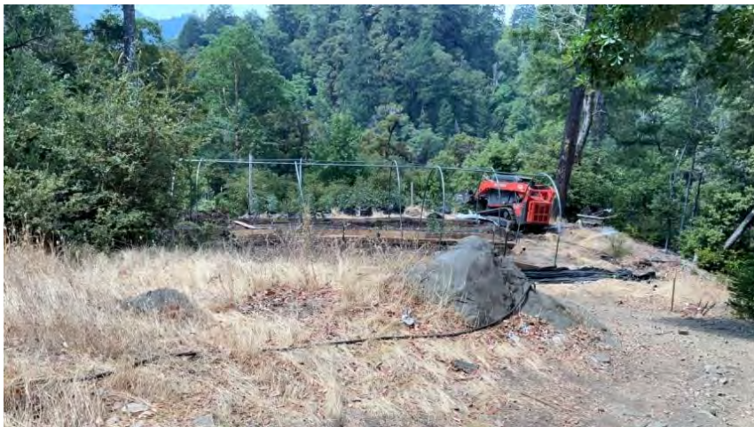
Figure 18. Polygon 8. Cultivation area CA2.