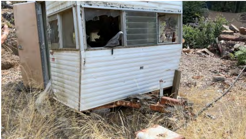
Figure 17. Trailer at CA1.