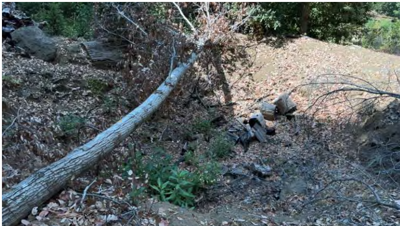
Figure 15. Point 6. Pit.