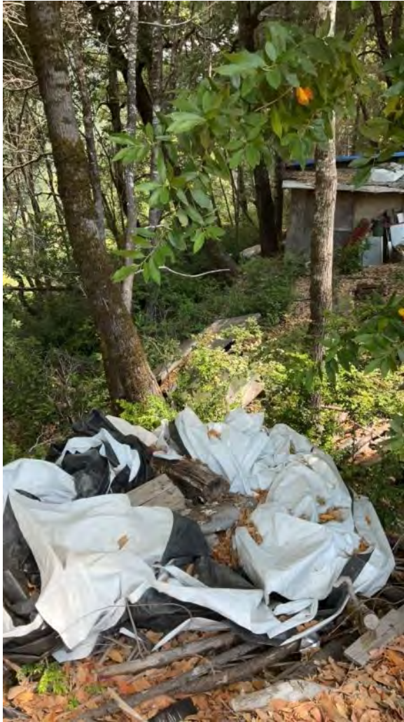
Figure 19. Plastic refuse over slope from CA2.