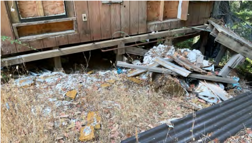
Figure 10. Point 3. Structure.