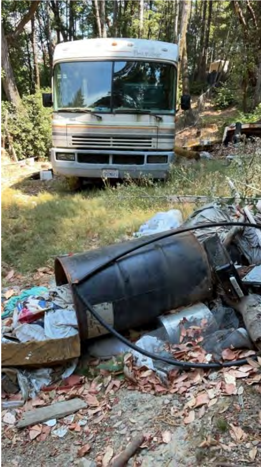
Figure 23. Point 11. Trash and RV.