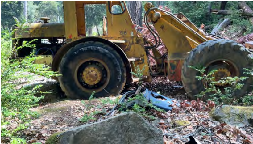
Figure 7. Point 2. Tractor.