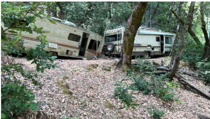
Figure 8. Point 2. RVs.