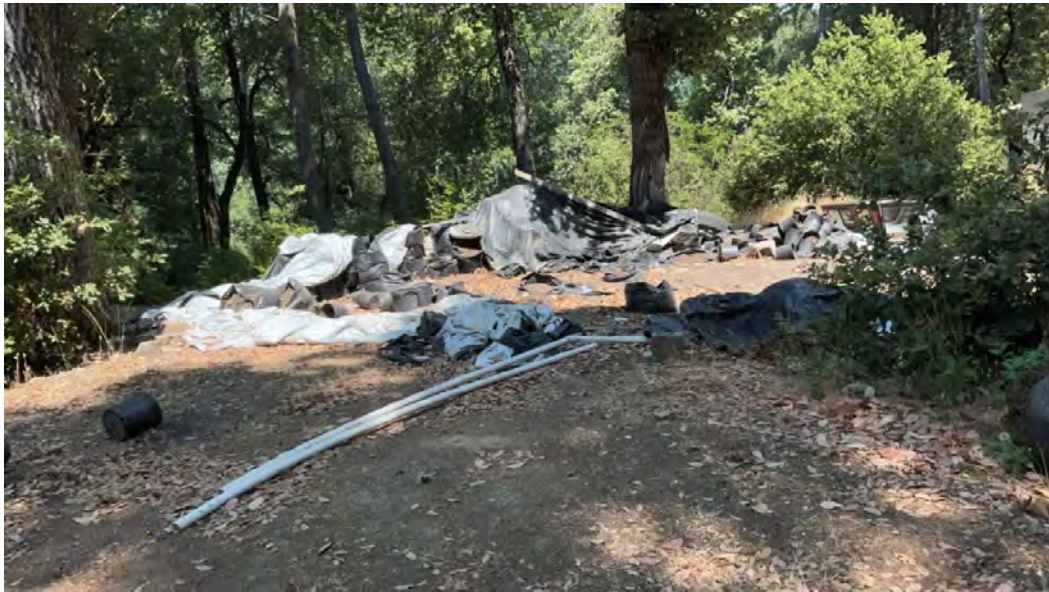
Figure 21. Point 10. Cultivation-related refuse.