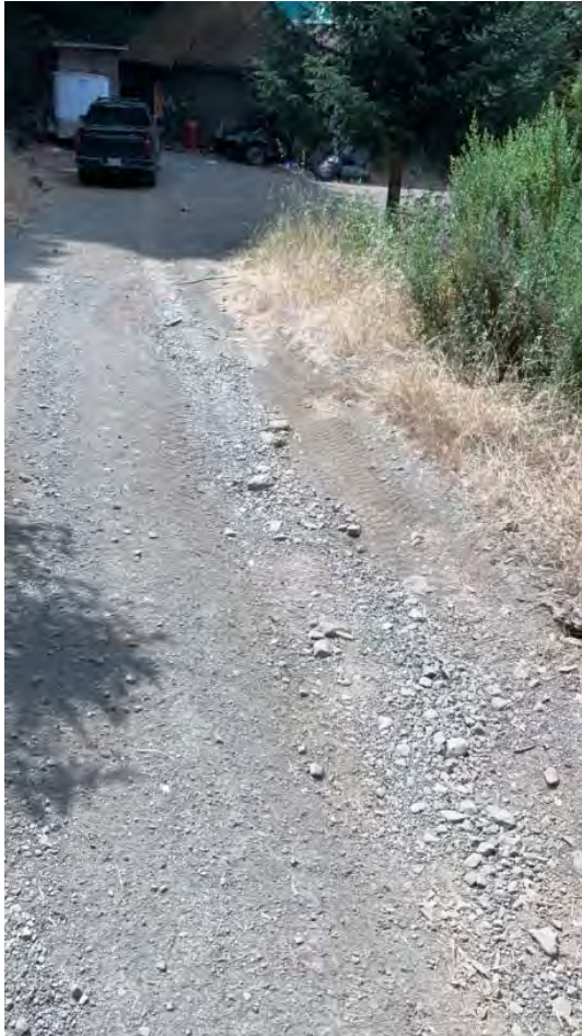
Figure 12. Line 4. Rilled road surface.