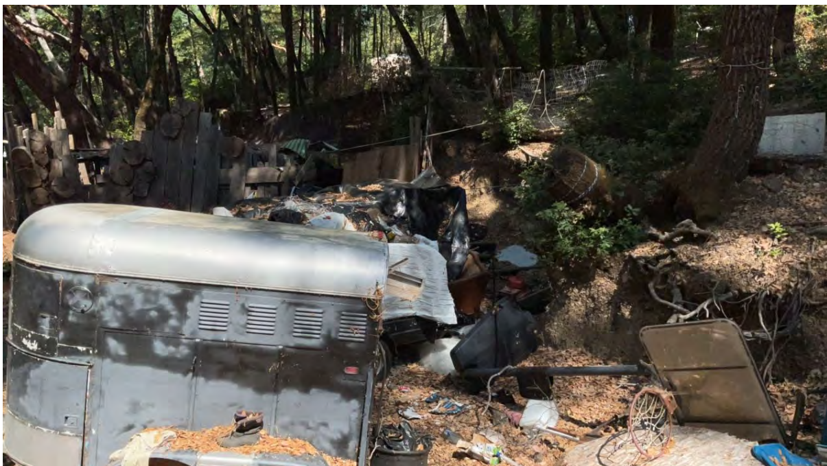
Figure 25. Point 12. Refuse accumulation.