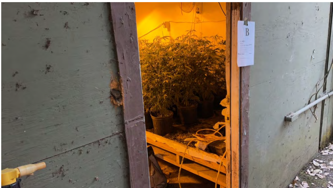
Figure 5. Point 1. Structure with small indoor.