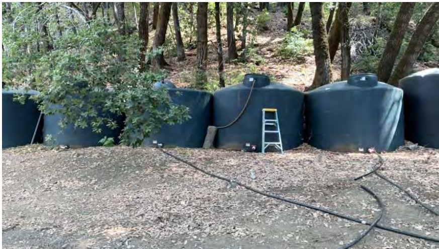
Figure 13. Point 5. Water storage tanks.