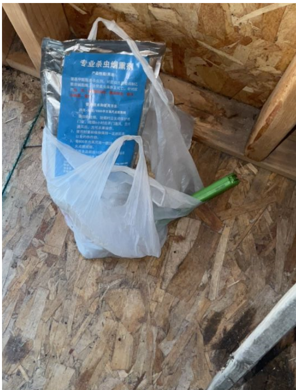
Figure 8. Imported pesticides not approved for use in the United States were observed at Point Location 4.