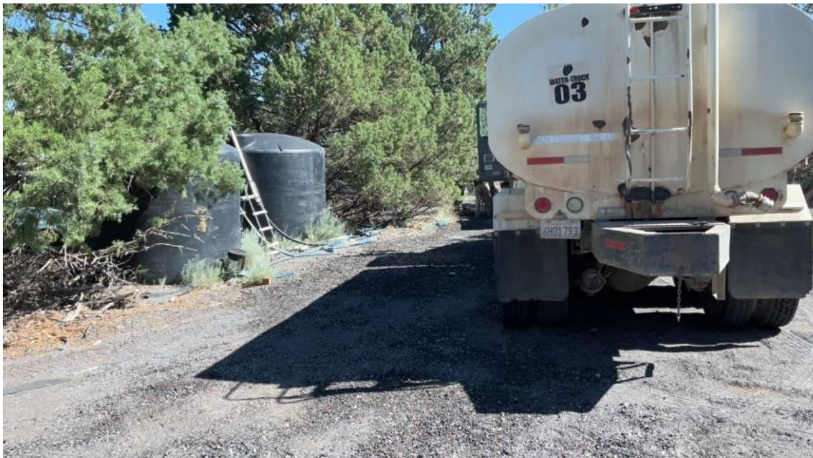
Figure 4. At Location 2 there were two water storage tanks and a water truck.