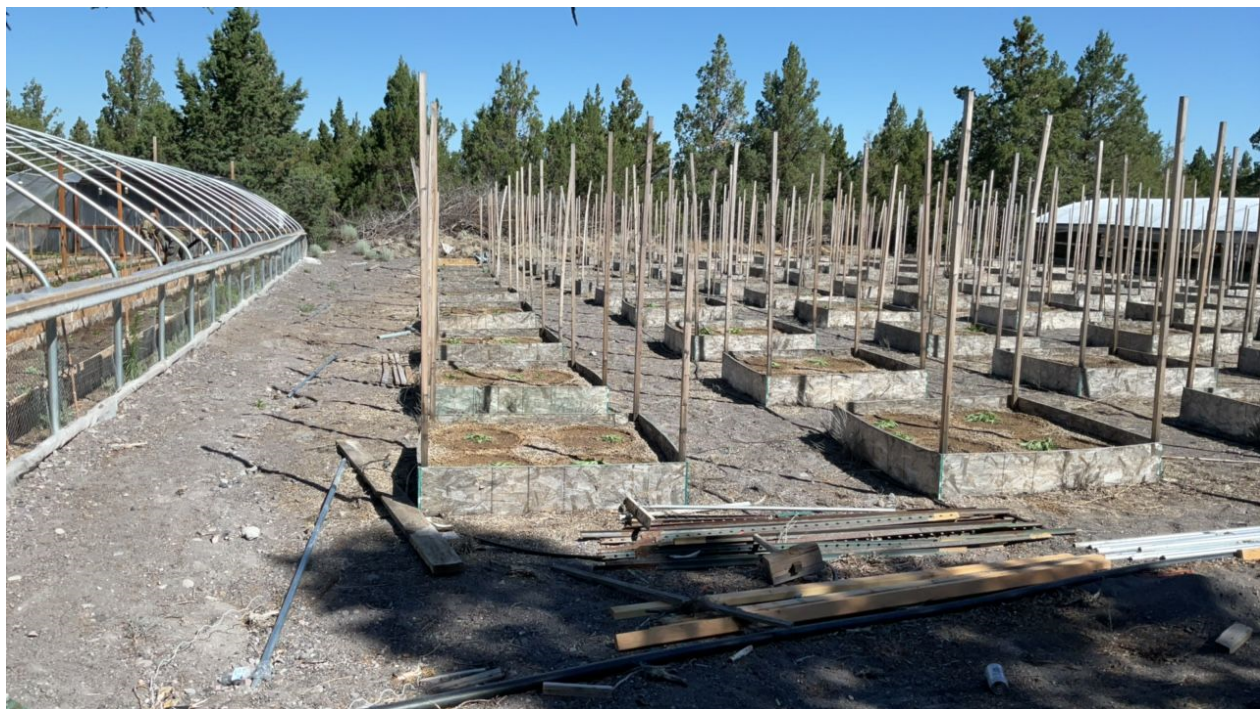
Figure 6. Cultivation area at Polygon Location 4 had recently been planted in small plants.