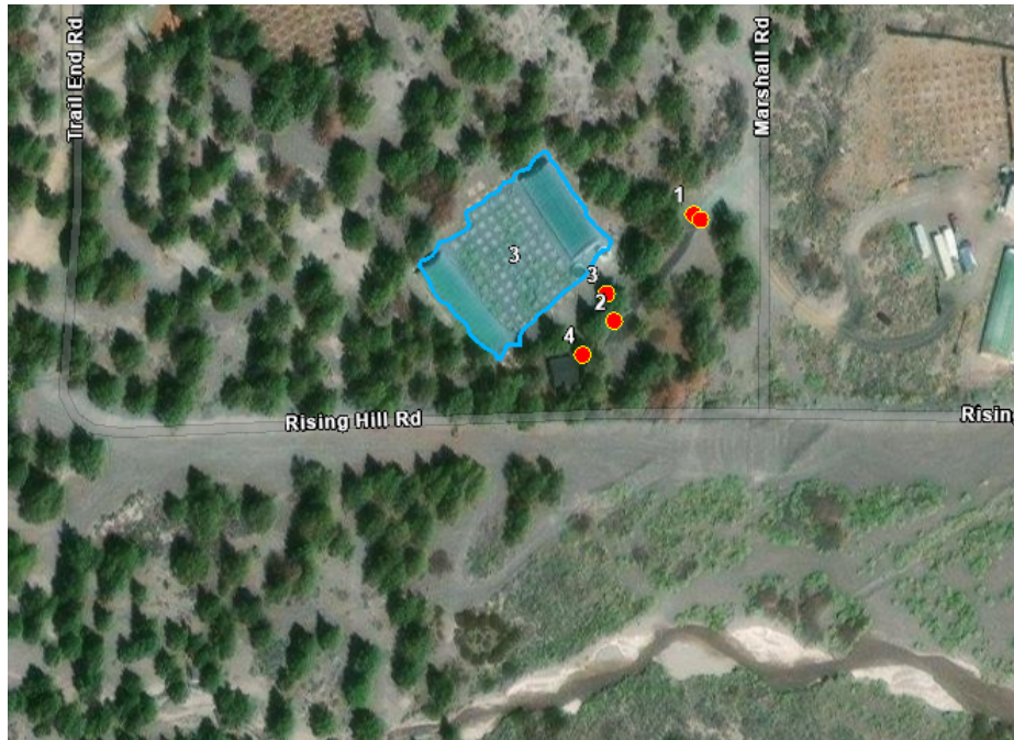
Figure 2. Inspection map with location markers discussed in text. The Property is located adjacent to Whitney Creek, which is fed by runoff from Whitney Glacier located on the north side of Mount Shasta. In the area of the Property, I observed that Whitney Creek has sand substrate and a broad channel migration area which numerous braided channels. Shifts in the historic flow paths of the braided channels appear to have resulted from channel migration and the construction of the subdivision and earthen berms along the southern boundary.