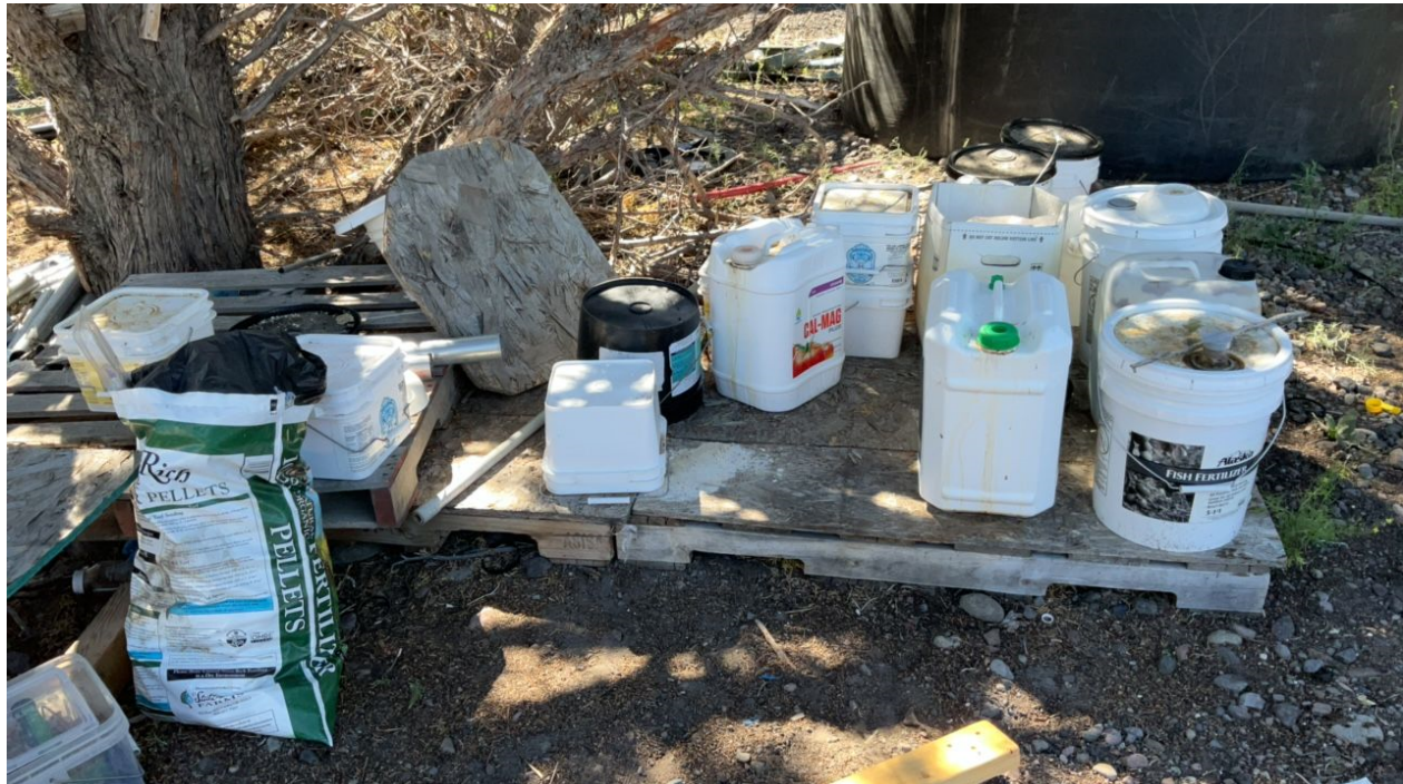
Figure 5. Fertilizers stored next to water tank without adequate containment were located at Point Location 3.