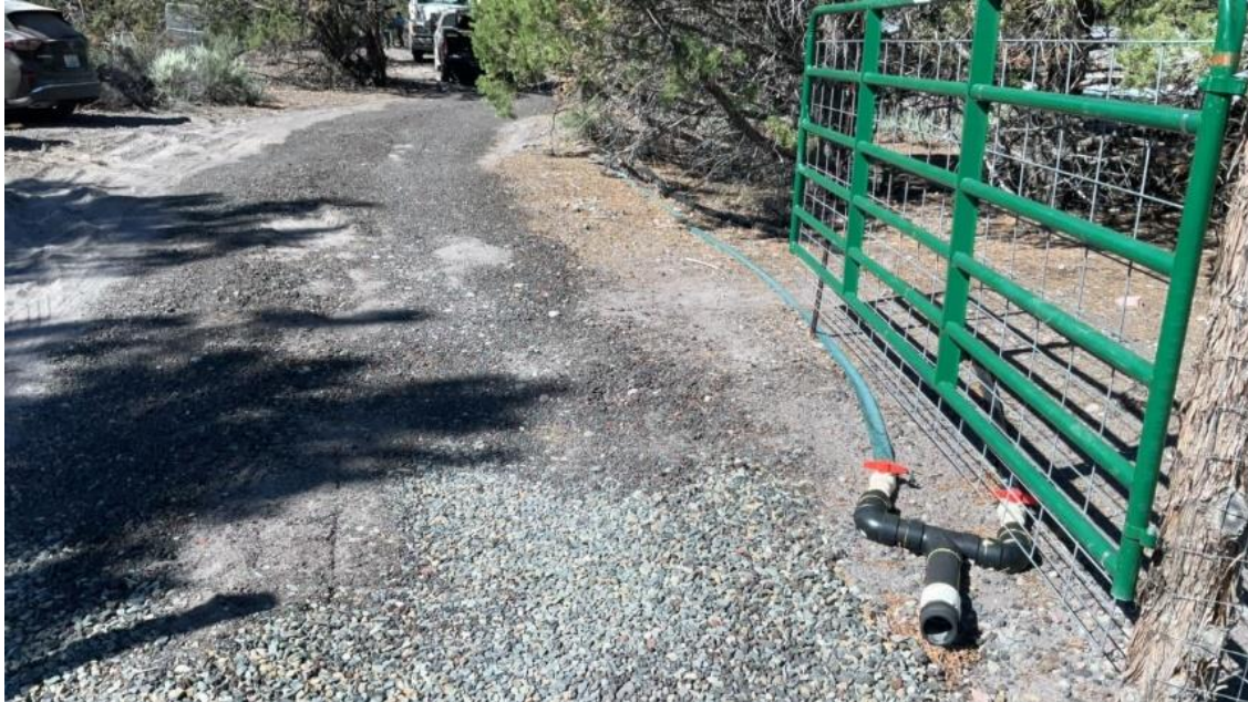
Figure 3. At the gate entrance to the Property (Location 1) there was a hookup for a water truck to delivery water.