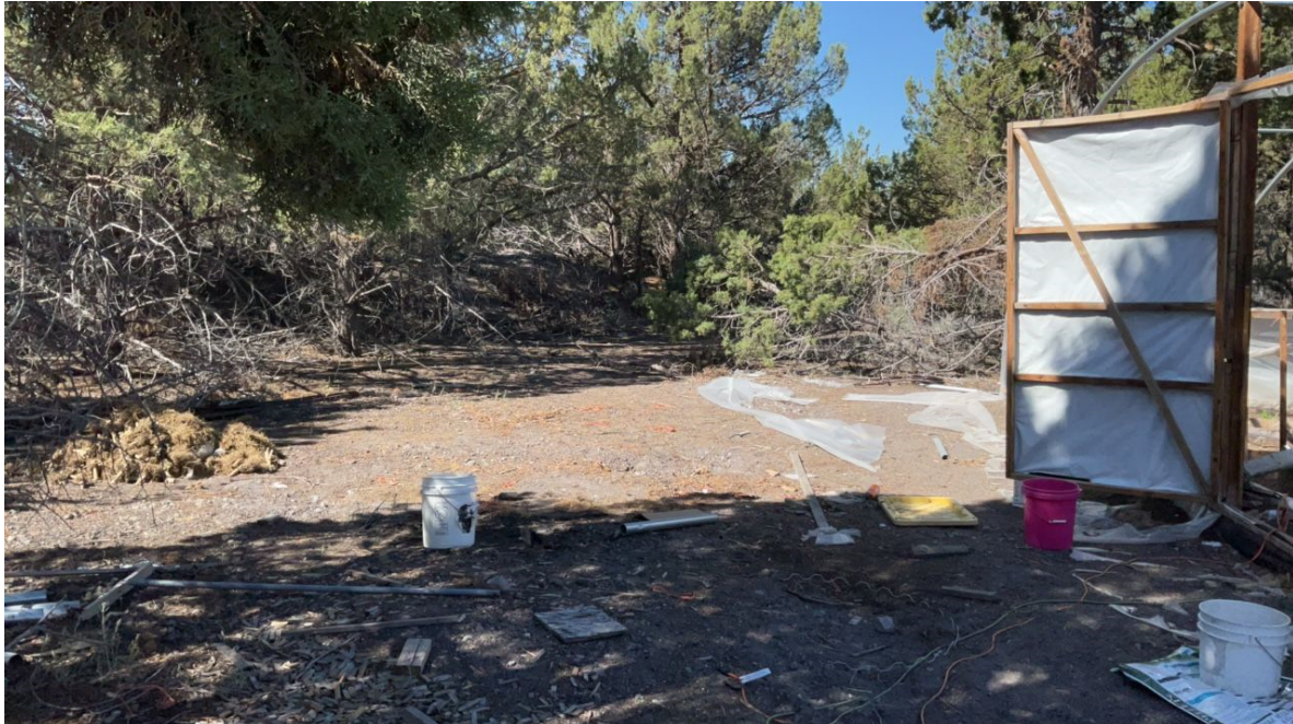
Figure 7. Fertilizer containers and disturbed soil area at cultivation area at Polygon Location 4.