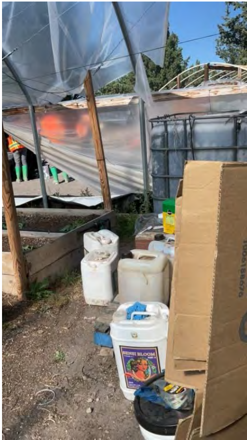
Figure 6. Fertilizers and mixing tank in greenhouse at Polygon Location 2.