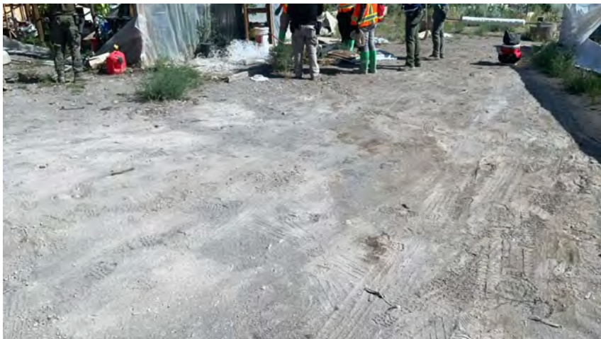
Figure 10. Disturbed area around greenhouse.