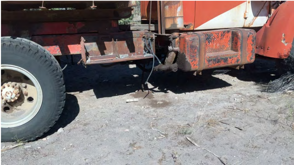
Figure 20. Old truck with broken hydraulic line and stains resulting from discharge to land at Location 16.