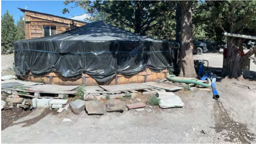
Figure 8. Water storage pool at Point Location 3.