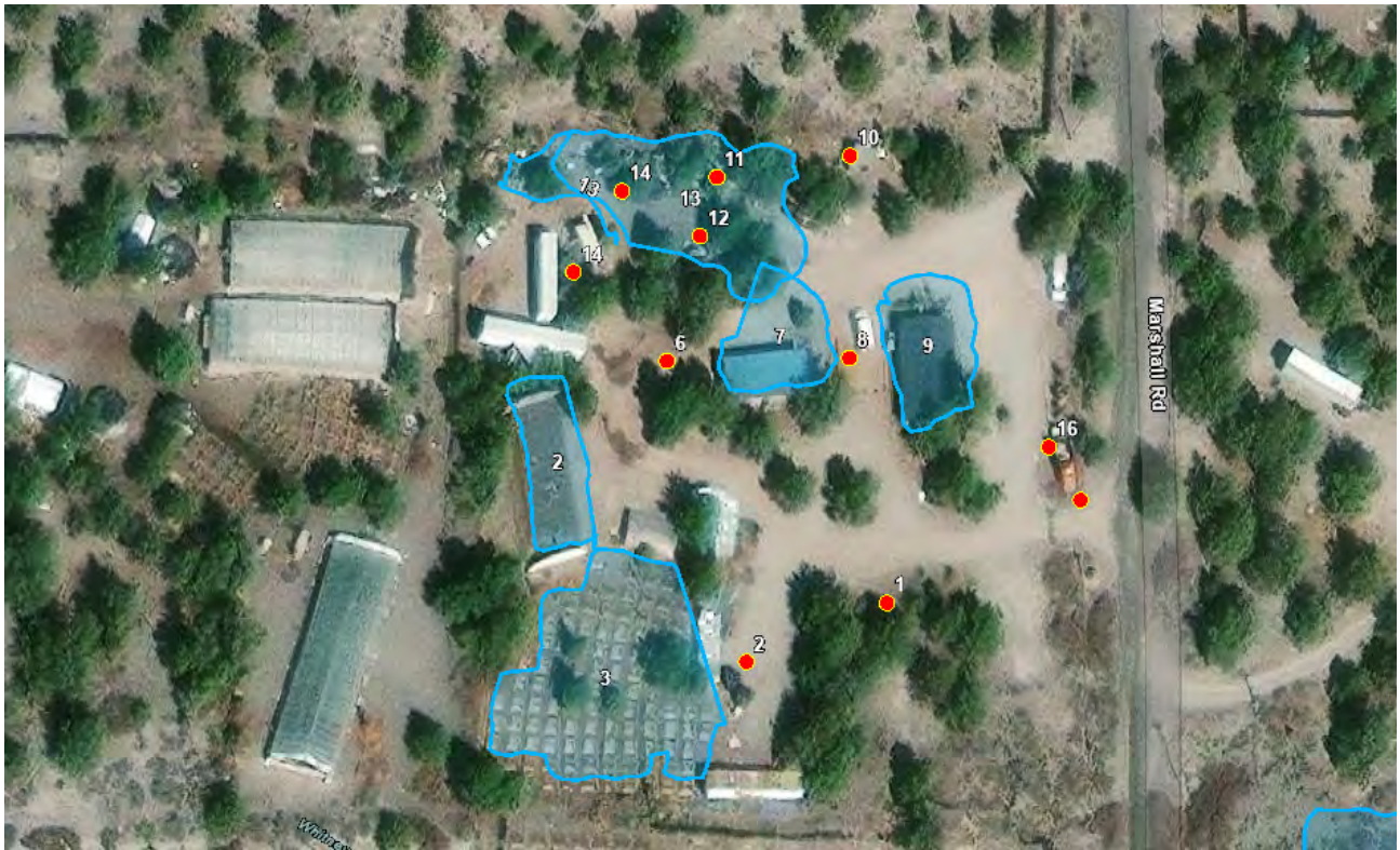
Figure 2. Inspection Map of the Property with Locations referenced in the text.

Whitney Creek is mapped at the south west corner of the Property.