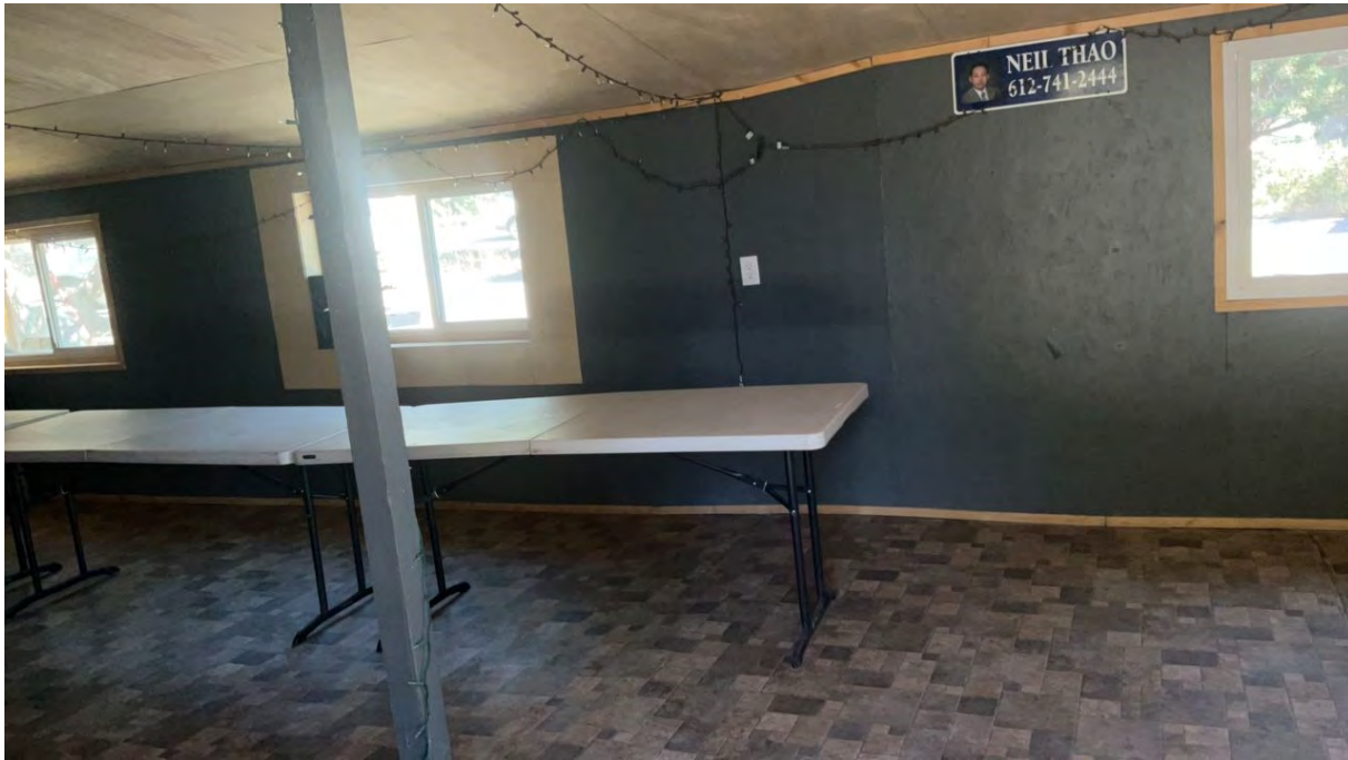
Figure 13. Building at Polygon Location 7.