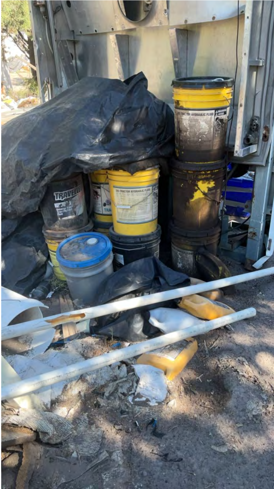
Figure 17. Waste hydraulic fluid stockpile with discharge to land at Point Location 12.