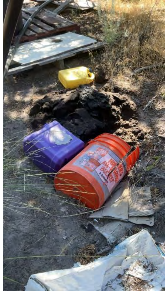
Figure 16. Petroleum waste mixed with sand and discharged to land at Point Location 11.