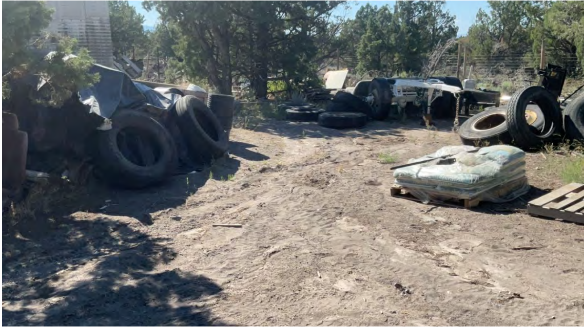
Figure 18. A pallet of fertilizer is located along the flow path of concentrated surface runoff at Point Location 14.