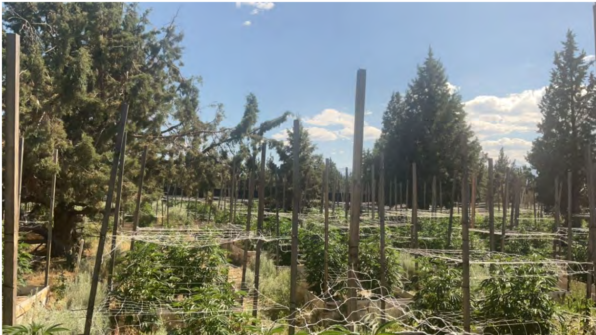
Figure 7. Outdoor cultivation at Polygon Location 3.