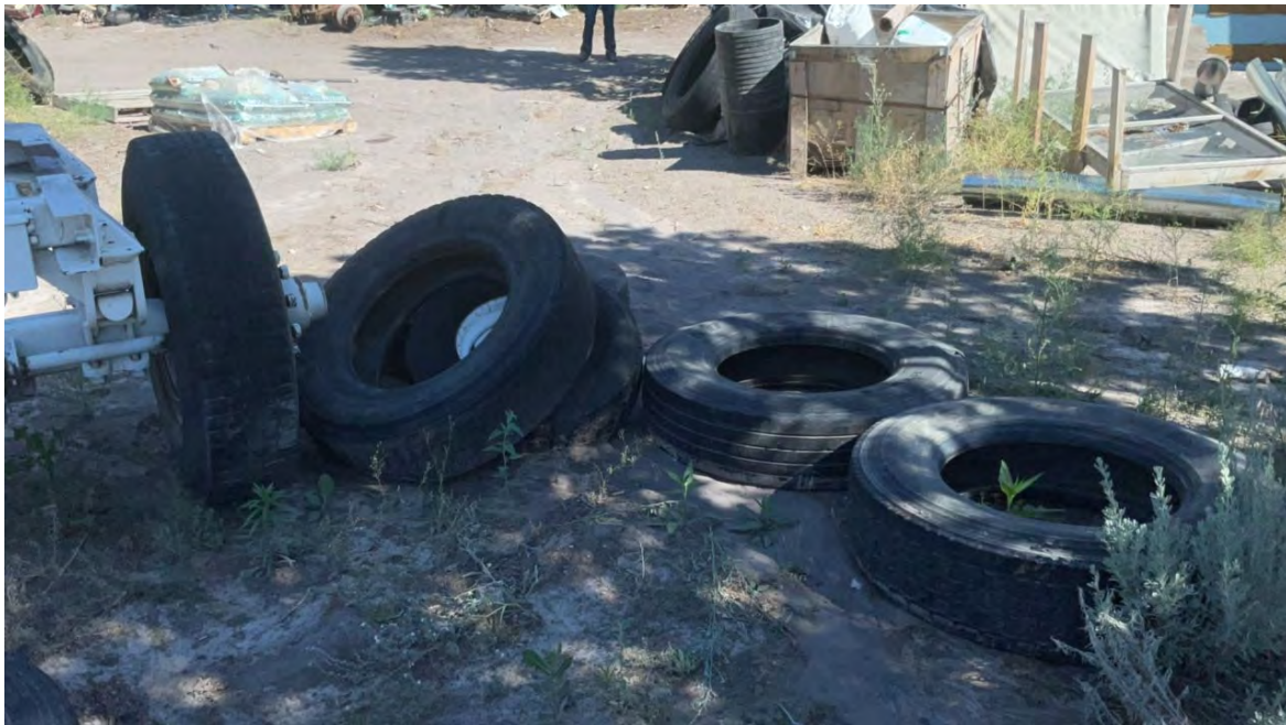
Figure 19. The stormwater runoff flow path runs through tires.