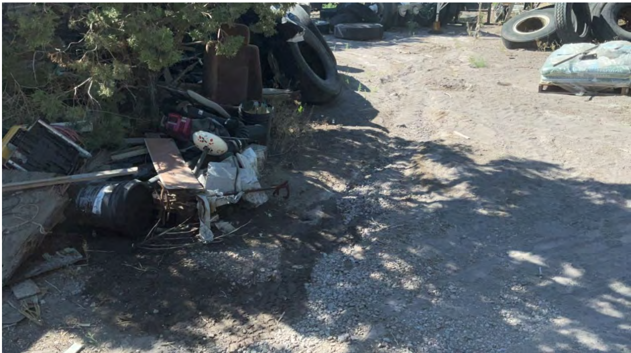
Figure 14. Stockpile area with old equipment, waste oil, containers, small engines, and tires with discharge to land at Polygon Location 13.