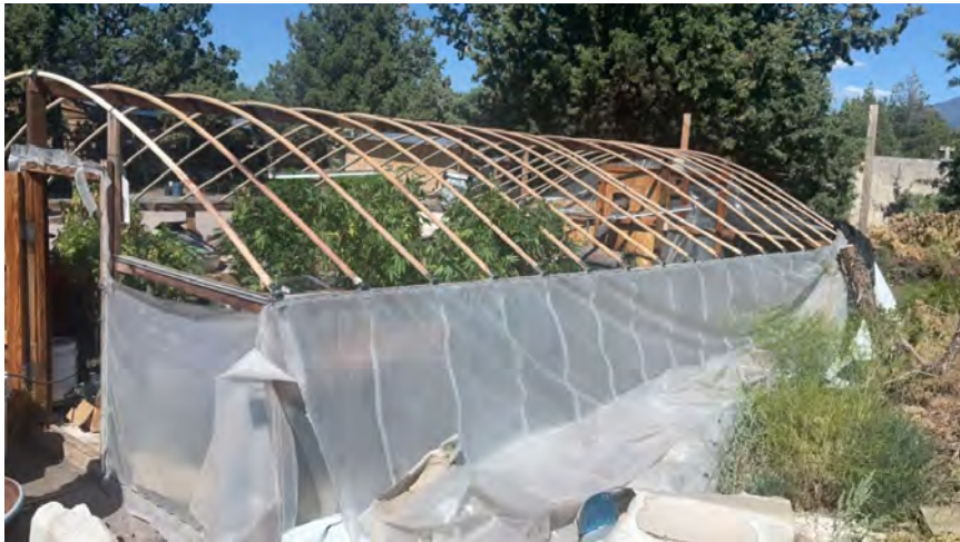
Figure 9. Greenhouse cultivation at Polygon Location 4.