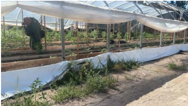
Figure 5. Greenhouse cultivation at Polygon Location 2.