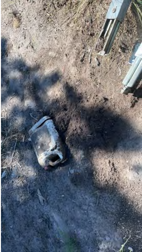
Figure 15. Oil container with contents discharged to land at Point Location 10.