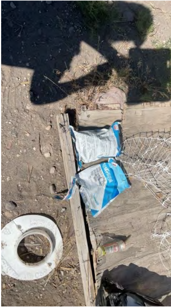
Figure 11. Imported pesticides not authorized for use in the United States found in cultivation area at Polygon Location 4.