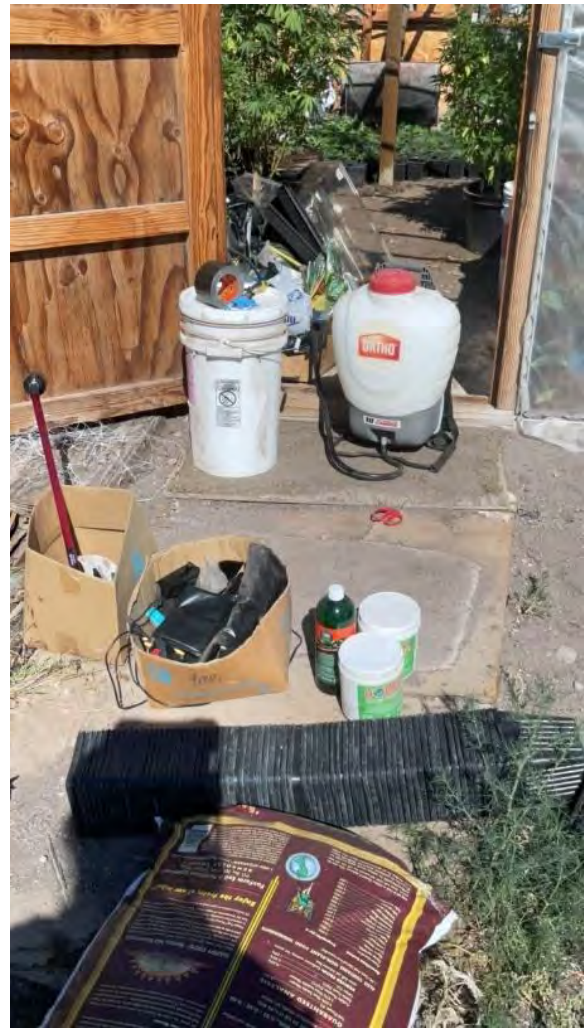
Figure 12. Sprayer and chemicals at greenhouse at Polygon Location 4.