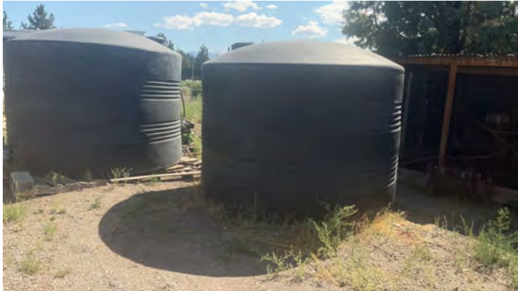
Figure 4. Water storage tanks at Point Location 2.