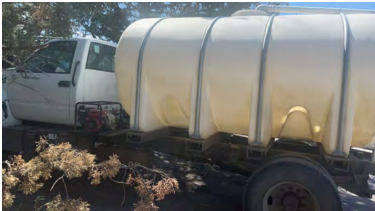
Figure 3. Water truck at Point Location 1, appears to be in service.