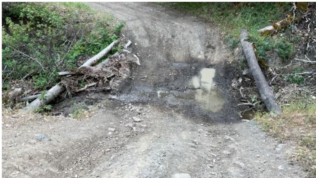
Figure 5. X7. Ford over a blue line Class II watercourse with debris in channel and rutted mud tracks. Presence and use of the crossing result in sediment discharge. View facing SE, from left bank, downstream to left of photo.

Inspection Photos. All Photos taken by Adona White on June 7, 2023.