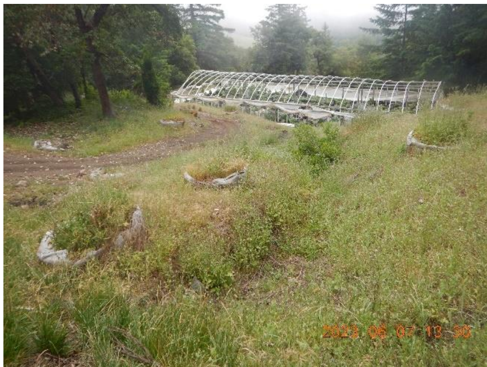
Figure 13. View looking down watercourse channel where greenhouse is constructed in channel. On the left of the photo is the blue line stream associated with X7. The road shown is the access road to the cultivation area CA.