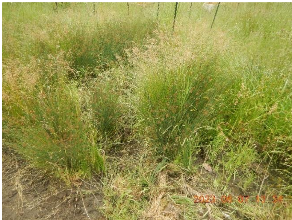
Figure 11. Example of standing water and wetland vegetation along watercourse near cultivation area CA.