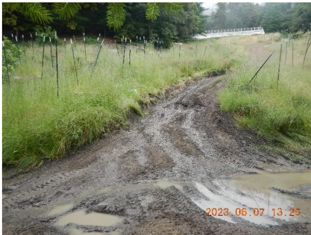
Figure 8. The road up to the cultivation area CA is wet with flowing water.