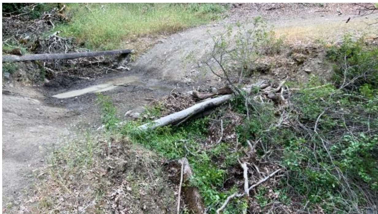
Figure 6. X7. Facing west, from right bank, downstream is to the right of photo.