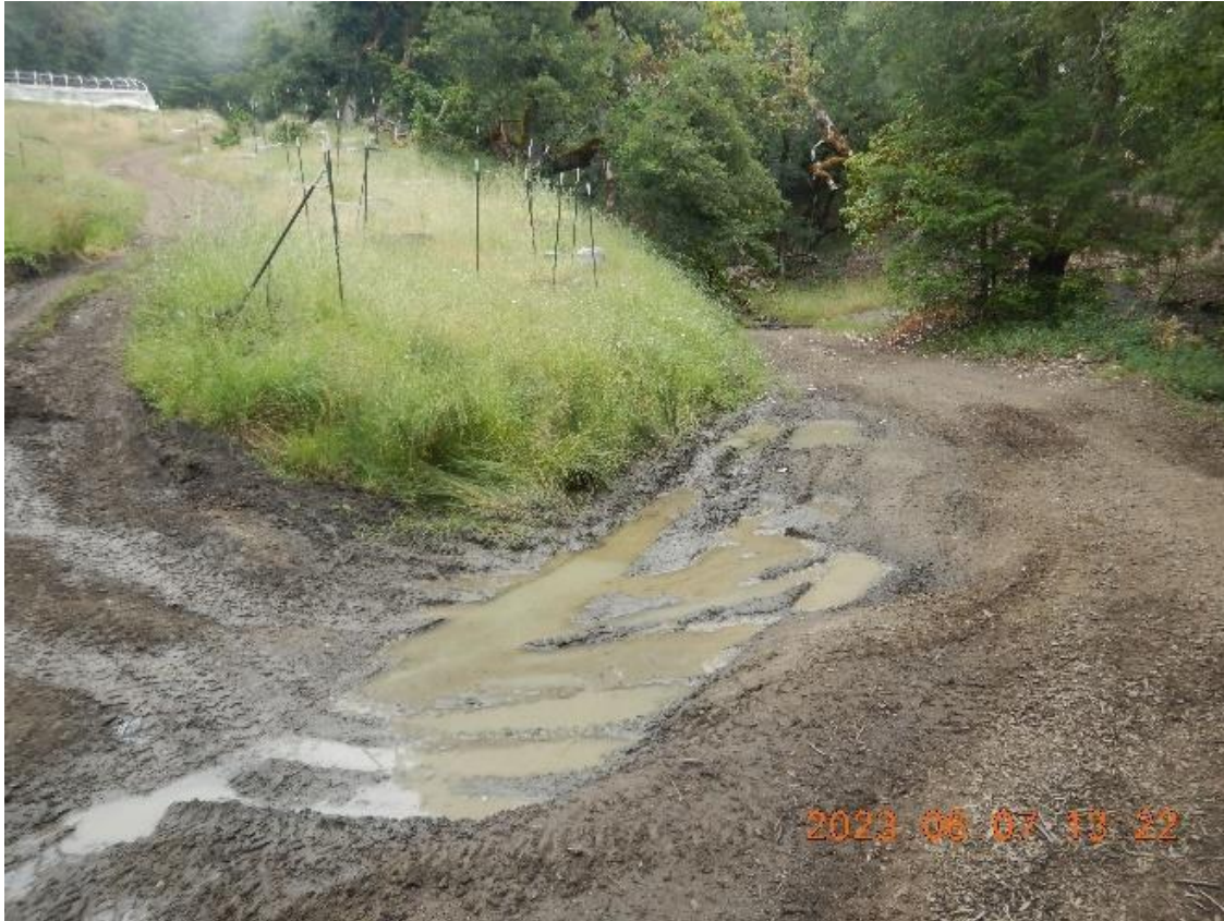
Figure 7. X7 is shown in distance along road, to middle right of photo. On the left of photo, a road goes up hill, delivering concentrated water and sediment to the roadway.