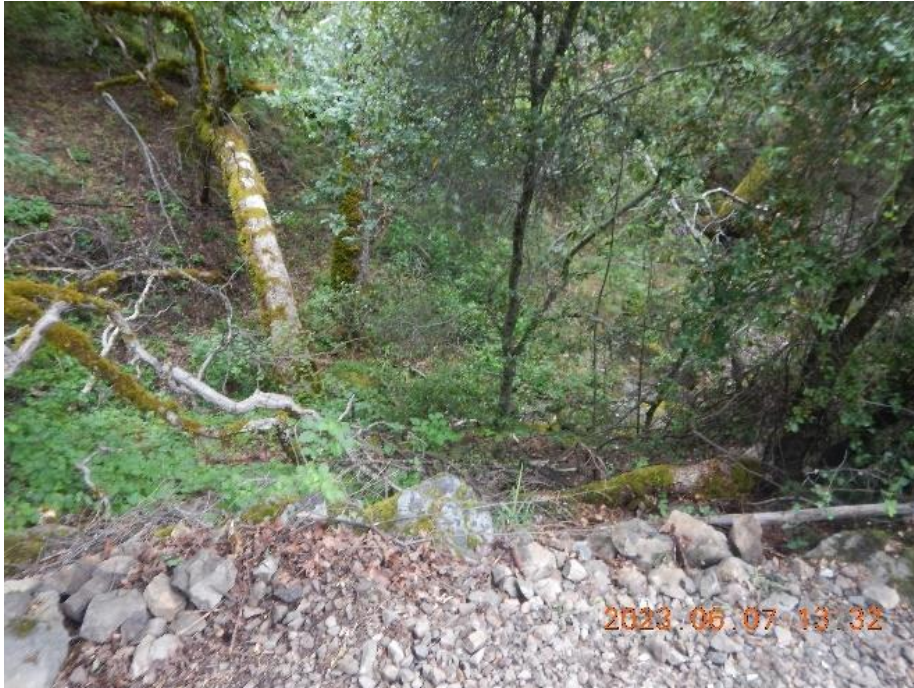
Figure 15. Road edge above the blue line stream near CA.