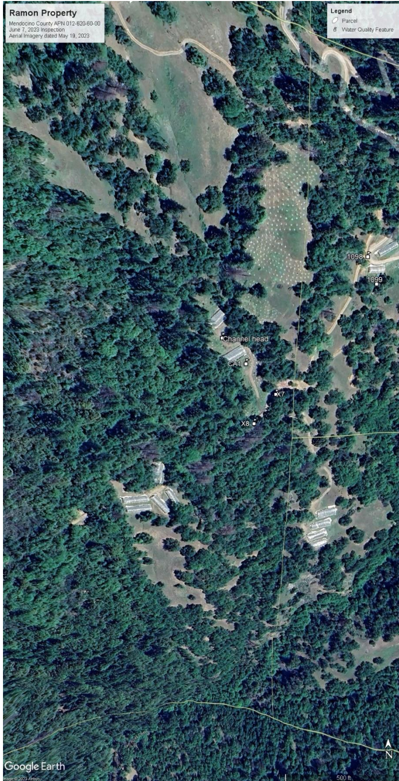
Figure 2. Aerial imagery of property with inspection locations identified.