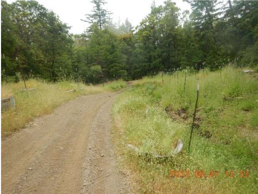
Figure 12. Watercourse channel paralleling rutted road.