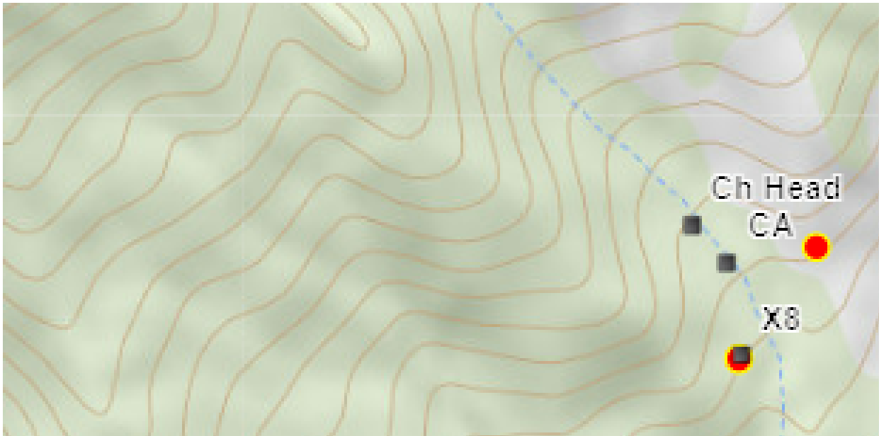
Figure 4. USGS topographic map showing inspection points locations relative to the blue line watercourse they identify. The label for X7 is not shown, but is shown to the east of the blue line watercourse and the other points are adjacent to the blue line stream.