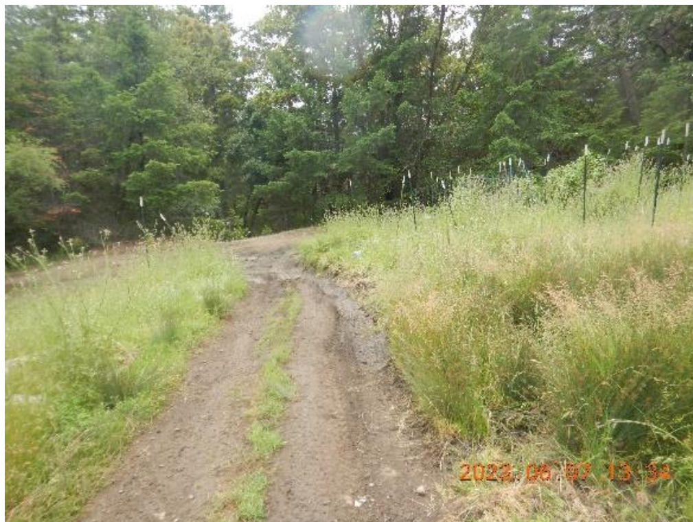
Figure 10. The road up to the cultivation area CA is paralleled by a watercourse channel that also has saturated soils and wetland vegetation.