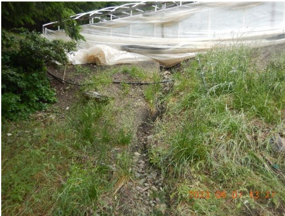
Figure 16. Greenhouse built on top of watercourse channel.