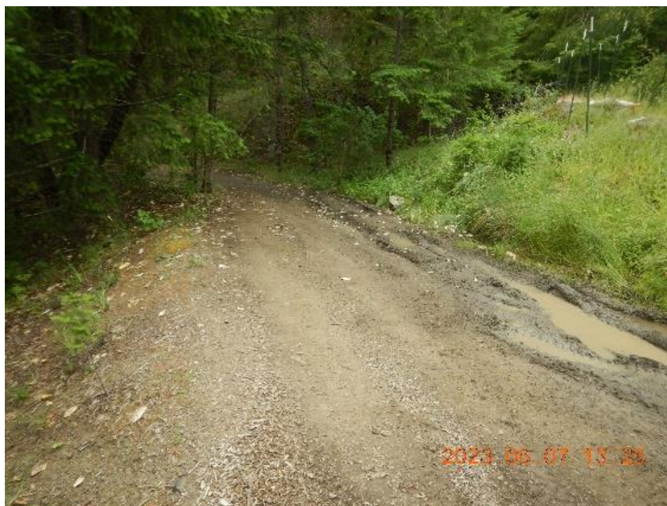
Figure 9. Water and sediment flowing down the road from the cultivation area CA delivers to the next watercourse at X8.