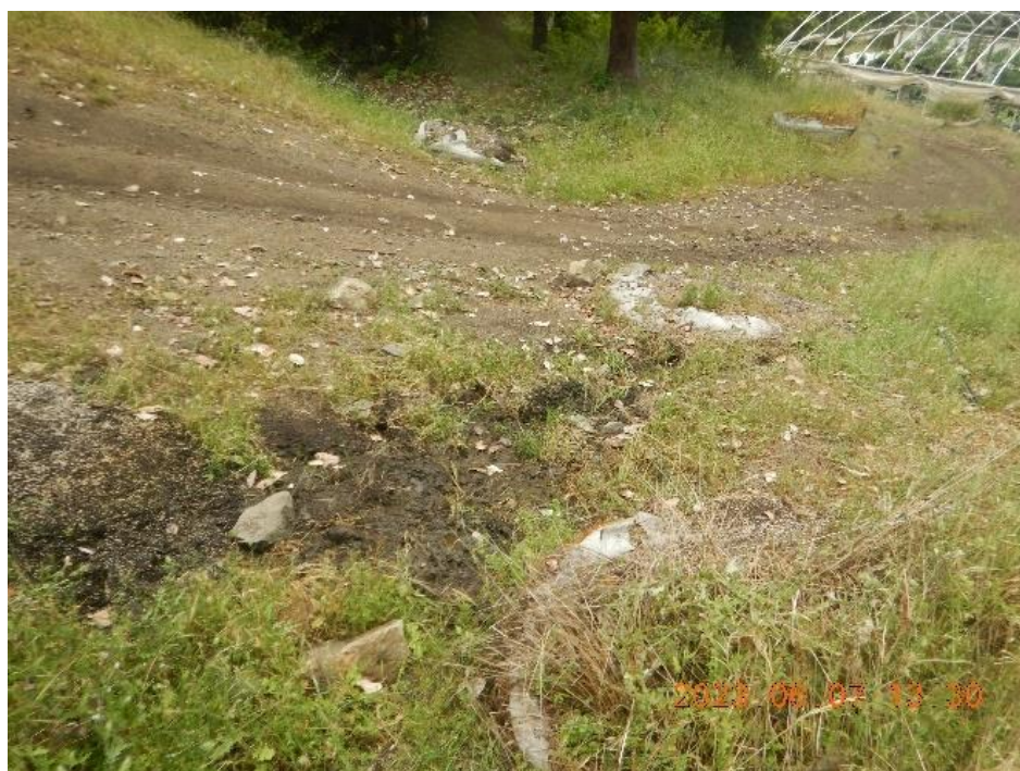
Figure 14. At one location, the disturbed area is located at the top of the stream bank of the blue line stream.