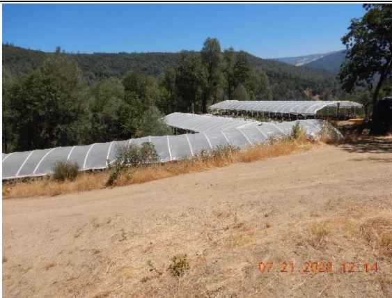
Photo 3 - Cultivation area south of WQ9 on a steep slope