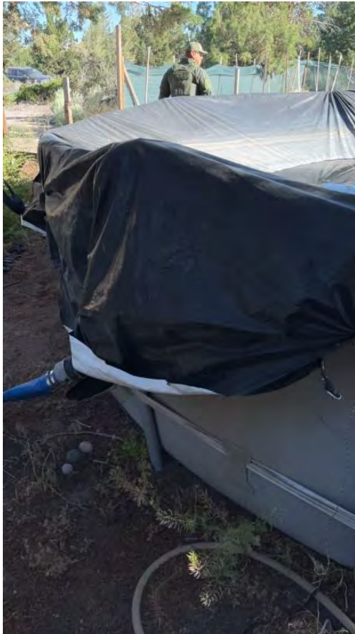
Figure 8. Water storage tank at point location 4.