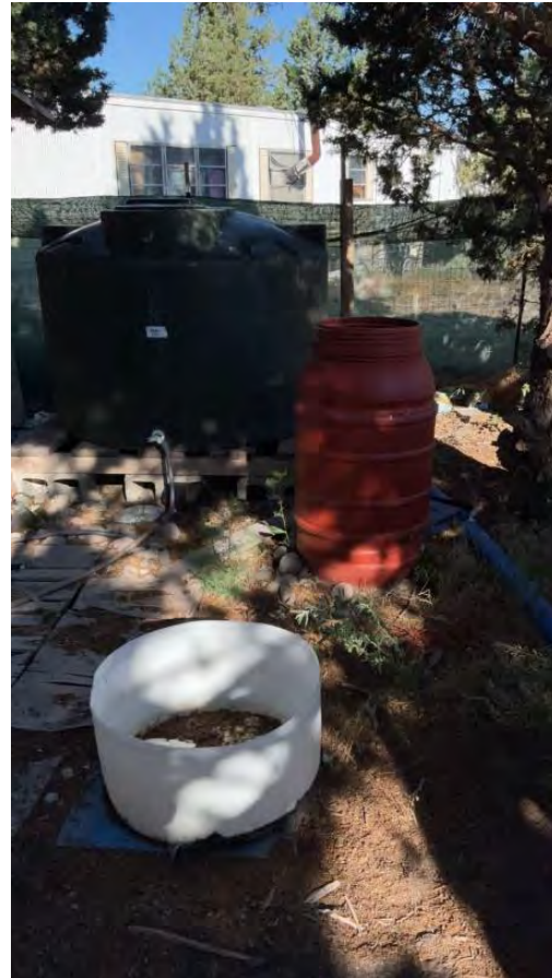
Figure 9. Feed tank at location point 4.