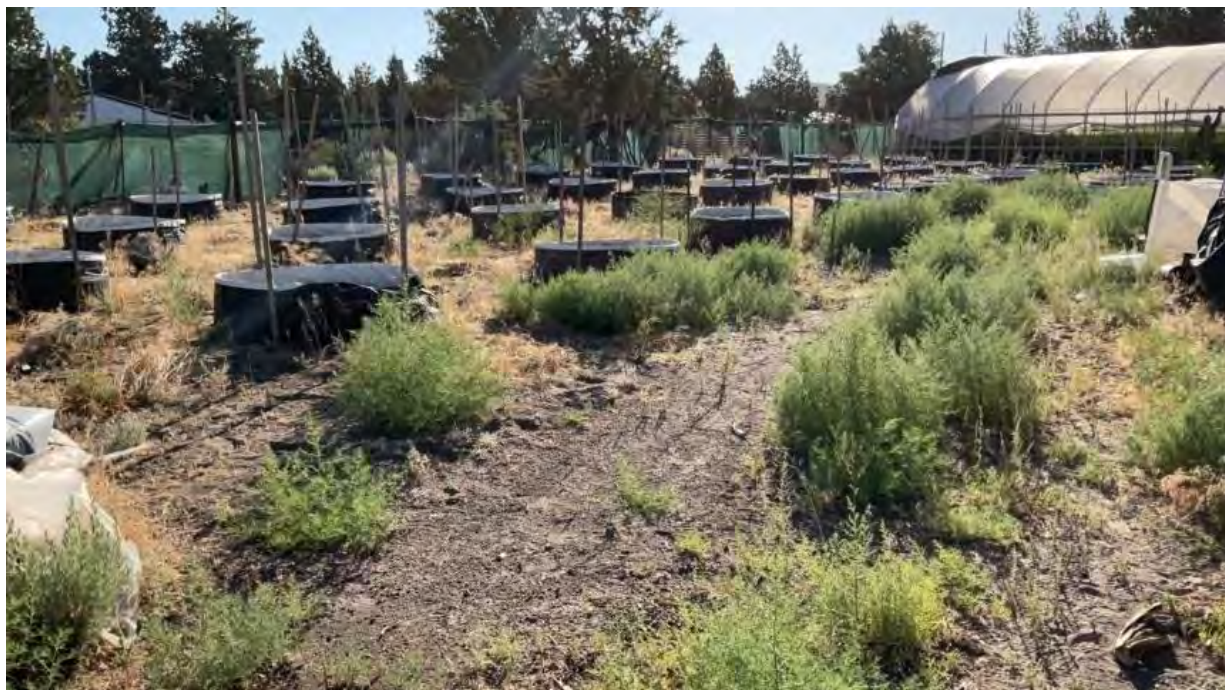
Figure 4. Cultivation area at location 2.