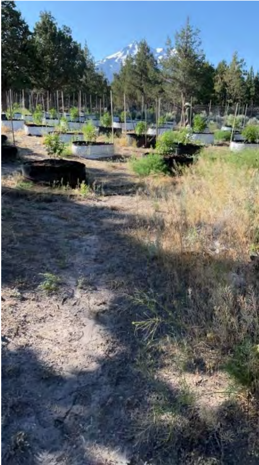
Figure 7. Stream flow path scoured through outdoor cultivation area at location polygon 4.