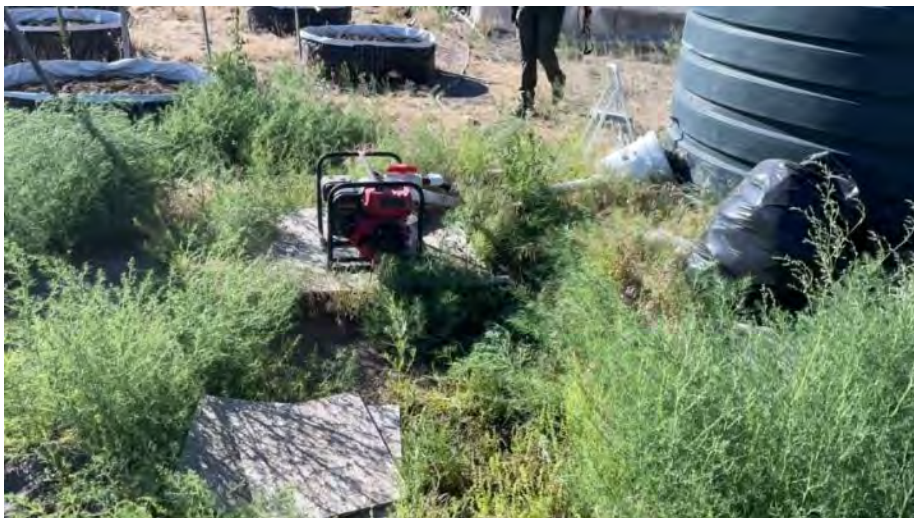
Figure 10. Water tank and pump at location 5.