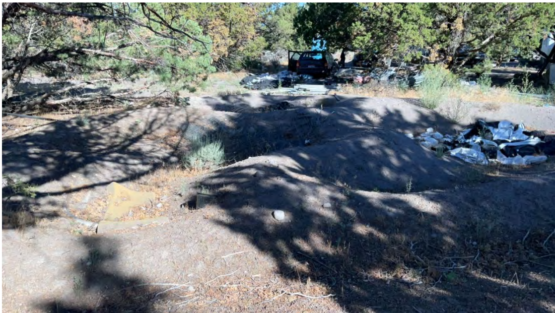
Figure 13. The stream has been impacted at polygon location 7 with pits dug and trash buried over a six hundred square foot area.