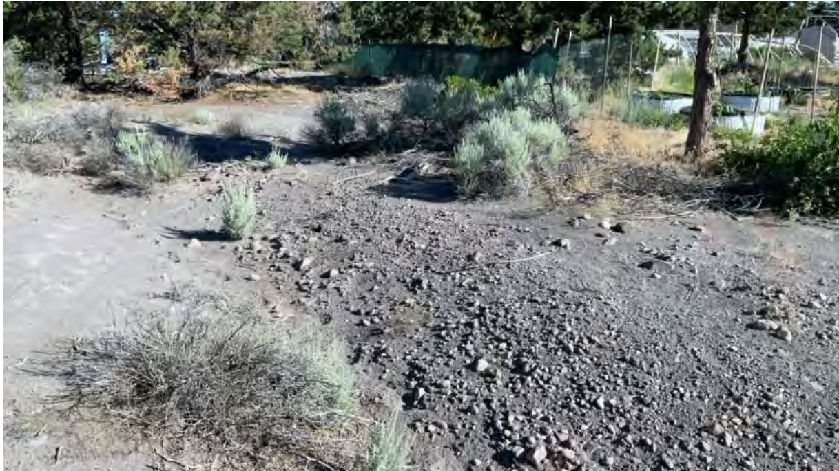
Figure 12. A stream channel associated with Whitney Creek runs through the property east to west and is represented on the inspection map as a line feature location 6. The Cultivation area at polygon location 4 is located within approximately 13 feet of the stream channel. A length of three hundred thirty feet of stream channel are encroached upon by the cultivation areas and activities.