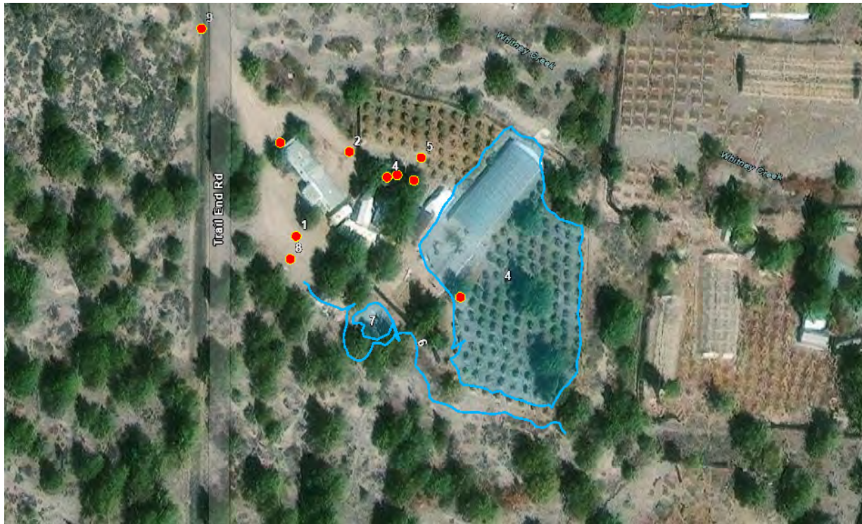
Figure 3. Inspection Map of the Property with Locations referenced in text.