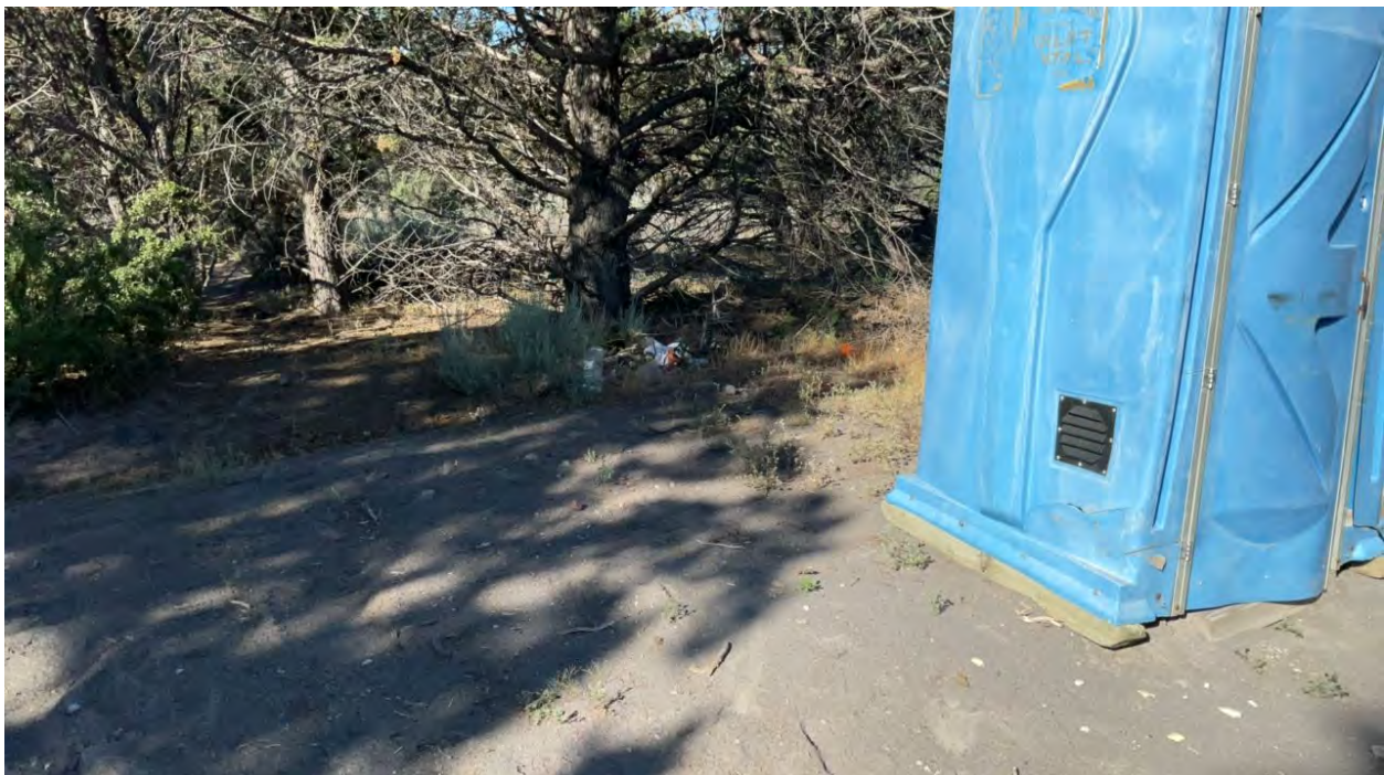
Figure 15. A porto potty is located near the channel at location 8.