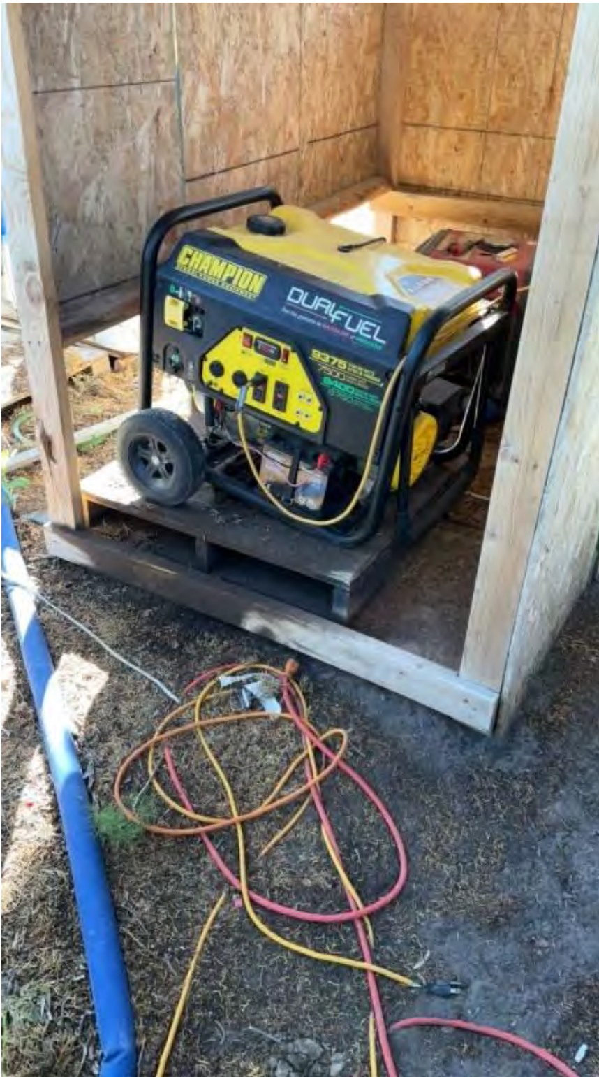
Figure 11. A generator with dark stains from petroleum products discharged to the ground at location 5.