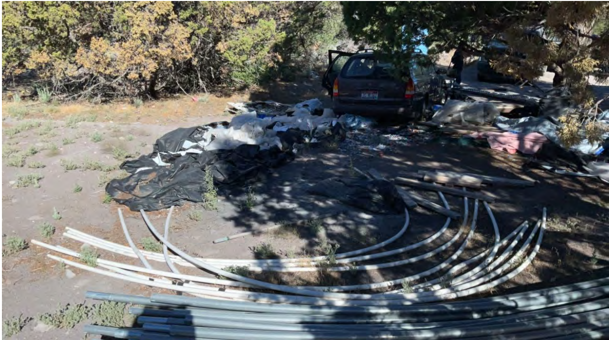
Figure 14. Refuse and cultivation related plastic materials accumulation near stream.