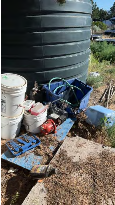
Figure 5. Uncontained fertilizers, chemicals next to water storage tank at location 2.