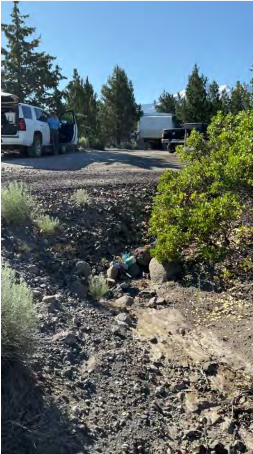
Figure 16. Watercourse crossing of Whitney Creek at location 9 along Trail End Road, used to access the Property, approximately thirty feet north of the mapped parcel boundary. There is no culvert installed in the crossing.