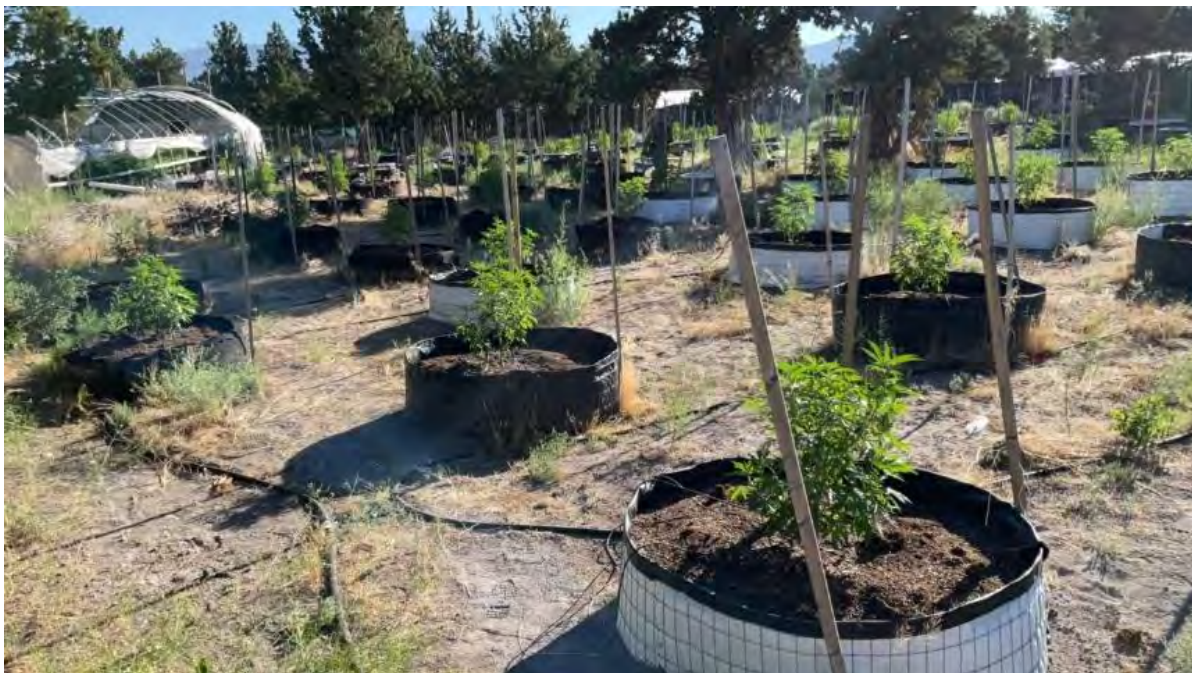
Figure 6. Cultivation area with outdoor and greenhouse cultivation at location 4.