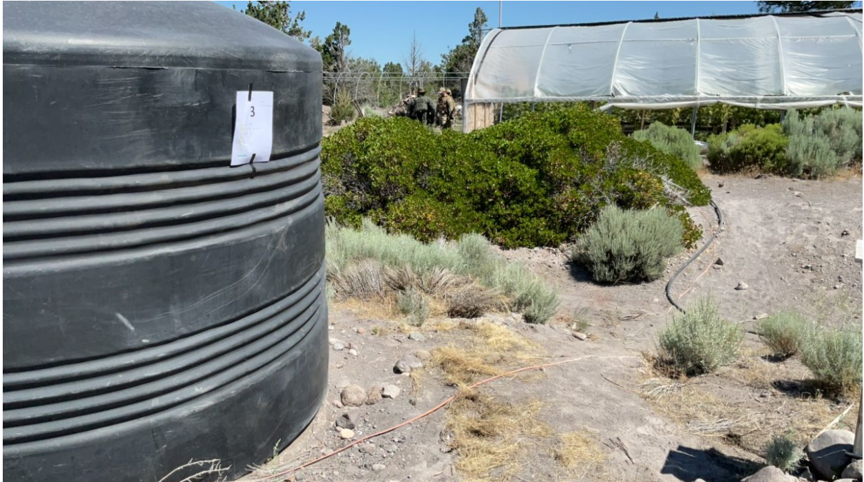
Figure 9. A water storage tank at Location 5 is placed within 25 feet of the watercourse.