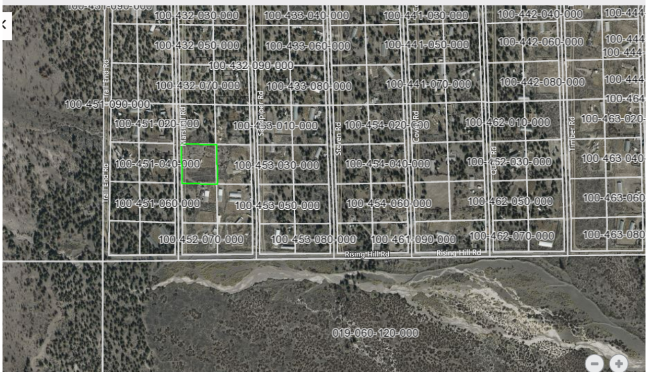
Figure 2. The Property is located adjacent to Whitney Creek, which is fed by runoff from Whitney Glacier located on the north side of Mount Shasta. In the area of the Property, I observed that Whitney Creek has sand substrate and a broad channel migration area which numerous braided channels. A channel runs through the Property and is identified on the NHD layer with a dashed blue line symbol as Whitney Creek. A larger stream channel is currently located south of the subdivision extent. Shifts in the historic flow paths of the braided channels appear to have resulted from channel migration and the construction of the subdivision and earthen berms along the southern boundary.