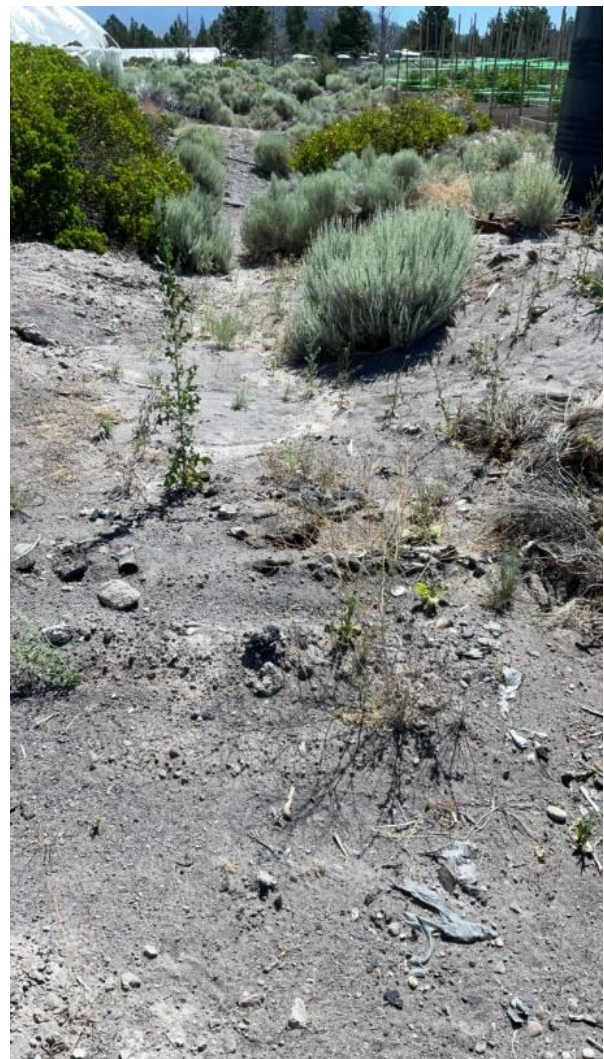
Figure 8. Burned trash in watercourse at Location 6 as evidenced by melted metal.