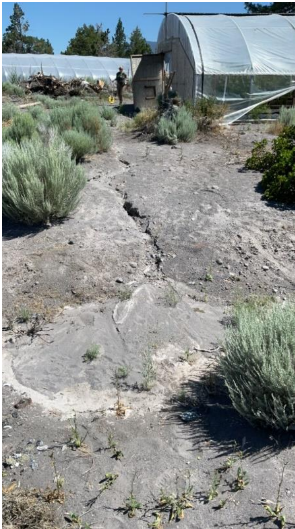
Figure 7. Scoured flow path from greenhouse at Polygon Location 3 capable of transporting waste from the greenhouse and threatening waters of the state.