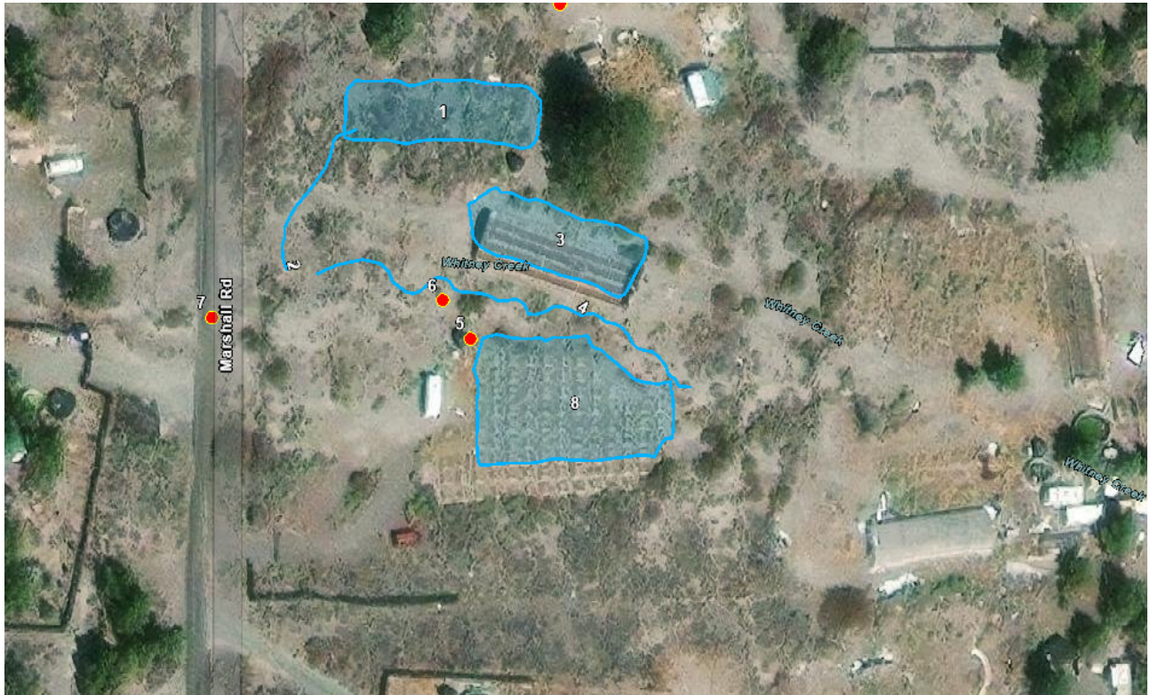
Figure 3. Inspection Map of the Property with Locations referenced in the text.