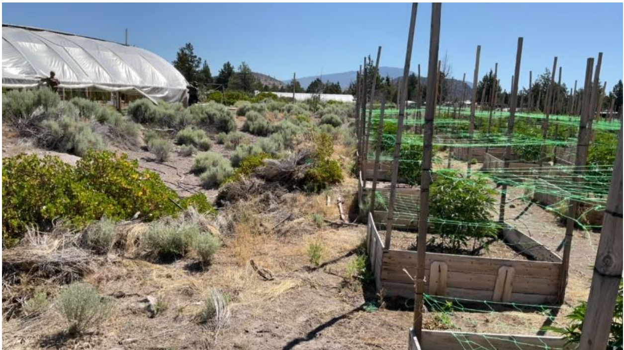
Figure 10. Polygon Location 8 is a cultivation area with both outdoor and greenhouses under active cultivation.