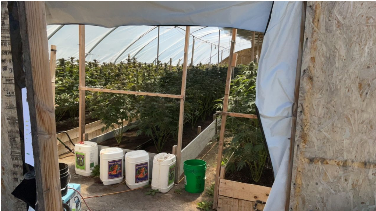
Figure 6. Polygon Location 3 is active greenhouse cultivation.