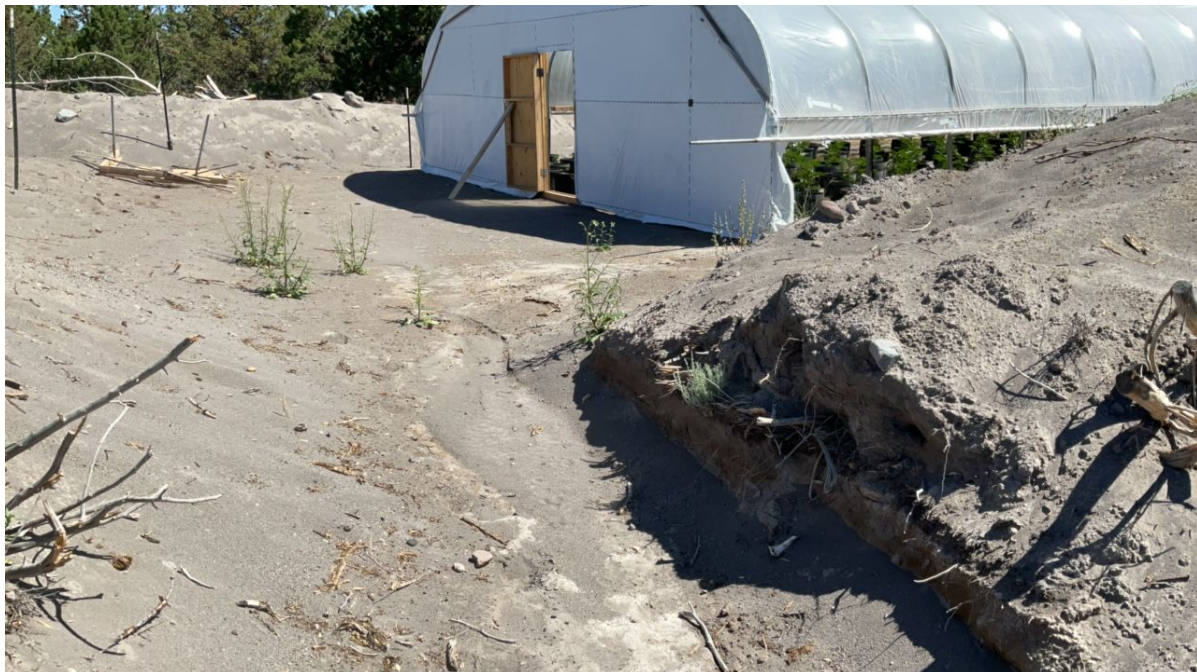
Figure 4. Active greenhouse cultivation area at Polygon Location 1.