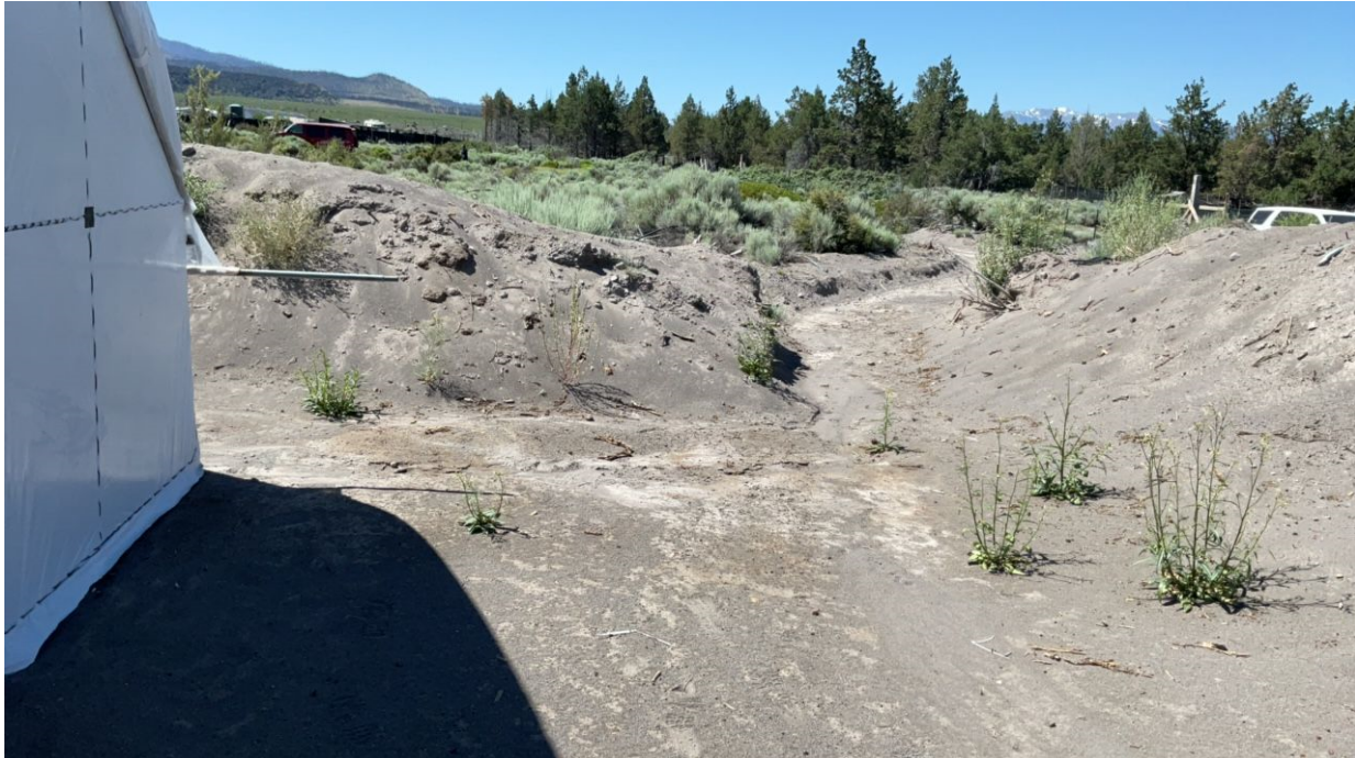
Figure 5, Scoured flow path from greenhouse to watercourse at Line Location 2.