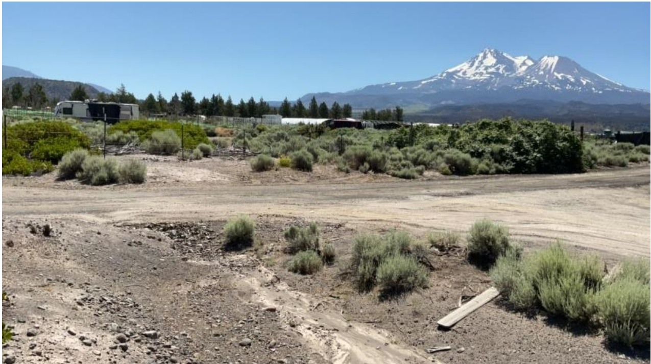
Figure 11. Watercourse crossing at Location 7 along main access road lacks a conveyance structure.