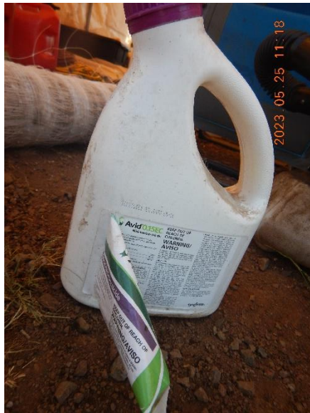
Figure 10. Bottle of Avid pesticide.