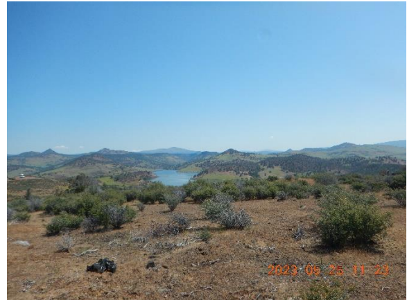
Figure 2. The Property is situated on a ridge above Iron Gate Reservoir on the Klamath River.