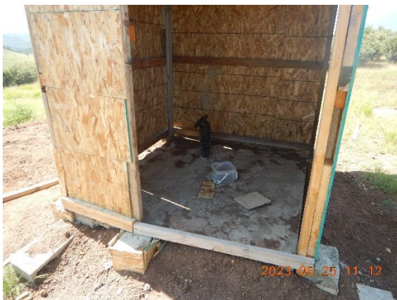
Figure 7. Toilet shed under construction.