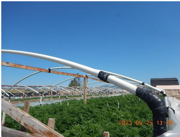
Figure 6. Greenhouse cultivation area.