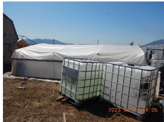
Figure 4. Feed tanks.