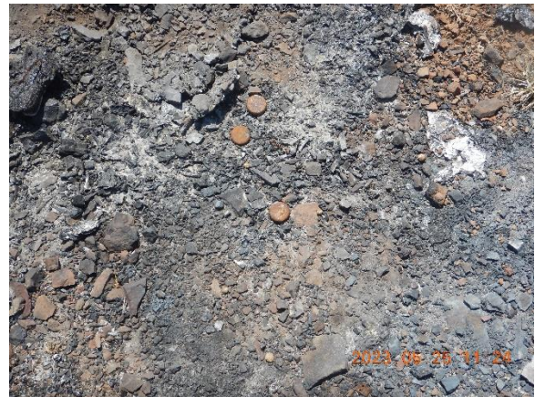
Figure 12. Metal remains from burning of refuse.