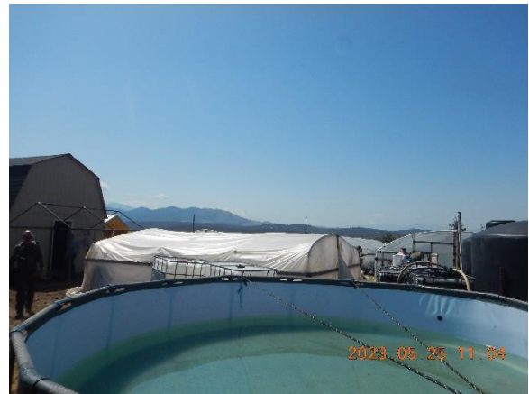
Figure 3. Greenhouses, swimming pool water storage, and feed tanks associated with the cultivation activities.