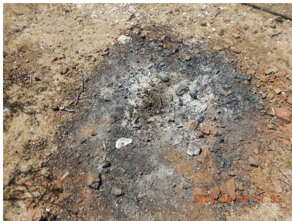
Figure 11. Burn marks indicated burning of refuse.