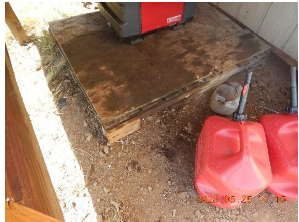
Figure 9. Generator was located on a wooden pallet under a roof. Drip stains were evident on the ground.