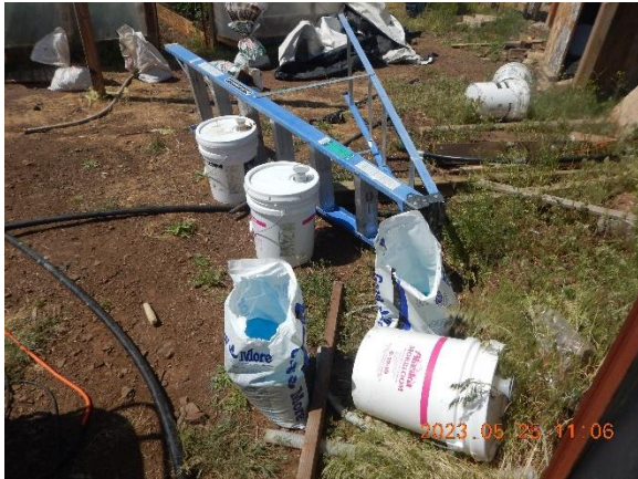
Figure 5. High concentration water soluble fertilizers and other amendments.