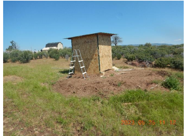
Figure 8. Toilet shed under construction.