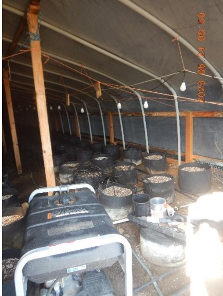
Figure 12. The greenhouse was setup for cultivation but there were no plants present at the time of the inspection.