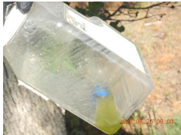
Figure 20. Residual yellow liquid in anticoagulant rat poison bottle.