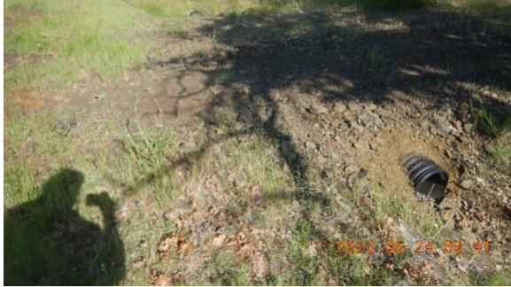
Figure 8. Culvert outlet.