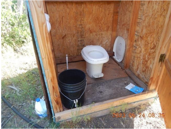
Figure 4. Pit privy located at WP1044.