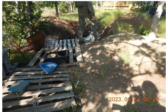
Figure 15. Pit shown in distance.