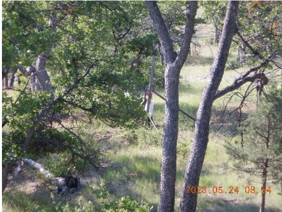
Figure 17. Well was documented by staff of California Department of Fish and Wildlife and is located 16 feet from the west side of the watercourse and is shown in center of photo.