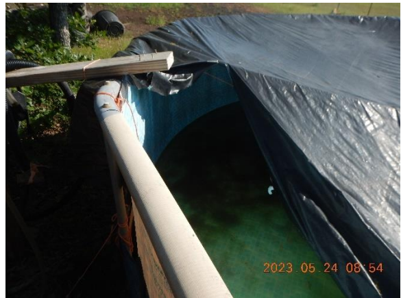
Figure 16. At WP1056 I observed a 16 foot diameter pool for water storage. I also observed a water tank at WP1057.