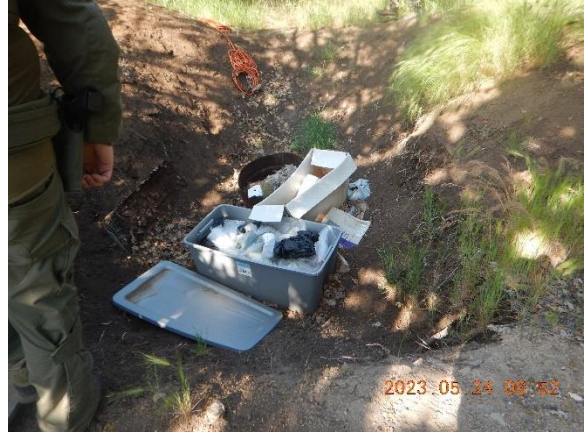
Figure 14 Plastic and other refuse and cultivation waste placed in an excavated pit. Soil is piled on either sides of the pit.