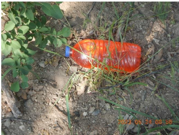
Figure 18. Bottle with unknown orange substance.