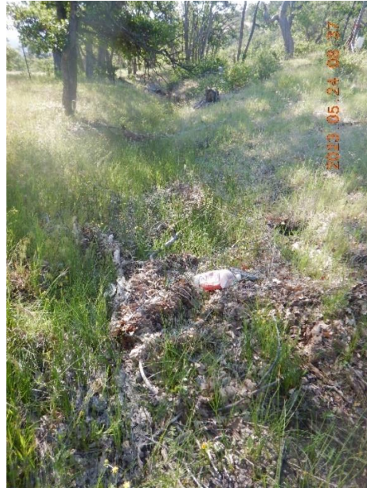
Figure 6. Class III watercourse channel at WP 1045. I observed plastic bottles and wire refuse in the watercourse.