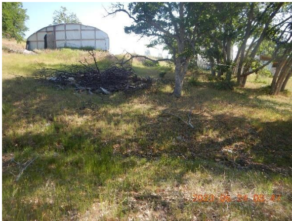
Figure 9. Greenhouse is located on a cut and fill graded flat. The toe of the fill of the greenhouse pad is located approximately 45 feet from the watercourse channel. Shower shed is located at WP1048 and is located behind the trees in photo.