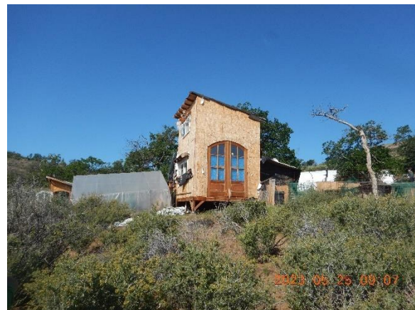
Figure 3. View of buildings on Property.