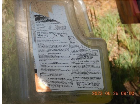
Figure 19. Bottle of anticoagulant rat poison.