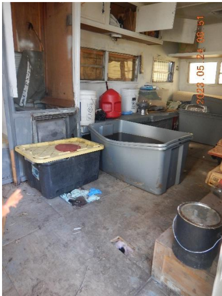
Figure 13. Waste oil in plastic bin.