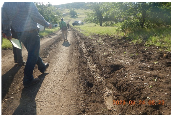
Figure 2. Disturbed areas associated with access driveway to Property.

Inspection Photographs.