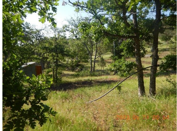
Figure 10. Poly pipe from shower shed (located at WP1048) ends at the watercourse at WP1047, suggesting it is a discharge pipe.