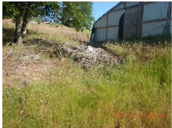
Figure 11. Cultivation waste was on the ground on the downslope side of the greenhouse at WP1051.