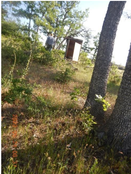
Figure 5. Pit privy at WP1044 is located upslope and approximately 40 slope feet from this Class III watercourse channel at WP 1045.