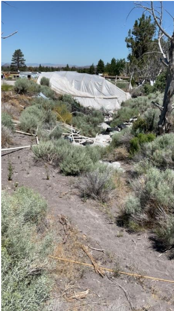
Figure 4. Accumulation of cultivation related plastic trash at Location 2.