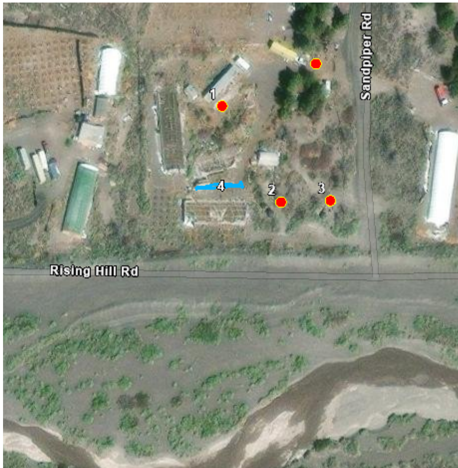
Figure 2. Inspection map.