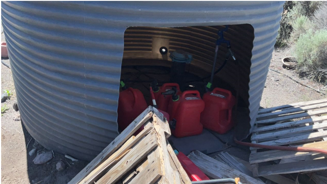
Figure 6. At Location 3, an irrigation well with gas pump was actively filling a water tank. Petroleum containers are stored next to the well.