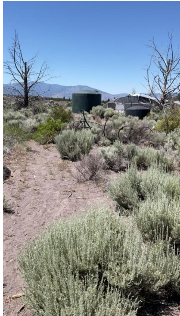
Figure 5. Water tank filled from well. A charged water line from the tank was going to an adjacent property, APN 100-453-070.