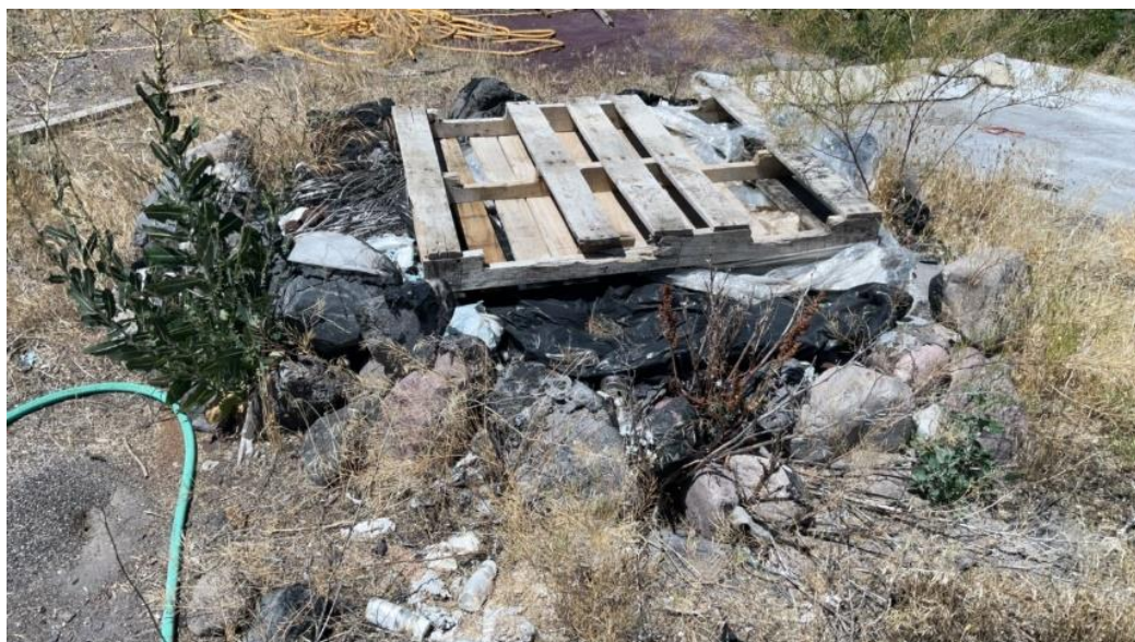
Figure 3. Trash burn ring at Location 1.