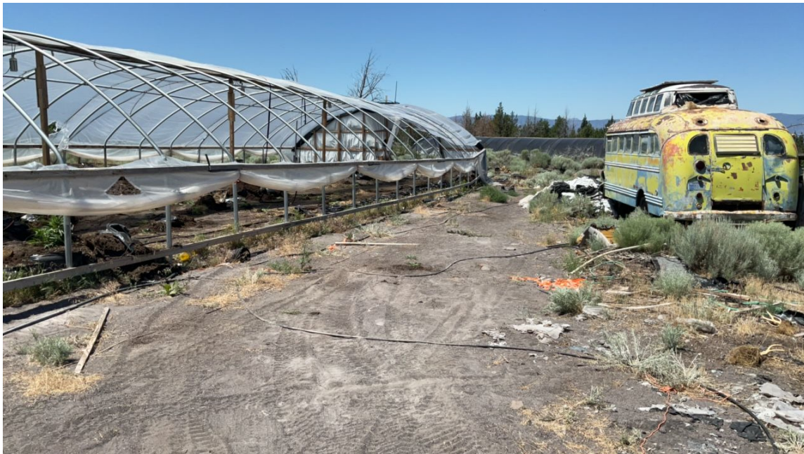
Figure 7. Cultivation in four greenhouses at Location 4.