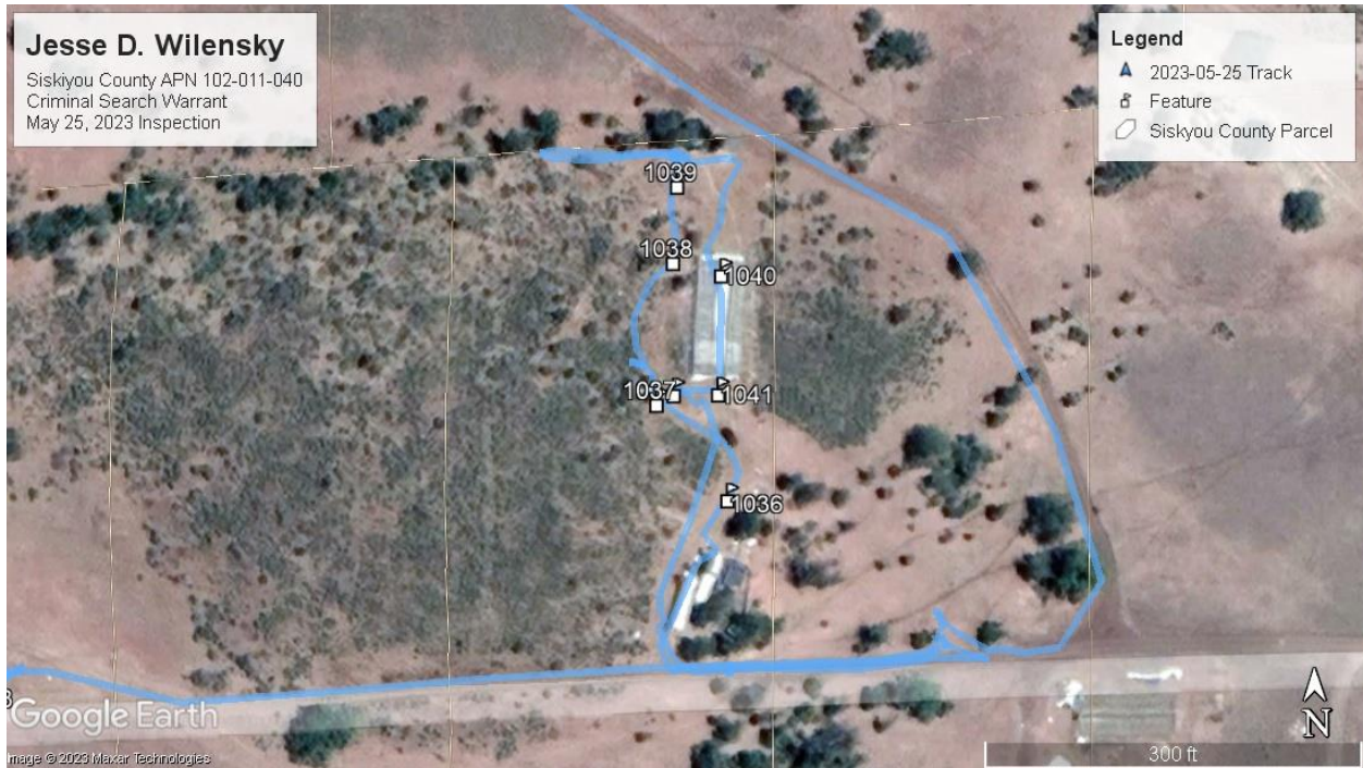
Figure 1. Inspection map of Property

All inspection photographs were taken by Adona White on May 25, 2023.