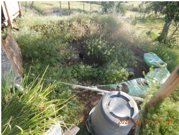
Figure 4. Waste pipe from toilet drains to pit.