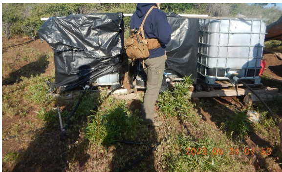
Figure 6. Feed tank.