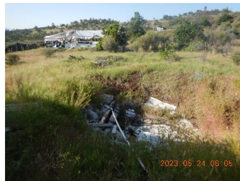
Figure 8. Refuse pit and greenhouse.