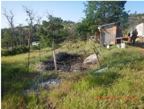
Figure 5. Refuse pit.