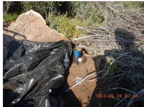
Figure 7. Open cup of waste oil.