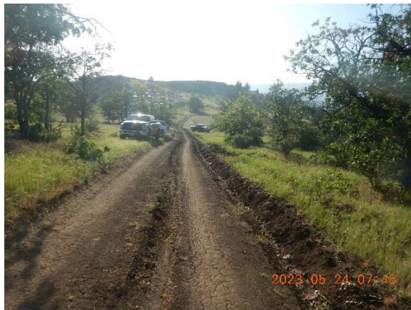
Figure 2. Looking down access road. Road does not include drainage structures to shed water from road surface.