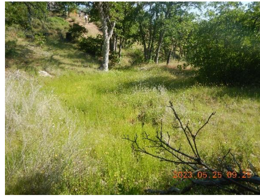
Figure 24. Looking downstream of onstream impoundment wetland area associated with watercourse.