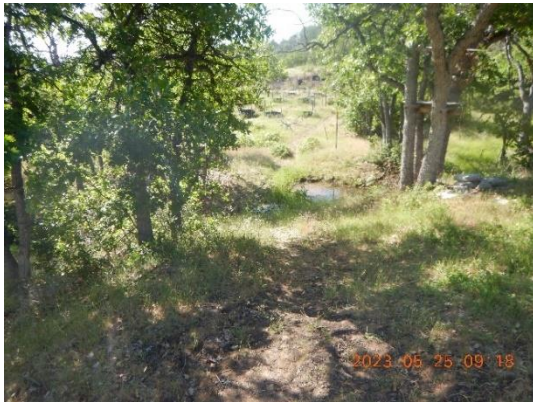
Figure 14. Downslope of the cultivation and domestic areas is a Class II watercourse that has been excavated (watercourse runs right to left in photo). Beyond the watercourse, on the other bank is an outdoor cultivation area CA3.