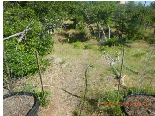
Figure 16. CA3 is 45 feet from the top of left bank of the stream (when looking downstream).