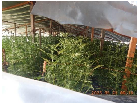
Figure 10. Greenhouse is approximately 2453 square feet and is located approximately between WPs 1062, 1063, 1064 and 1065 (CA2).