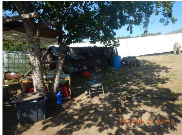
Figure 5. Pool and feed tank located at (WP) 1061.