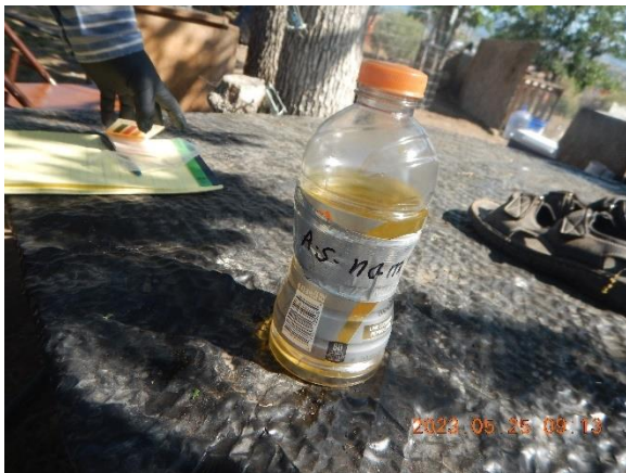
Figure 8. Unknown orange liquid in bottle.