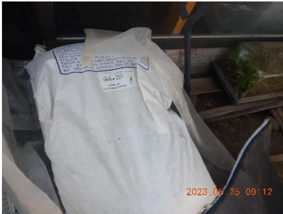
Figure 7. Bag of fertilizer.