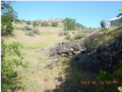
Figure 13. Toilet shed and greenhouse are built on at the edge of a fill slope.