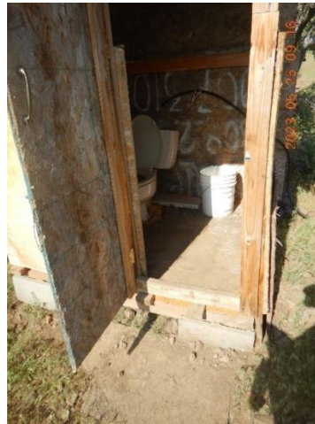
Figure 11. Toilet shed.