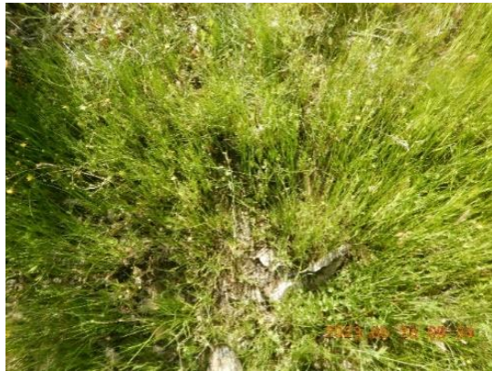
Figure 22. Standing water in area with wetland indicators.