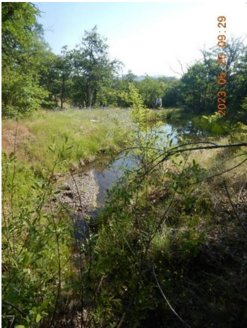
Figure 19. Looking downstream from the top of the impacted reach and the upstream reservoir. The upstream reservoir is estimated to be 45 feet long,

ten feet wide, and 5 feet deep. Gravel sorting by the incoming stream was evident by a gravel bar at the upstream extent of the upstream reservoir.