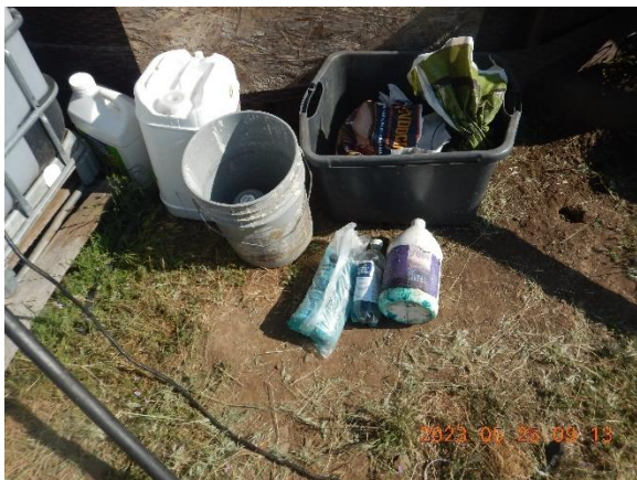
Figure 9. Bottles of cultivation related chemicals and fertilizers and rat poison.