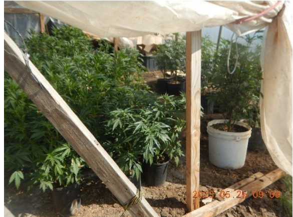
Figure 4. Cannabis cultivation in greenhouse at WP 1058 (CA1).