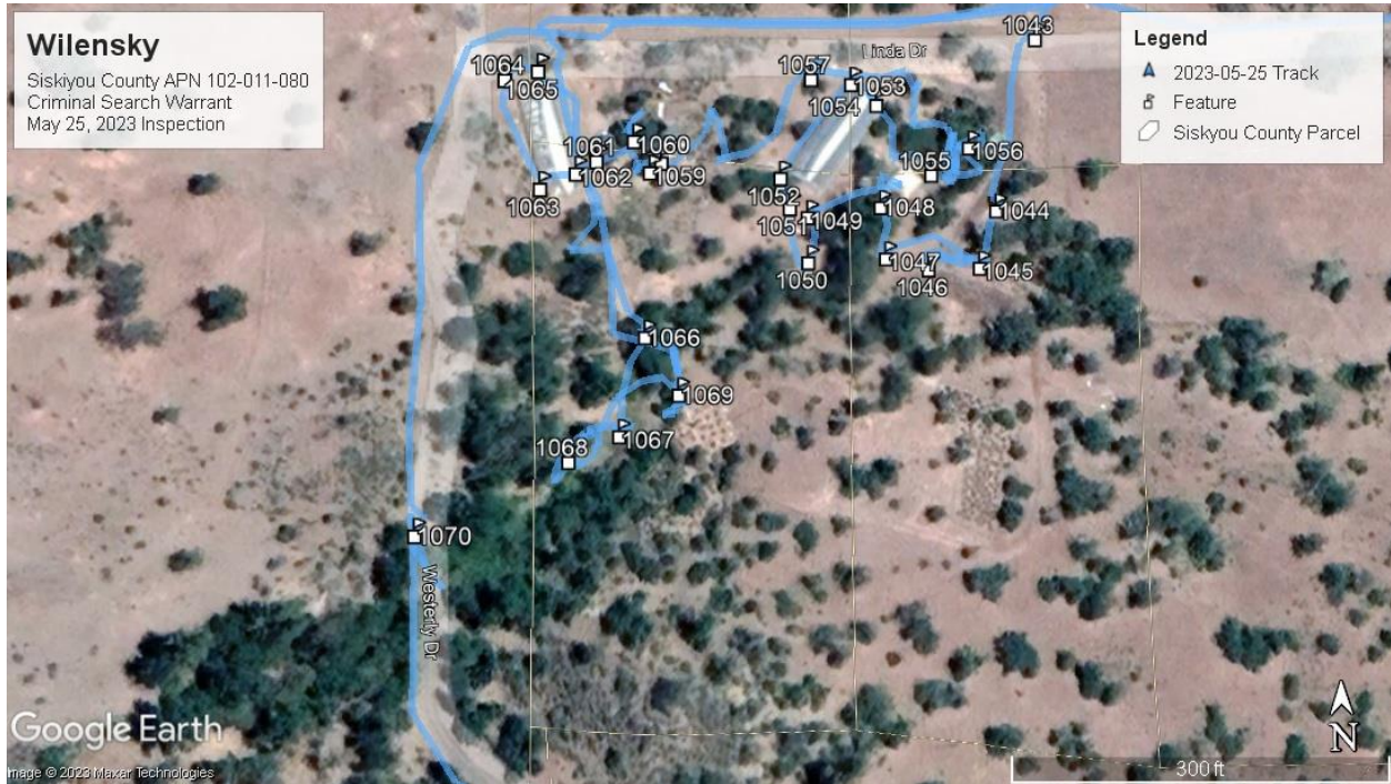
Figure 1. Inspection map of Property.