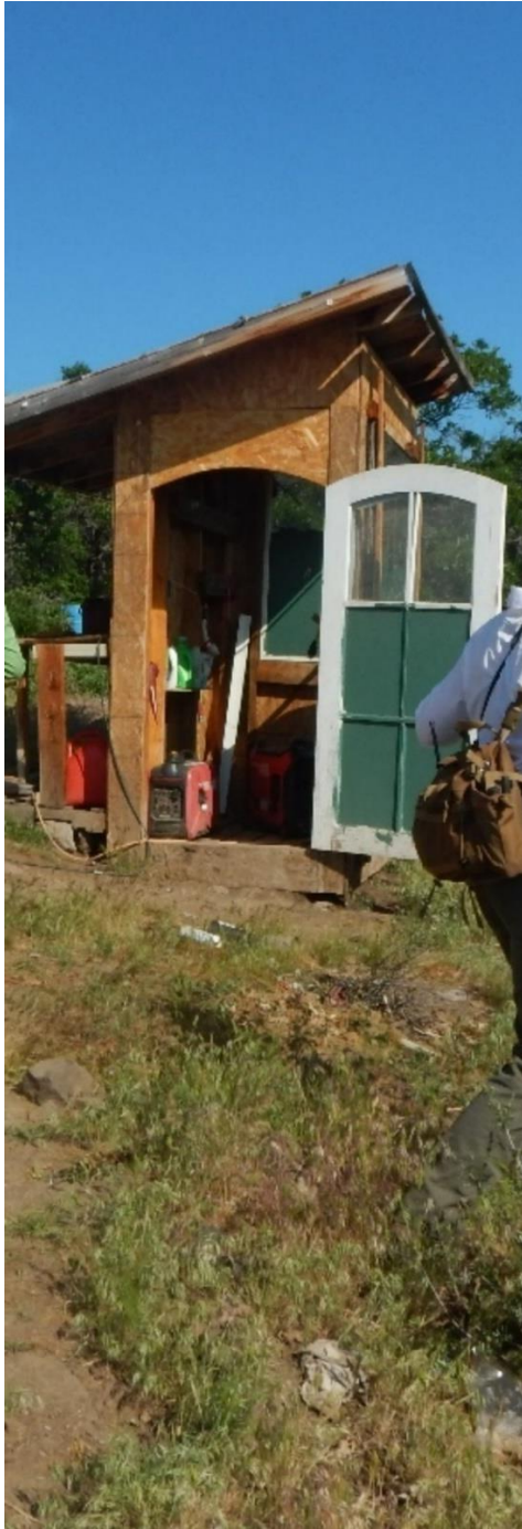
Figure 3. Generator shed at Way Point (WP) 1059.

All inspection photographs were taken by Adona White on May 25, 2023.