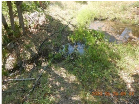
Figure 23. Watercourse flows from right to left in photo, with outlet of downstream reservoir on right and a berm and stream crossing approximately 5' long and 4' high. The downstream reservoir is approximately 12 feet wide, 10 feet long, and 2 feet deep.