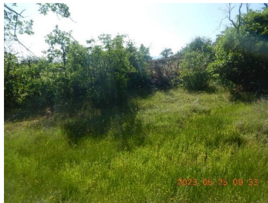
Figure 21. Adjacent to the stream, on the right bank (when facing downstream) are saturated areas with vegetation indicative of wetlands. Cultivation area CA3 is seen in middle of photo.