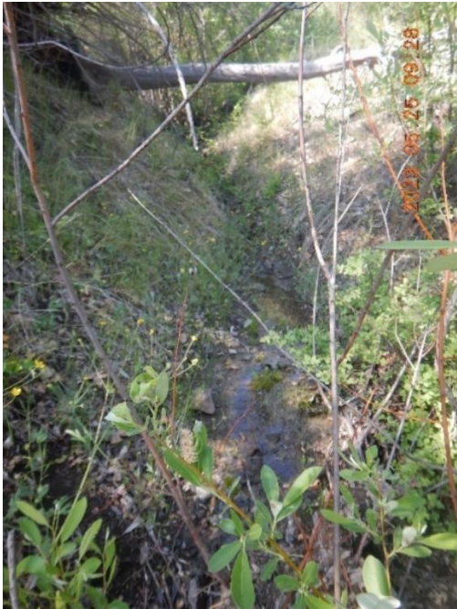
Figure 18. Channel upstream of exaction at WP 1068 was flowing water and was approximately 16" wide.