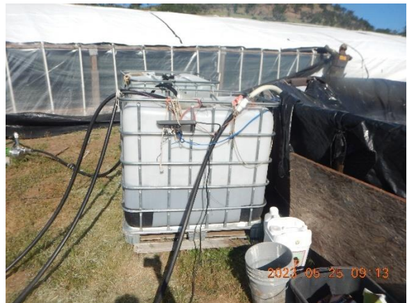
Figure 6. Feed tank located at WP 1061.