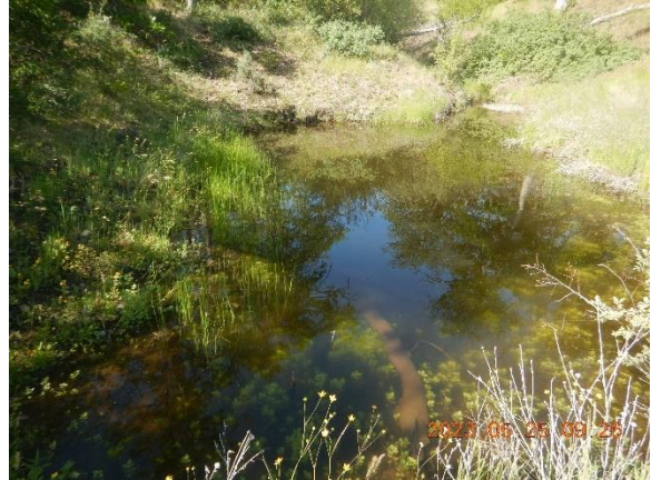
Figure 20. Looking upstream at upstream reservoir at WP 1067. Natural stream channel is at top of photo. Bullfrogs were observed by me and scientists from California Department of Fish and Wildlife.

ten feet wide, and 5 feet deep. Gravel sorting by the incoming stream was evident by a gravel bar at the upstream extent of the upstream reservoir.