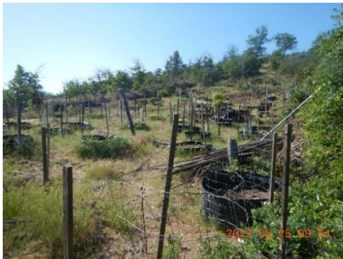
Figure 15. Outdoor cultivation located at WP 1069 had signs of recent preparation for planting (CA3).