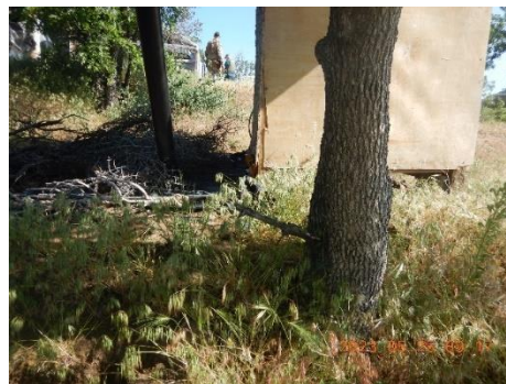
Figure 12. Toilet shed.