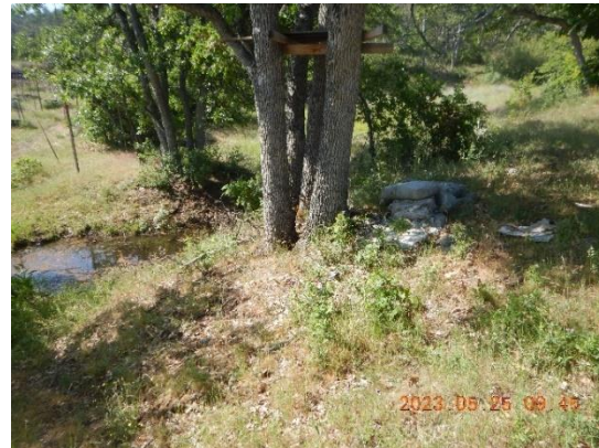
Figure 17. Near the right bank of the watercourse I observed a pile of cement bags. Discharge of cement can result in impacts to aquatic organisms due to its high pH.