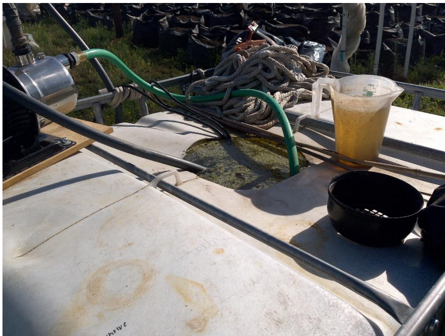
Figure 6—Photo of a nutrients mixing tank at WQ2. The tank is full of liquid and algae is visible growing in the liquid.