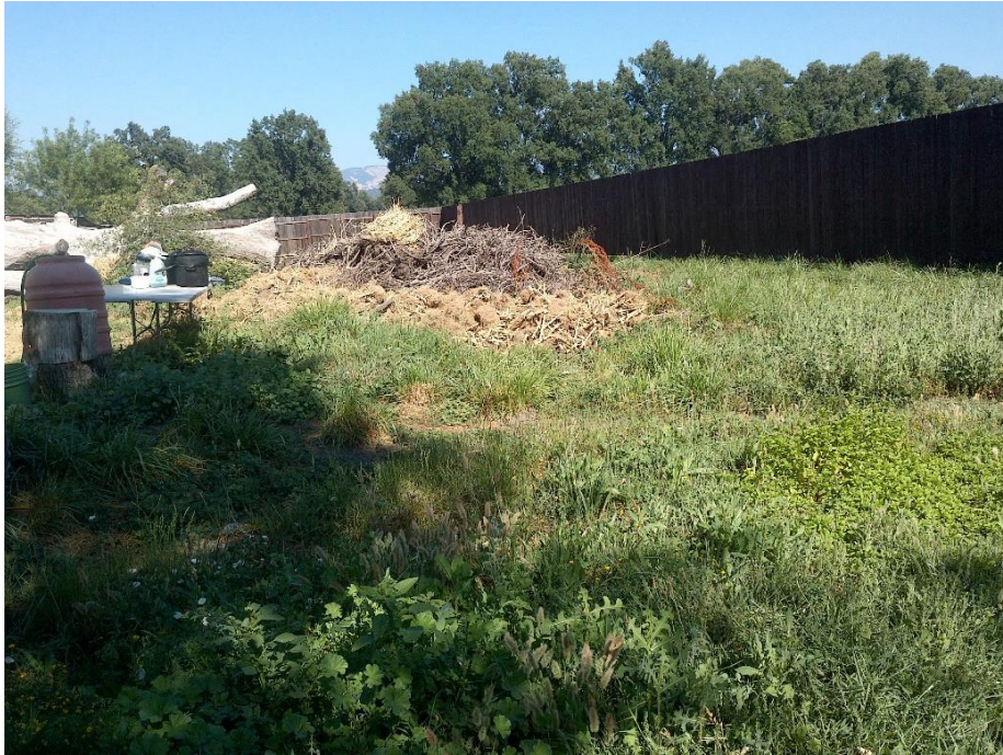
Figure 4—Looking east from WQ1 at a pile of cannabis cultivation waste including plant stalks and root balls in potted growth medium.