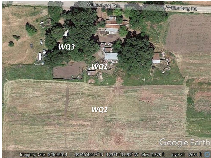
Figure 2—Aerial image of the Property taken on May 30, 2014. The image shows structures in the northern part of the Property and a plowed field in the southern part of the Property.