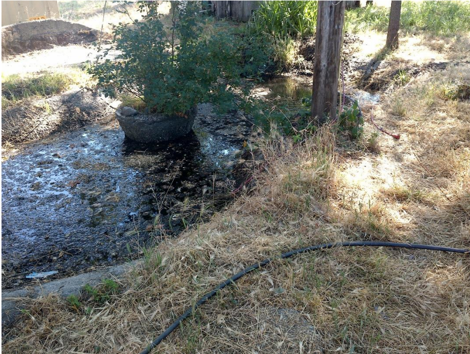
Figure 8—Photo of concrete lined pool. The well-shed at WQ3 is barely visible in the top-center of the image.