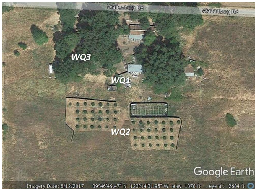
Figure 3—Aerial image of the Property taken on August 12, 2017. The image shows a hoop-type greenhouse and rows of regularly spaced plants that are similar in size and pattern to that of commonly observed outdoor cannabis cultivation.