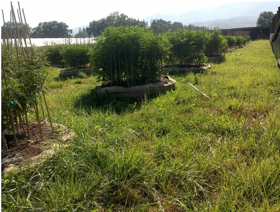
Figure 5—Looking west from WQ2 at cannabis growing outdoors in raised garden beds. A greenhouse is visible in the top left of the image.