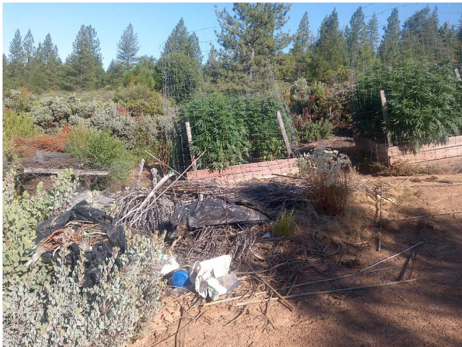
Figure 15— Photo showing cannabis plants growing in raised garden beds in the vicinity of WQ5.