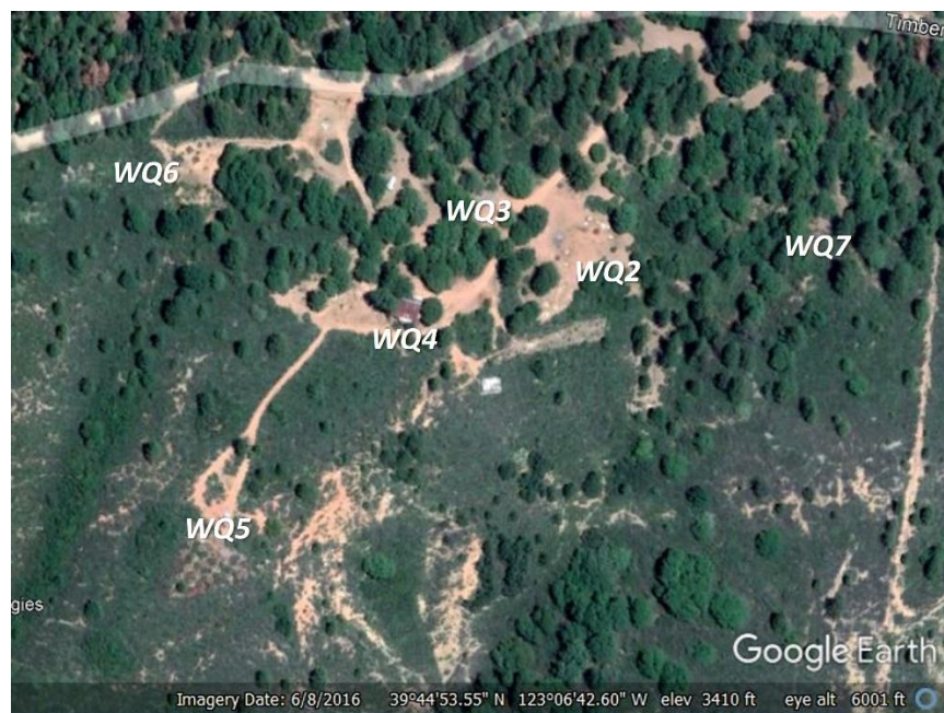
Figure 3—Aerial image of the Property taken on June 8, 2016, obtained from Google Earth. The image shows a half-dozen light colored circles north of WQ2 at the locations of future outdoor cannabis cultivation.