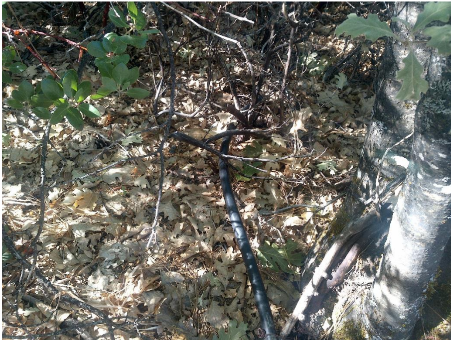
Figure 17—Photo showing black plastic tube, pictured in previous image, directed toward bushes in the vicinity of WQ6.