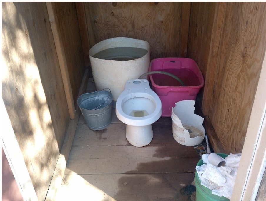
Figure 9—Photo showing a flush toilet located in a small wooden structure in the vicinity of WQ2.