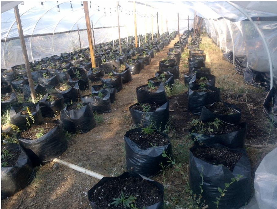
Figure 12—Photo showing small cannabis plants growing in plastic soil bags within a small hoop-type greenhouse in the vicinity of WQ4.