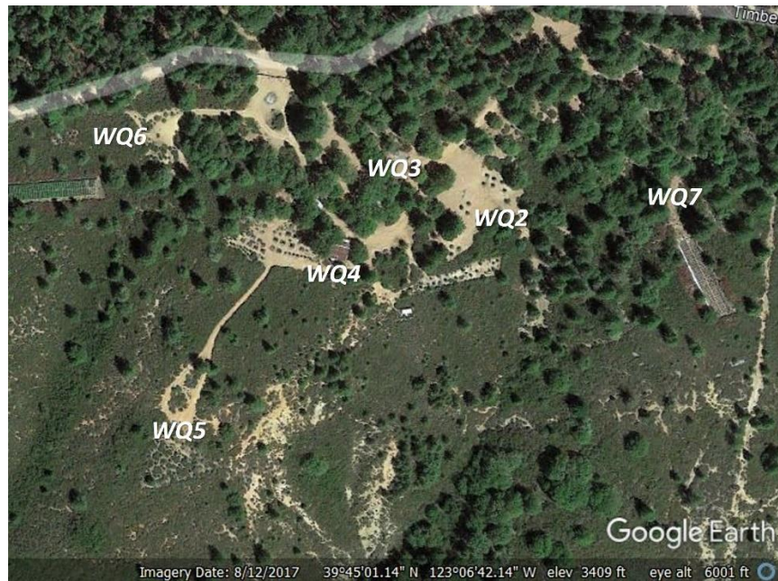
Figure 4—Aerial image of the Property taken on August 12, 2017, obtained from Google Earth. The image shows the frames of hoop-type greenhouses where staff observed cannabis cultivation during the August 23, 2023 inspection west of WQ6 and south of WQ7.