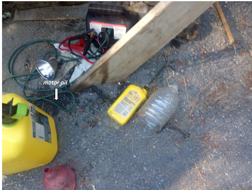
Figure 6—Photo looking at the ground near the groundwater well at WQ1. A used motor oil container and funnel are resting on the permeable earthen ground next to a darkened patch of soil where motor oil has discharged to land.