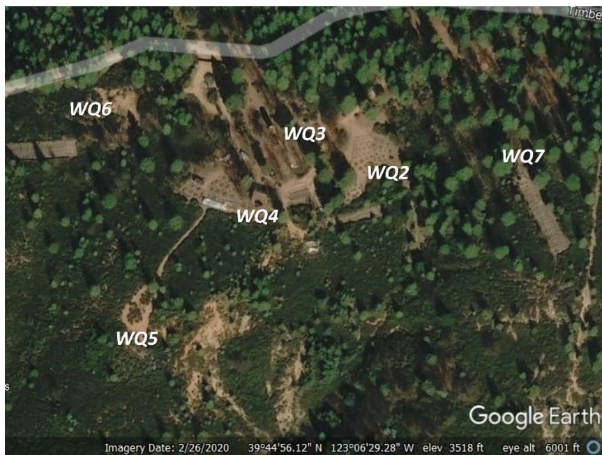
Figure 5—Aerial image of the Property taken on February 26, 2020, obtained from Google Earth. The image shows the frames of hoop-type greenhouses where staff observed cannabis cultivation during the August 23, 2023 inspection both east and west of WQ4 and south of WQ2.