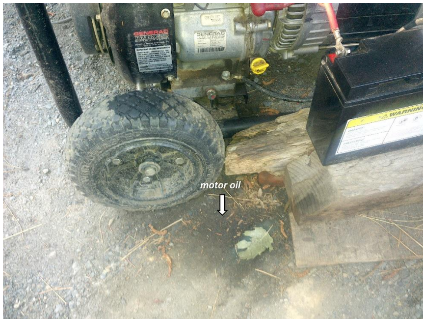
Figure 7—Photo looking at the ground below a generator at WQ1. The generator does not have secondary containment and the ground below the generator is visibly darkened where motor oil has discharged to land.