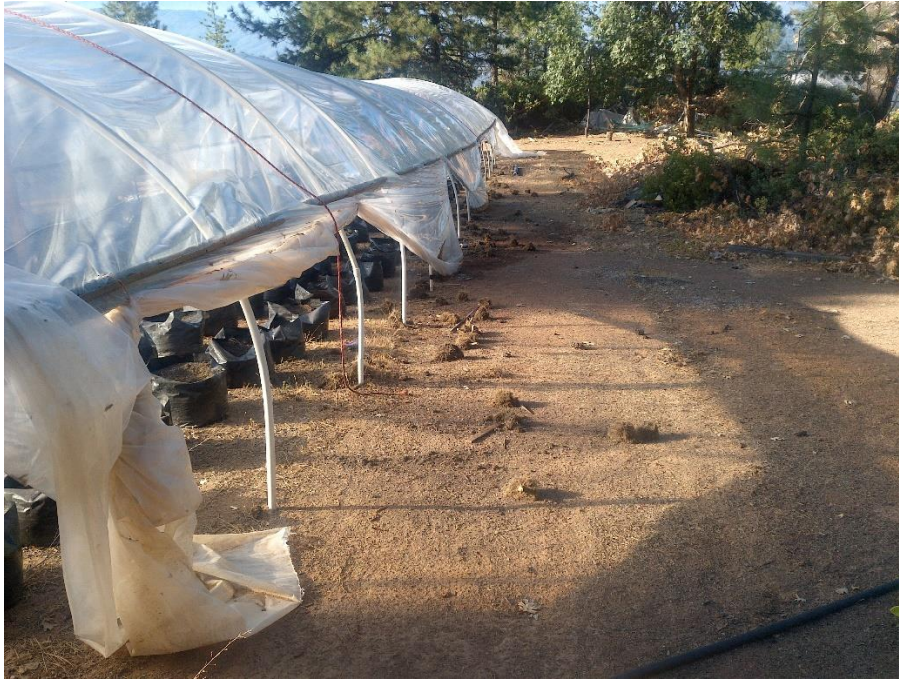
Figure 8—Photo showing a hoop-type greenhouse in the vicinity of WQ2. Root balls from cannabis plants are scattered on the ground next to the greenhouse.