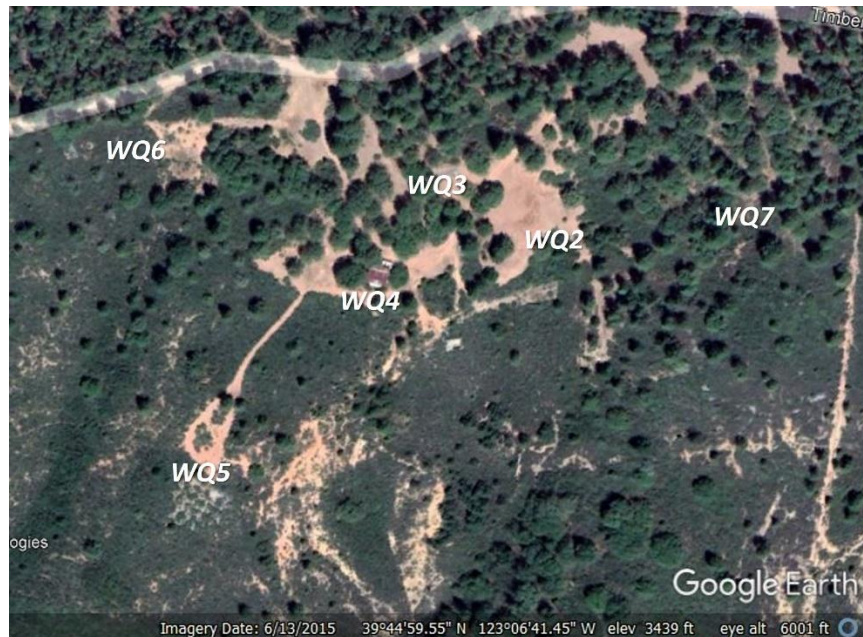
Figure 2—Aerial image of the Property taken on June 13, 2015, obtained from Google Earth. The image shows raised garden beds interspersed with native vegetation south of WQ5. The size, shape and location of the garden beds matches the cannabis cultivation observed in this area during the August 23, 2023 inspection.