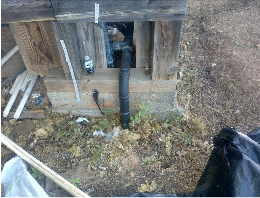
Figure 14—Photo showing where the sewage line exiting the structure at WQ4 enters the ground.