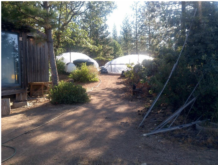
Figure 13—Photo showing a residential structure and two hoop-type greenhouses in the vicinity of WQ4.