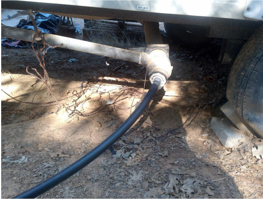
Figure 16—Photo showing black plastic tubing connected to the sewage drain lines below a trailer at WQ6.