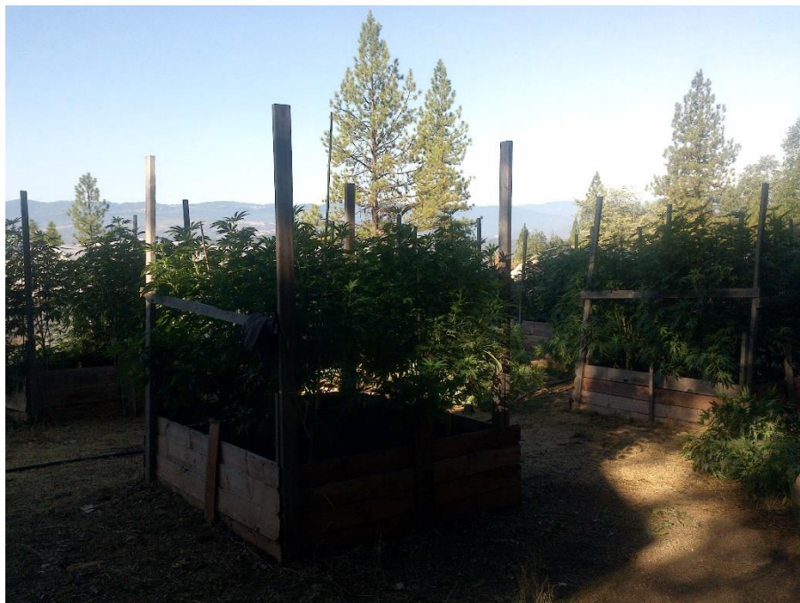
Figure 11—Photo showing cannabis plants growing in raised garden beds in the vicinity of WQ4.