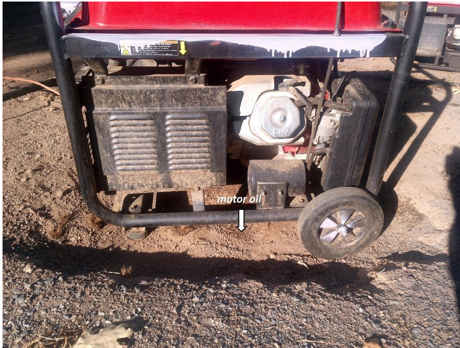
Figure 10—Photo looking at the ground below a generator at WQ3. The generator does not have secondary containment and the ground below the generator is visibly darkened where motor oil has discharged to land.