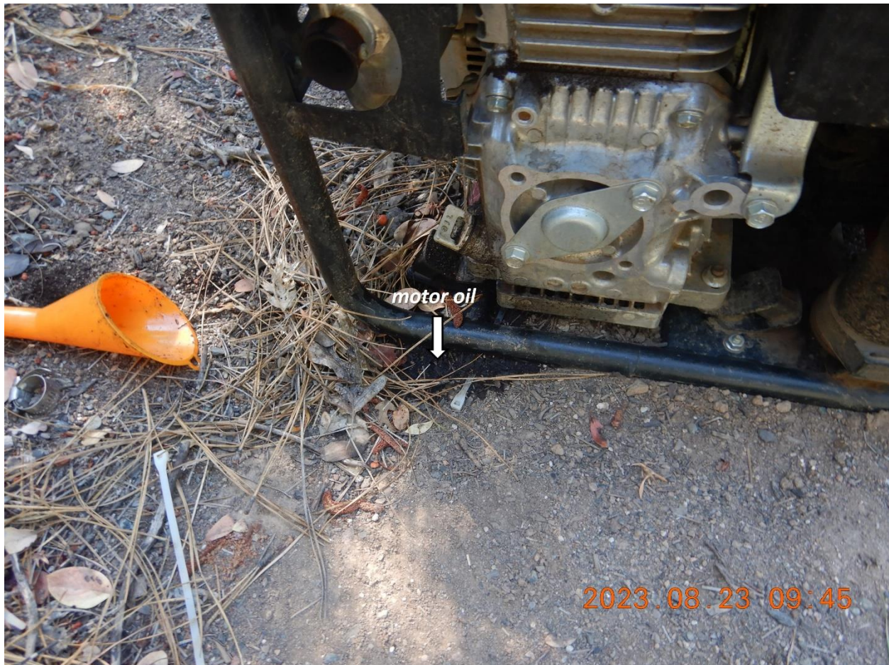
Figure 18—Photo looking at the ground below a generator at WQ7. The generator does not have secondary containment and the ground below the generator is visibly darkened where motor oil has discharged to land.