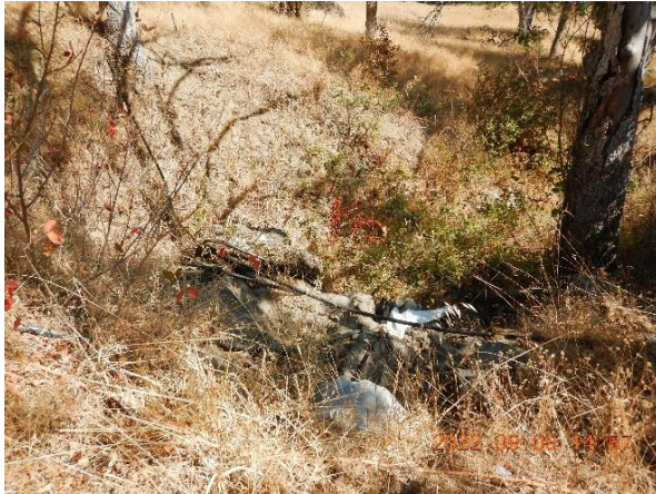
Figure 13. Culvert inlet at Crossing X1 at WP 921 (40.371095°, -123.449291°) is a culvert with road runoff delivery.