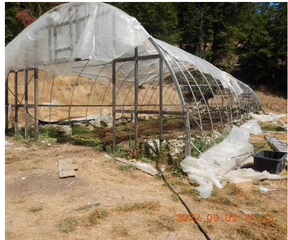
Figure 6. Cultivation Area CA1 at WP 939 (40.371583°, -123.447191°) is located near a Class III watercourse.