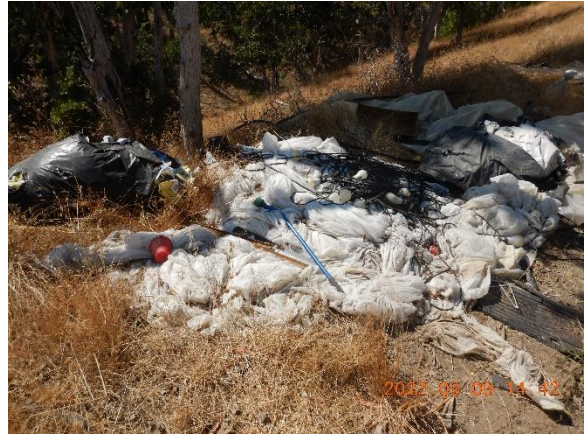
Figure 10. Example of cultivation-related refuse accumulation on Property.