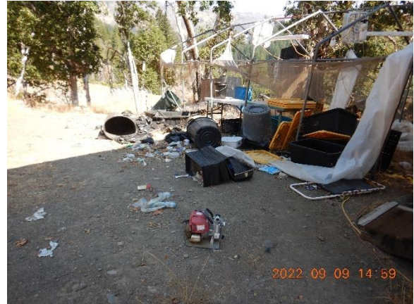
Figure 15. Refuse near house.