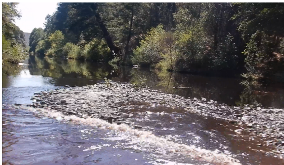
Figure 4. Use of wet ford over Mad River located at 40.373966°, -123.438870° causes turbid plumes of water to be discharged into the Mad River.