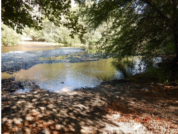
Figure 3. Wet ford over Mad River located at 40.373966°, -123.438870° has resulted in altered channel form.