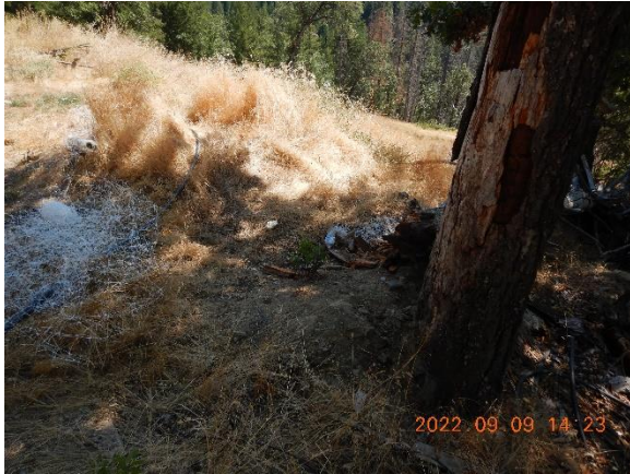
Figure 7. Cultivation-related refuse at CA1.