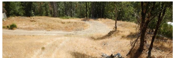
Figure 12. Example of rutted road on Property.