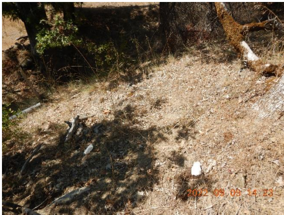
Figure 8. Class III watercourse near CA1.