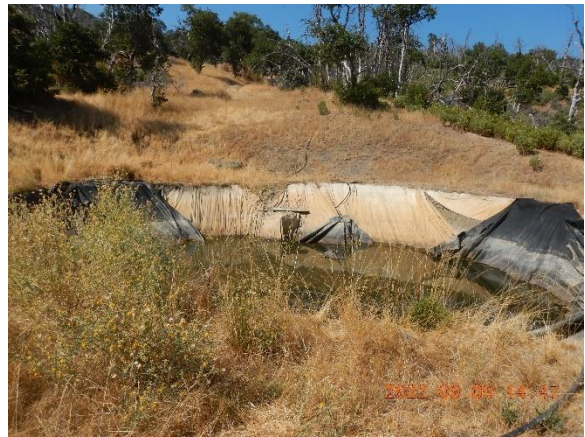
Figure 11. Pond1 is located at WP 940 (40.372367°, -123.449754°) and has over steepened interior slopes, has no outlet, tarps are falling into the excavation.