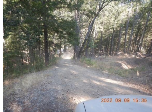
Figure 5. On the west side of the wet ford is a steep road segment that is hydrologically connected to the Mad River. The road system on the Property lacks drainage structures and are unsurfaced. Road ruts are evident.