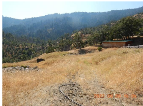
Figure 17. View of an example of a rutted road and abandoned cultivation infrastructure.