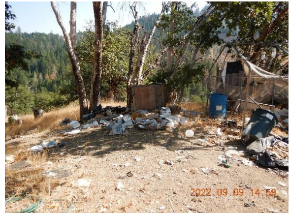
Figure 16. Uncontained refuse near house.