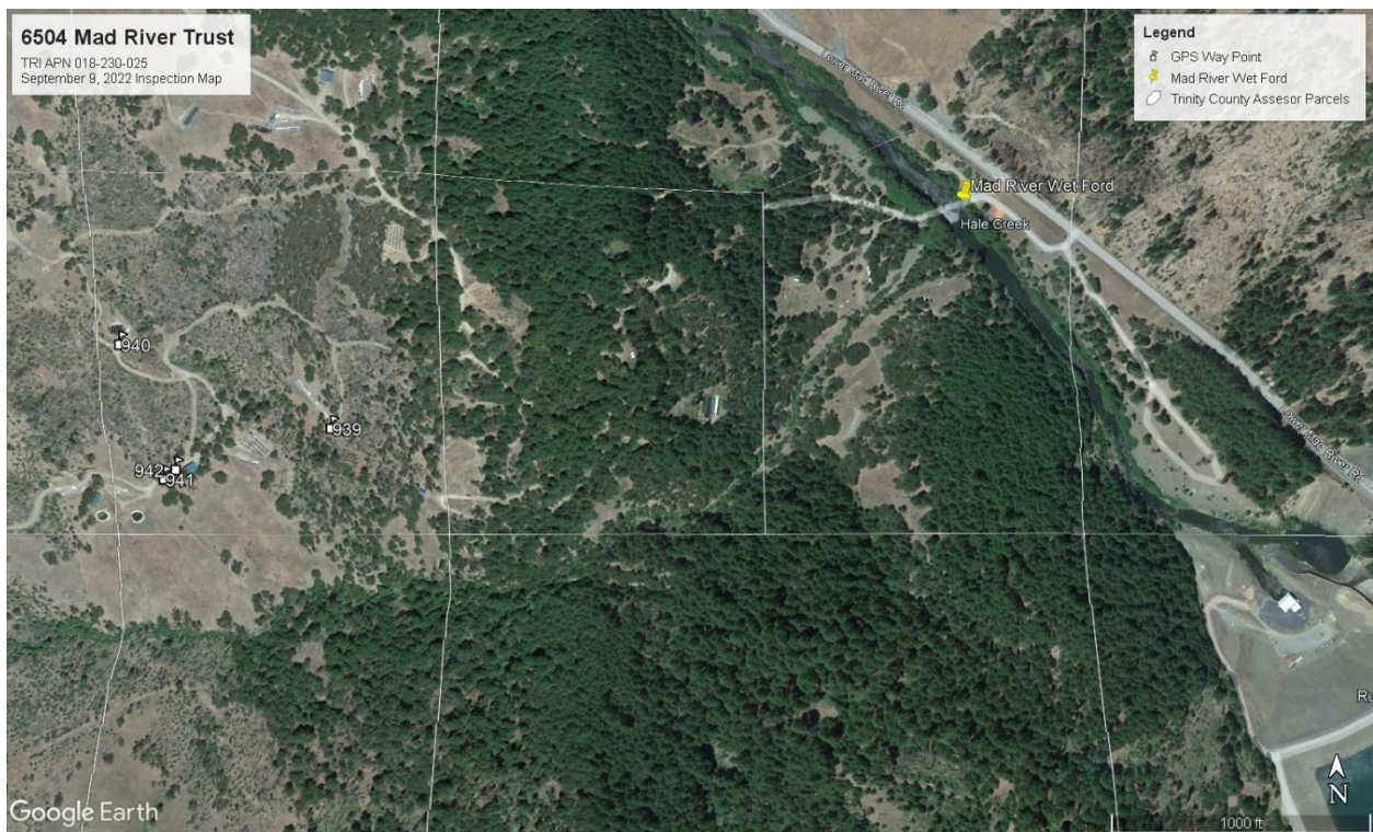
Figure 2. Inspection map.