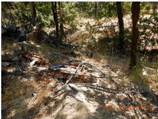
Figure 9. Below CA1, there is an accumulation of abandoned water line in watercourse.