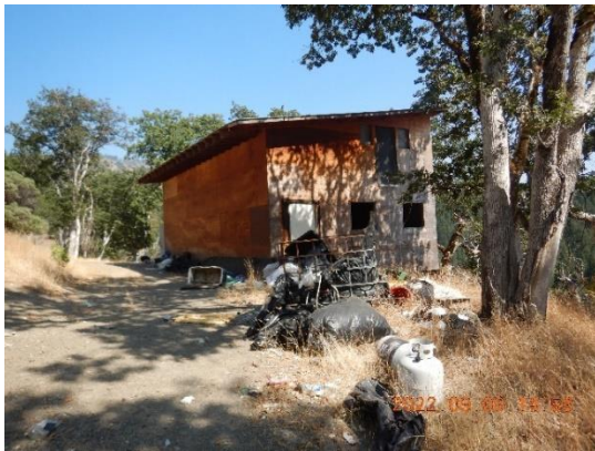
Figure 14. Area around house (40.371183°, -123.449141°) is strewn with refuse, including uncontained rodent poison.