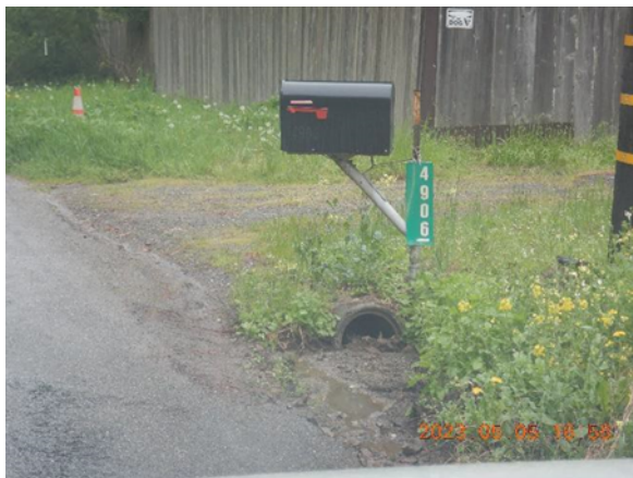
Figure 30. The ditch goes under the next driveway associated with 4906 Greenwood Heights (APN 404-061- 004).