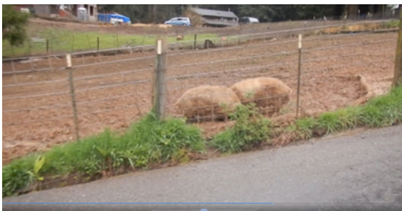
Figure 8. Three pigs were visible in the roadside enclosure. Offensive odors were obvious to me from the roadway.