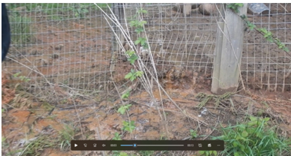
Figure 9. Waste runoff from the enclosure leaves the area and runs down the inside ditch of Greenwood Heights Road and down a hillslope to a logging road.