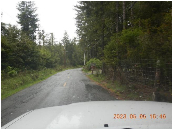
Figure 4. Driveway and mailbox associated with 5032 Greenwood Heights Road. The Property is on east side of roadway (photo looking approximately north).