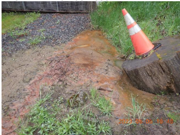
Figure 25. Deposits on driveway associated with APN 404- 051-007.