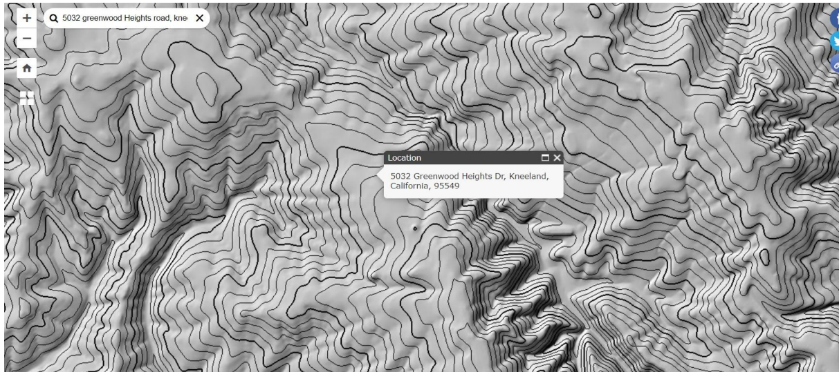
Figure 3. LiDAR with contours. The Property is located on the ridge between Freshwater Creek and Jacoby Creek.