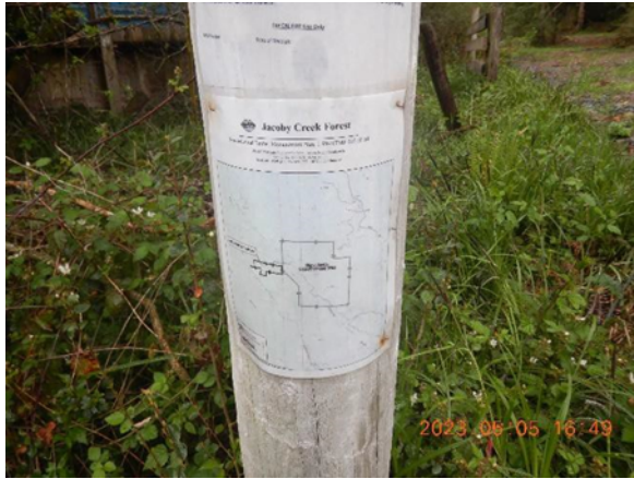
Figure 14. At the intersection of the logging road with Greenwood Heights Road, a sign is posted associated with a Non-industrial Timber Management Plan (NTMP).