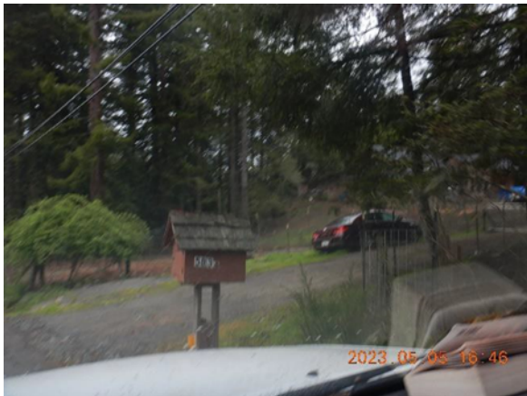
Figure 5. Driveway and mailbox.