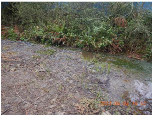
Figure 21. Muck on outside edge of logging road.