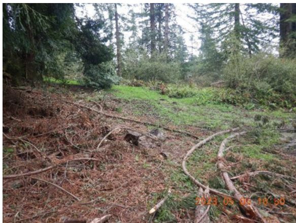
Figure 17. Runoff from the pig comes down a grassy slope onto the logging road.