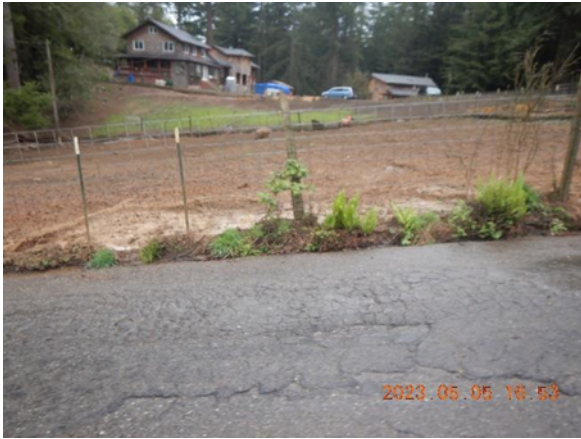
Figure 7. View of enclosure and house.