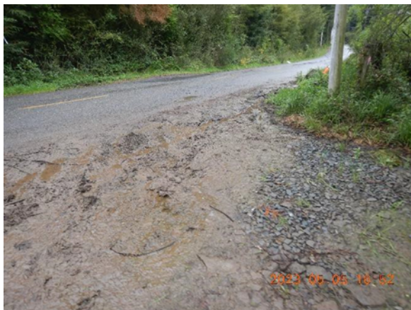
Figure 23. Pig-waste muck from the ditch and the logging road runs to Greenwood Heights Road.