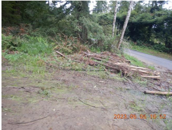
Figure 22. The logging road at Greenwood Heights.