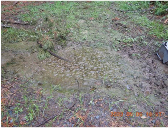
Figure 19. Muck crossing logging road