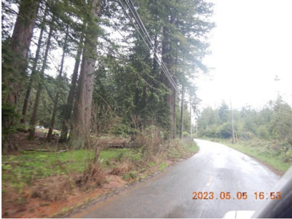
Figure 11. Waste runoff is visible in the inside ditch downslope (north) of the Property.