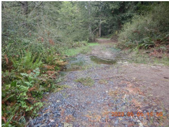
Figure 16. Runoff from the pigs crosses the logging road as evidenced by deposits on the gravels and green algae growth.