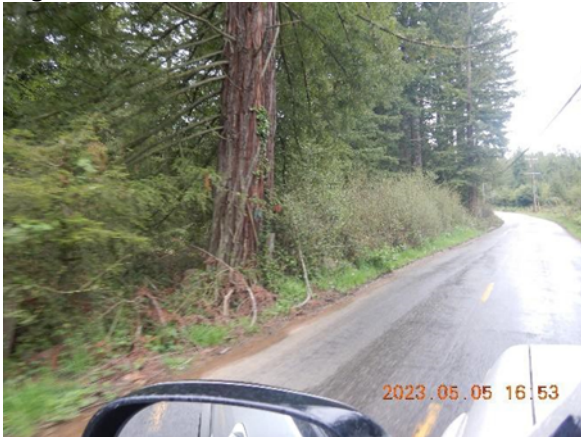
Figure 12. Waste deposits are visible along the eastern road edge.