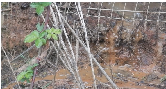
Figure 10. Picture of polluted runoff seeping from enclosure.