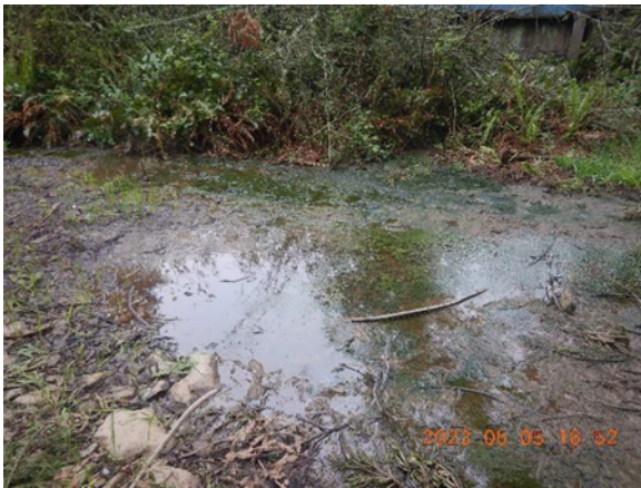
Figure 20. Muck leaving logging road to next property north.