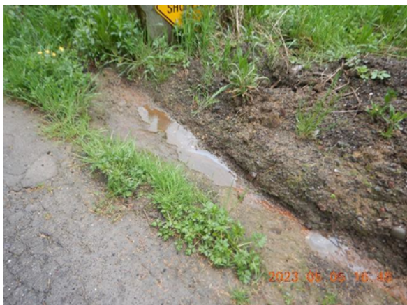
Figure 27. Ditch.