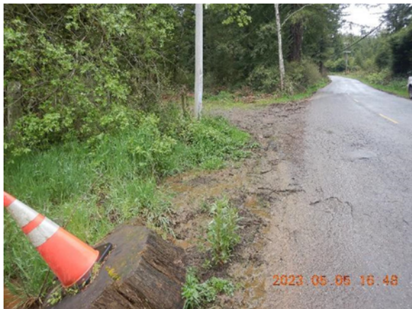
Figure 24. Runoff goes down the inside ditch of Greenwood Heights and deposition is evident.