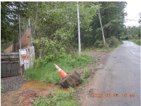
Figure 13. At the northern boundary of the parcel, the Property adjoins a logging road. Runoff crossing the logging road at Greenwood Heights Road.