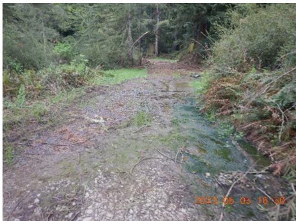
Figure 18. Pooled green muck on logging road.