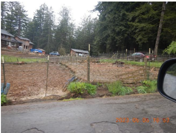
Figure 6. Photo of enclosure used by pigs. Driveway is on right of photo. There are two levels in the enclosure, both with accumulated waste. Around the house area is also cleared and appeared to be used by pigs also.