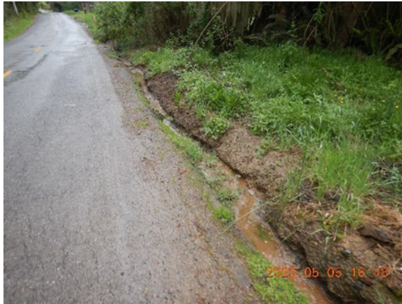
Figure 28. Ditch.