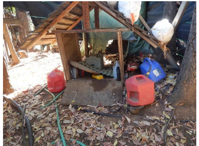
Photos 5 and 6: Generator on pallet (left), and fuel storage area with spills (right).