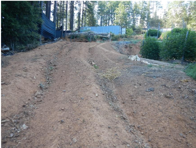
Photo 1: Dirt access road with ruts running alongside terraces with cannabis plants in raised beds.