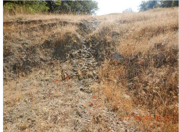
Figure 10. Channel upslope of Pond 1.