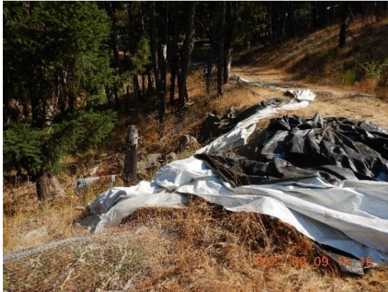
Figure 7. CA1 is next to a Class III watercourse, as indicated by metal culvert beyond plastic tarp.