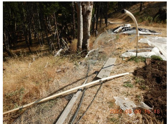
Figure 6. Cultivation area CA1 located at WP 943 (40.378419°, -123.448358°).