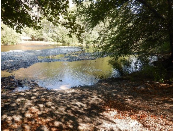
Figure 3. Wet ford over Mad River located at 40.373966°, -123.438870° has resulted in altered channel form.