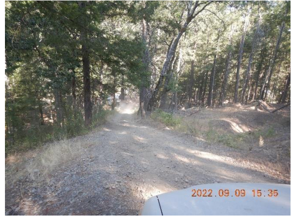
Figure 5. On the west side of the wet ford is a steep road segment that is hydrologically connected to the Mad River. The roads lack drainage structures and are unsurfaced. Road ruts are evident.