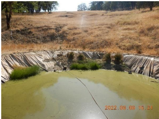
Figure 9. A channel enters Pond 1 from upslope.