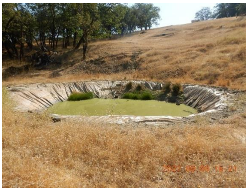
Figure 8. Pond 1 is located at WP 944 (40.377796°, -123.448741°).