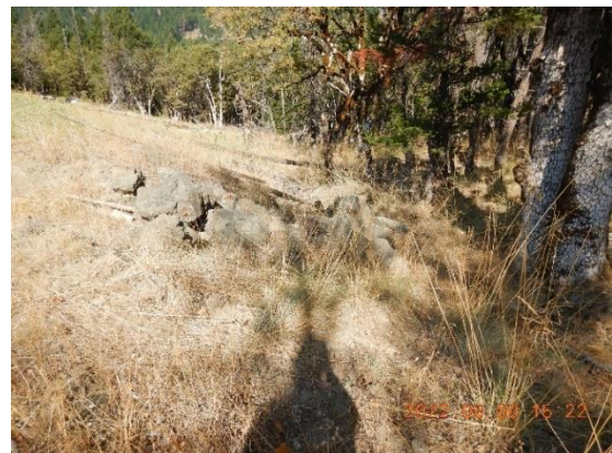
Figure 12. Pond 1 rocked spillway.