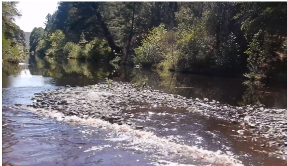
Figure 4. Use of wet ford over Mad River located at 40.373966°, -123.438870° causes turbid plumes of water to be discharged into the Mad River.