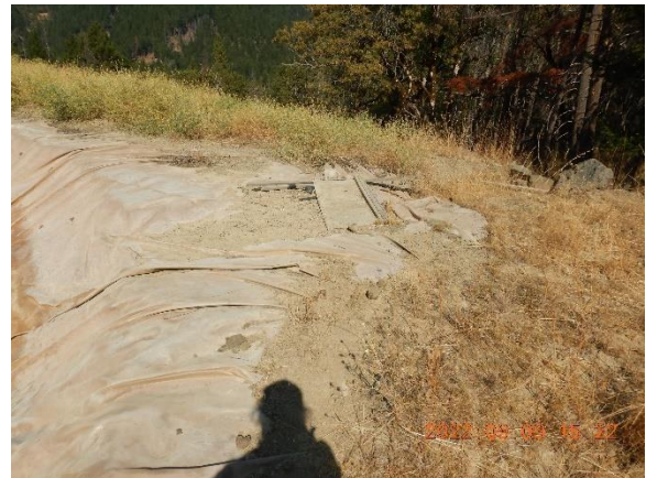
Figure 11. Pond 1 outlets to rock.