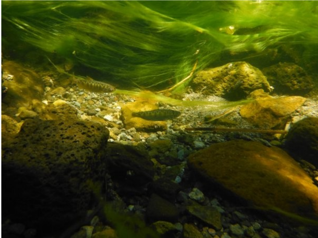
Chinook Salmon.