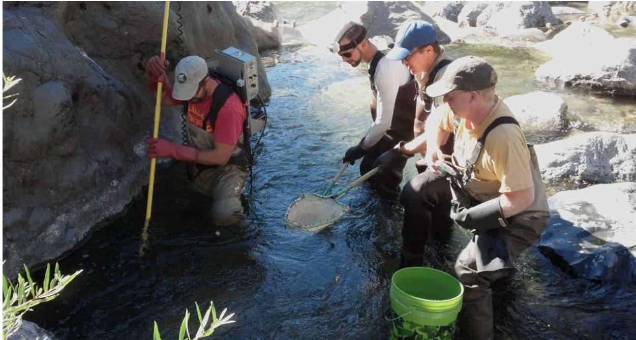
Monitoring salmonids.