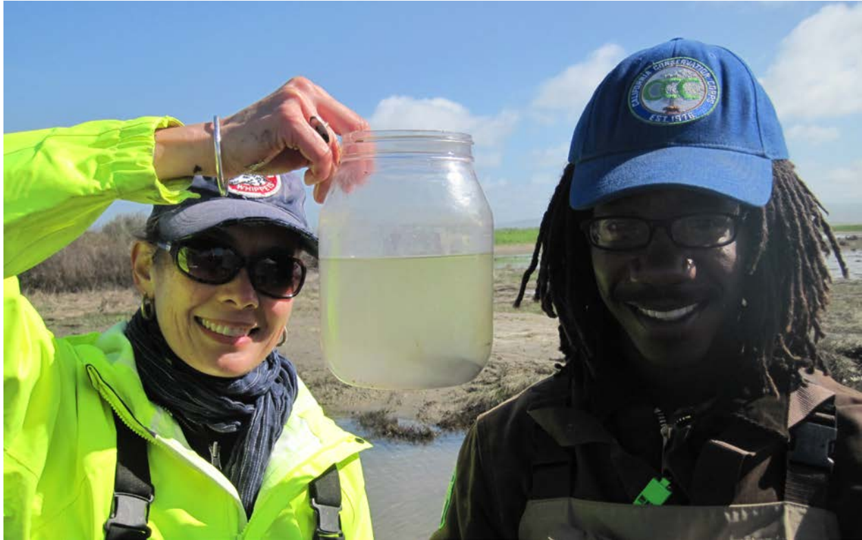
Monitoring juvenile salmonids.