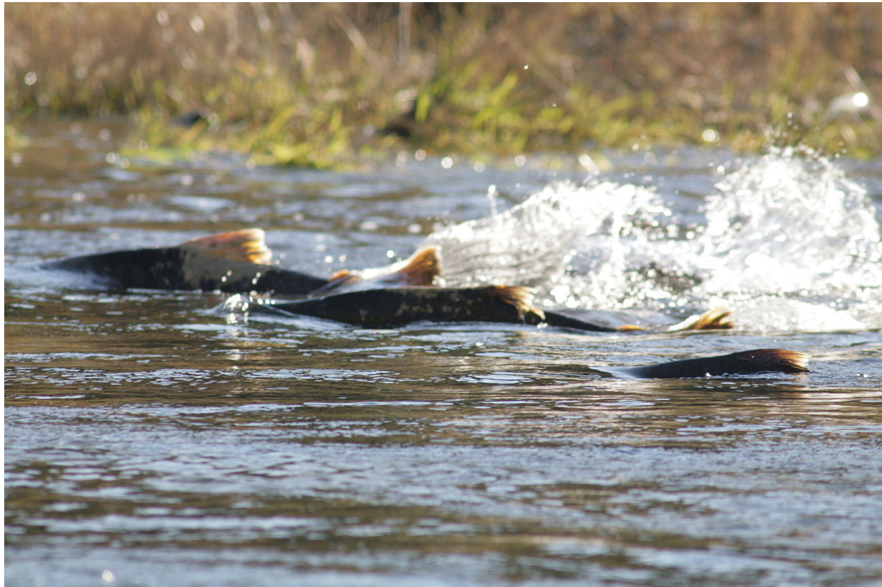
Chinook salmon.

populations. Spawner abundance numeric targets were established for each essential and supporting population, for each Diversity Strata, and for the ESU and DPS.