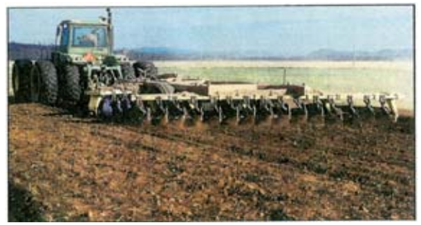
A second pass over the field with the tandem disk at a 45 to 90 angle to the first disking assures more complete incorporation of the ash.

In August 2012, the Executive Officer issued an Order requiring information regarding the current management practices at each of the four biomass power plants (generators) in the region. Staff evaluated the resulting information and reported our findings to the Board at the December 2012 Board meeting. At this Board meeting, staff confirmed that in the ash generated on the North Coast constituents of concern, including dioxin. were found to be generally below regulatory criteria for the protection of human health. Because pollutant levels are low there are a variety of opportunities for beneficial reuse of wood ash byproducts in the region using assorted regulatory mechanisms applied for the protection of water quality. One mechanism available is Resolution No. R1-2012-0099, the Policy for Waiving Waste Discharge Requirements for Specific Types of Waste Discharge in the North Coast Region (General Waiver). The General Waiver may be used to regulate ash as an industrial waste utilized for soil amendment.