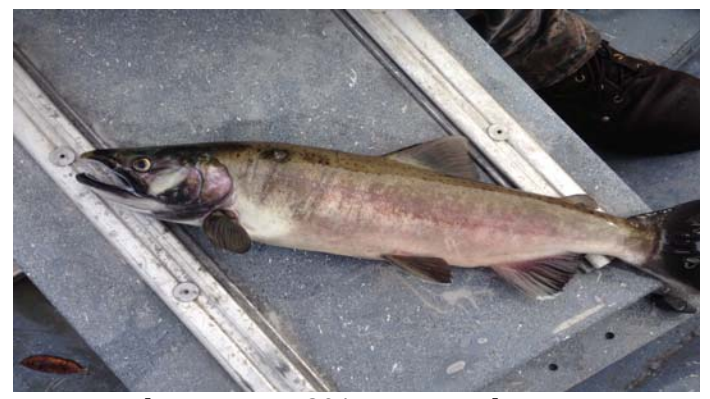
J. Warmerdam, January 2014. Deceased two-year old, male coho salmon. Lower Garcia River.

salmon, known as a "jack", but could not determine the cause of its death.