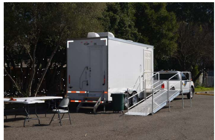
HOST Mobile Bathroom Shower Trailer.

The trailer, in addition to providing access to clean showers and bathrooms, will serve as an outreach tool to further HOST's efforts to engage homeless persons in our community into services. Catholic Charities will own and operate the 16 feet long by 7 feet wide trailer which has two bathroom-shower units. In addition to providing a necessary service for the homeless. The trailer will provide critical water quality protections.