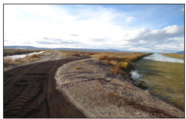
Irrigation drains and access roads in Tule Lake Watershed.

Highlights included the Lost River, the Tule Lake sumps, wildlife refuges, irrigation water supply canals, irrigation drains, water movement practices, farming practices, and the wetland restoration program known as walking wetlands.