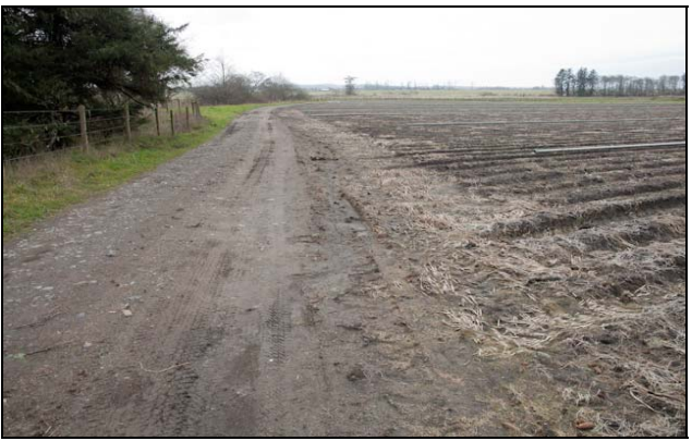
Lily bulb fields and tractor turn around area.

Members of the Easter lily bulb agricultural community also generously hosted a tour for Regional Water Board staff. Easter lily bulbs are grown in a small area of Del Norte County on the plain bordering the Smith River estuary. Highlights included a presentation on growing practices and timing, pesticide use, and monitoring history followed by a field visit of planted fields, rotational grazing fields, best management practices, and receiving water bodies.