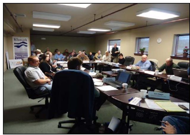
Tulelake/Butte Valley Advisory Group Meeting.