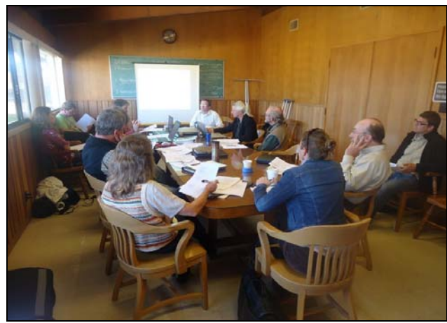
Humboldt/Trinity/Del Norte Advisory Group Meeting.

http://www.waterboards.ca.gov/northcoast/water issues/programs/agricultural lands/.