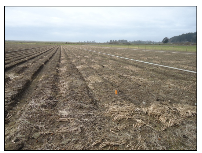
Lily bulb fields with straw residue check dams in the furrows, irrigation pipe, and rotational grazing field (on the far side of the fence).