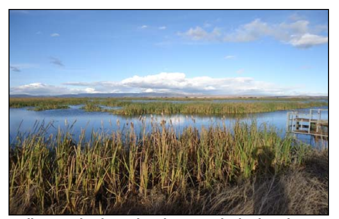
Walking wetland in Tule Lake Watershed.