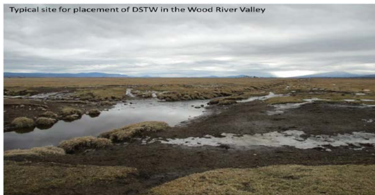
The NCRWQCB and California State Coastal Conservancy are in the final stages of contract approval and hope to initiate construction of three to four DSTWs in May 2015. Construction is planned to be completed by September 2015, with

The DSTWs were selected at the Water Board sponsored 2012 Upper Klamath Basin Water Quality Improvement Projects Workshop (held in Sacramento, CA) as a practical and cost-effective tool for improving water quality in Upper Klamath Lake and improving riparian habitat conditions in these biologically rich tributaries.