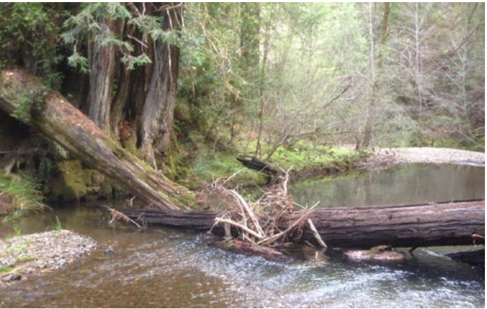
Accelerated recruitment project on Jackson Demonstration State Forest.

For the first time in California history, an important experiment - known as a before-after control-impact (BACI) study - is being implemented to determine whether the reintroduction of large woody material indeed produces more fish, namely, critically endangered coho salmon and threatened steelhead trout.