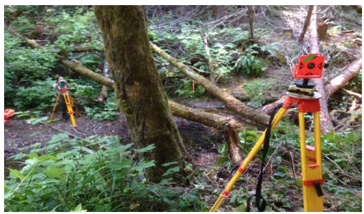
CHAMP monitoring demonstration at large woody restoration site.

This proven method has been highly effective at treating streams and rivers in Mendocino County over the past decade, and employs two primary methods for introducing large woody material into the stream: (1) directional falling and/or winching of streamside conifers into the stream from within the riparian zone, or (2) transporting trees from upslope locations into the riparian zone for placement with heavy equipment. To mimic natural conditions, introduced trees are not anchored in place like traditional engineered structures, but rather are woven into the existing forest stands and wedged against standing riparian trees or other natural hard points like bedrock, boulders, or natural topographic features.