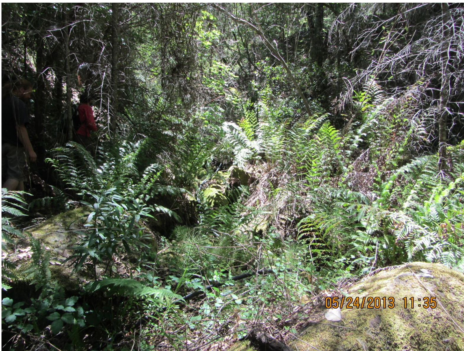
Franklin Property inspection 5/24/2013 Reference Stream at POD 2 image taken by Stormer Feiler (4558)