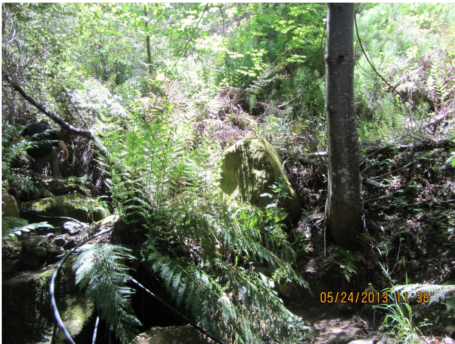
Franklin Property Inspection 5/24/2013 Reference Stream near POD #2 by Stormer Feiler (4564)