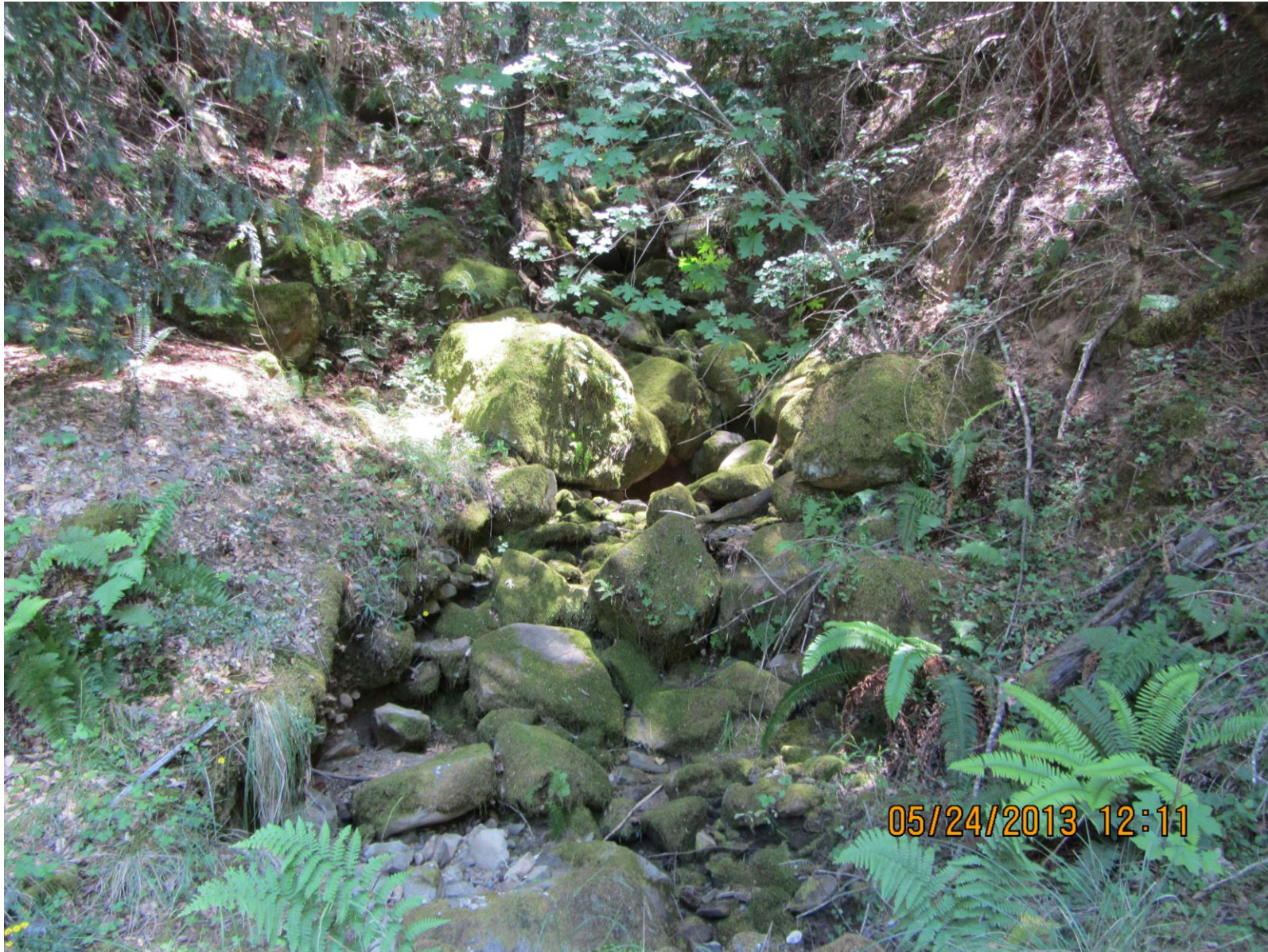
Franklin Property Reference Stream near POD 2- Image Date 5/24/2013 taken by Stormer Feiler (4590)