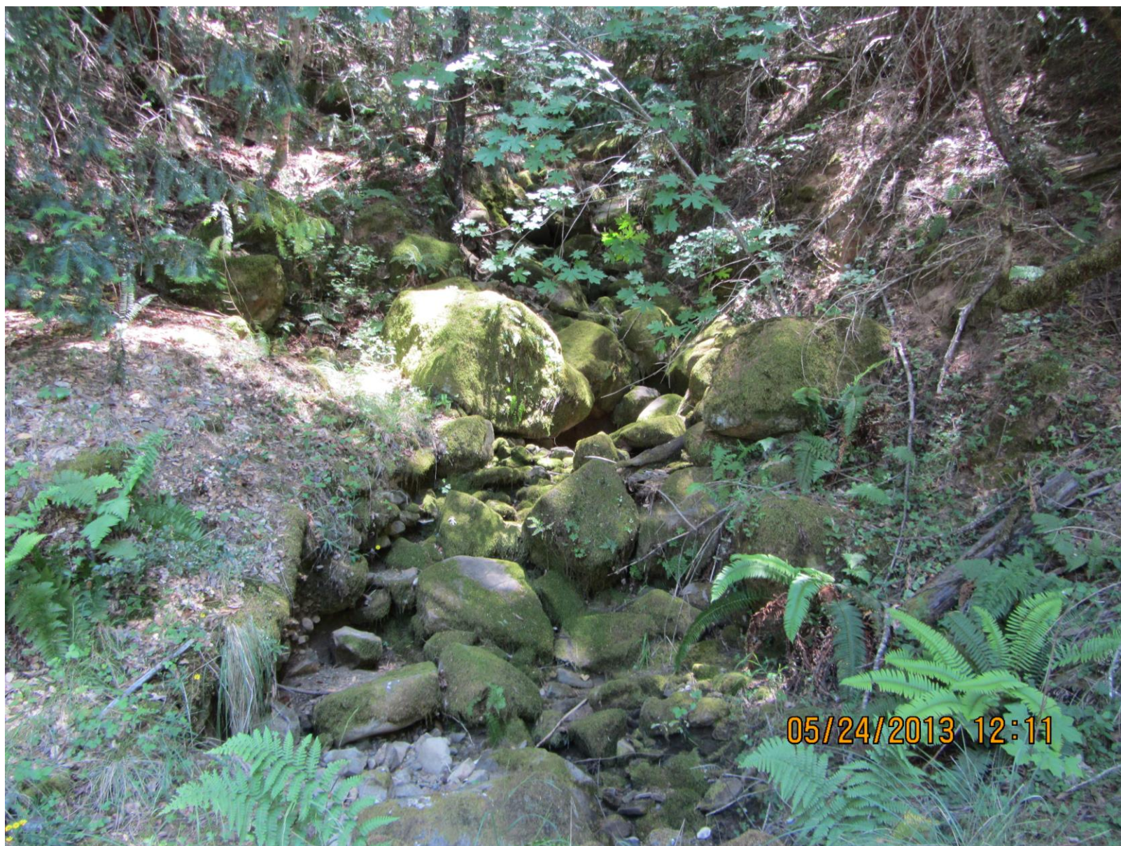
Franklin Property Reference Stream near POD 2- Image Date 5/24/2013 taken by Stormer Feiler (4590)