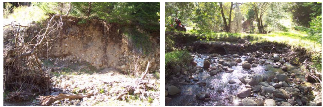
Figure 1. Example of an eroding bank of a headwater stream in the Pepperwood Preserve (left) and poorly designed stream culvert systems (right).

The erosion sites at Pepperwood Preserve are road and ditch systems that are hydrologically connected to the stream channels discharging to Mark West Creek and eventually the Laguna de Santa Rosa. These systems are either threatened to erode, or actually eroding as the result of poor stream crossing designs, the presence of springs, and/or inadequate storm flow drainage facilities. Figure 1 illustrates the type of sites being addressed.