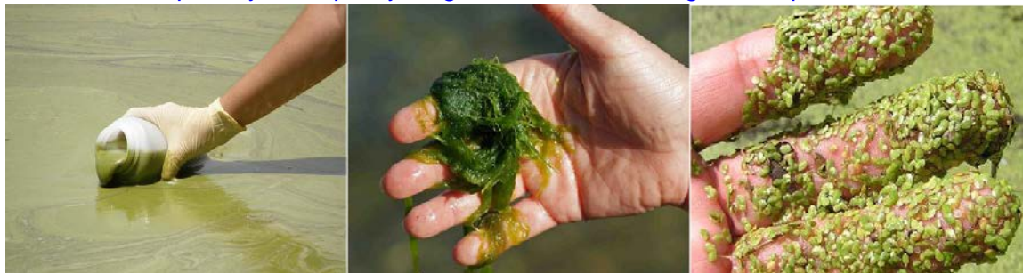
Figure 2. (from left to right): Cyanobacteria bloom, green algae and duckweed.

For help identifying a HAB, check out this visual guide fact sheet available on the CA HABs Portal here: https://mywaterquality.ca.gov/habs/what/visualguide_fs.pdf