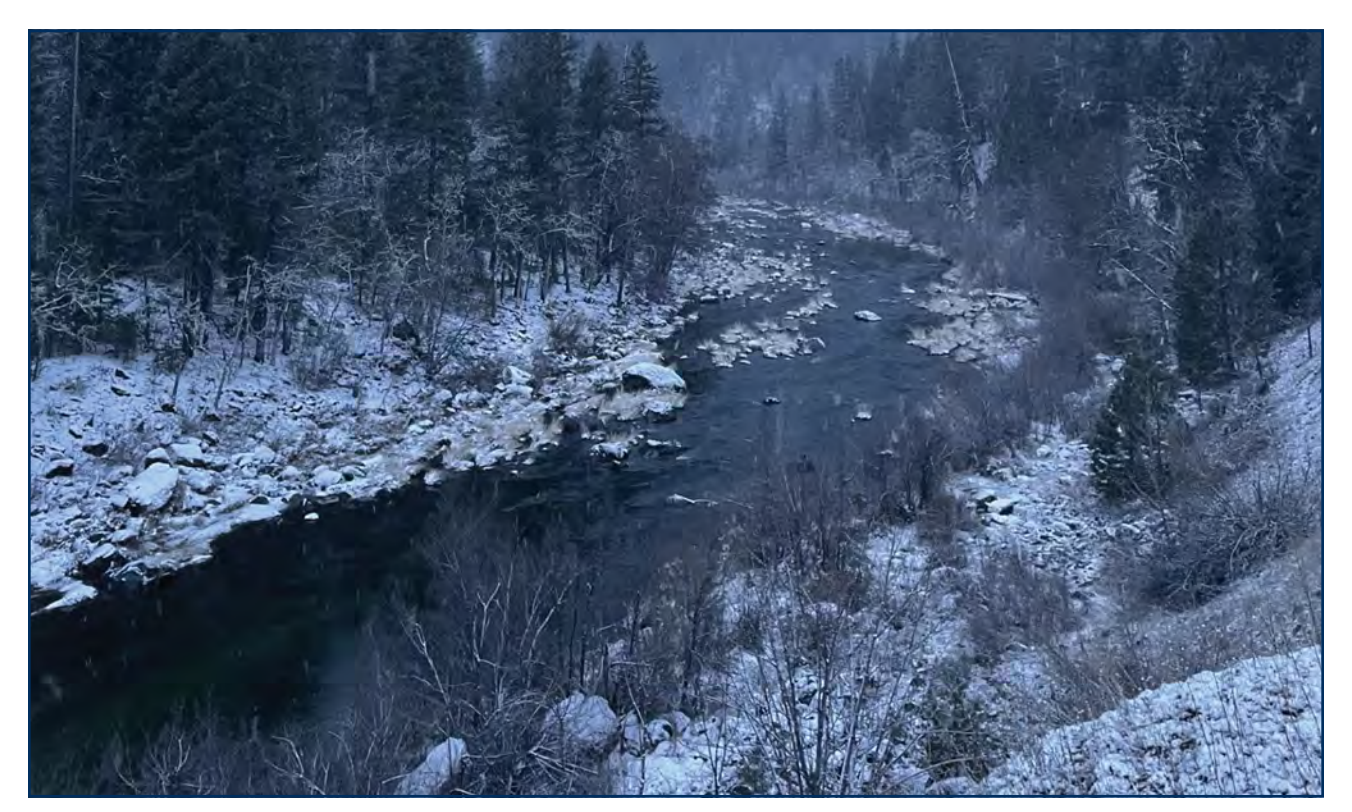
Scott River outside Fort Jones