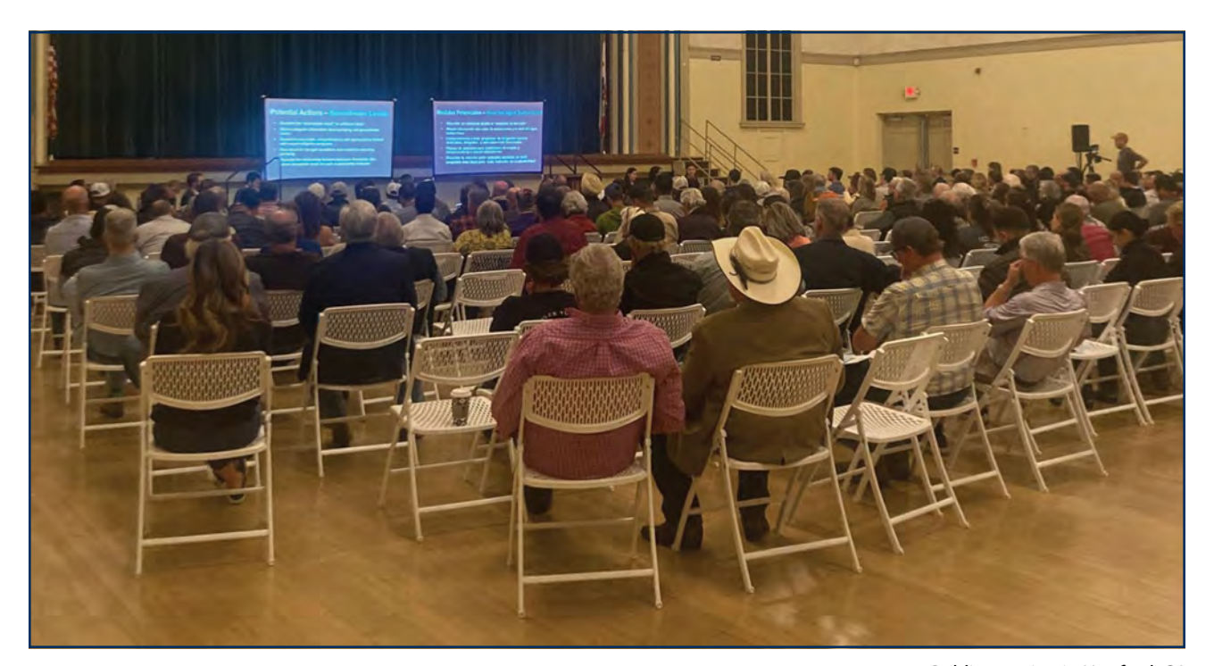
Public meeting in Hanford, CA

individual engagement needs of communities will be considered, informing the final staff recommendations to the State Water Board regarding possible intervention.