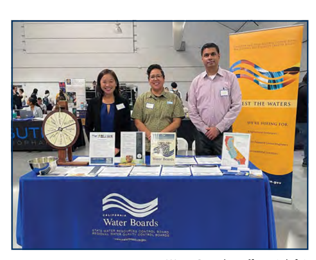
Water Boards staff at a job fair