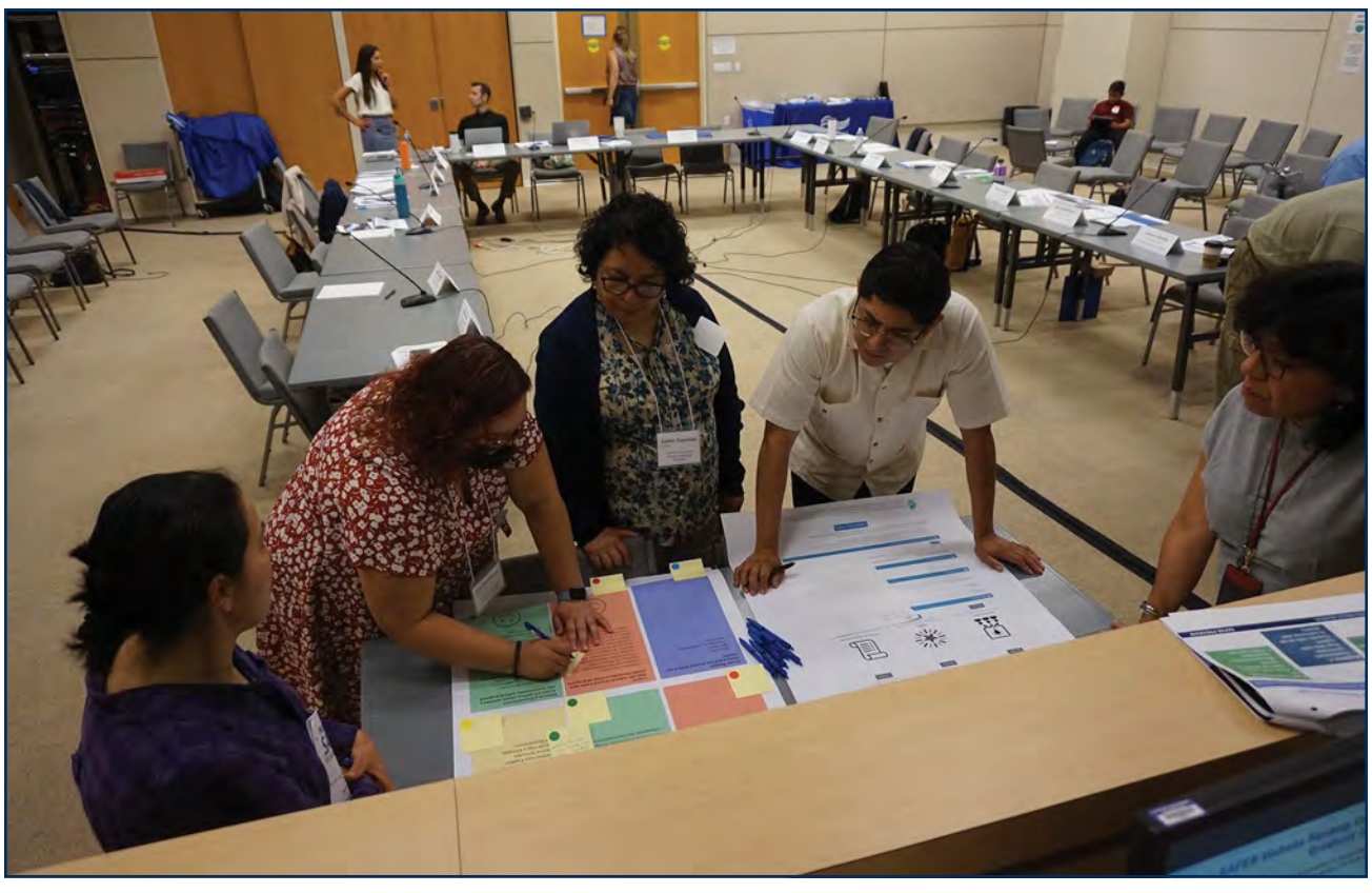
Water Boards staff receiving input in Spanish through a collaborative breakout session for the Safe and Affordable Funding for Equity and Resilience (SAFER) drinking water program's Advisory Group meeting.

The Office of Public Participation is actively working on this project and anticipates the draft guidance will be released in 2024.