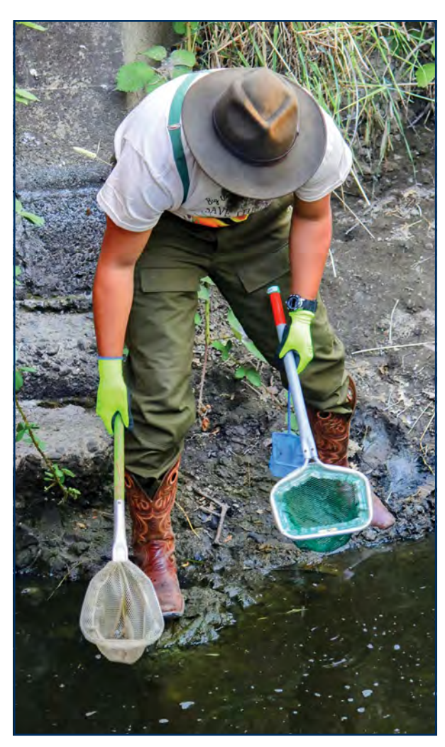
Water Board staff participating in a Chi/Clear Lake Hitch fish rescue