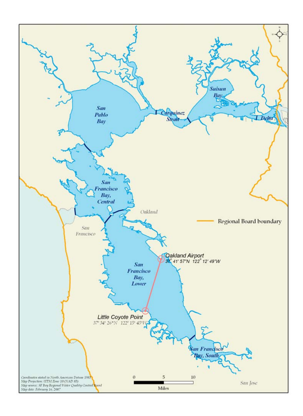
<u>Figure 7.1 Segments of San Francisco Bay showing location of Hayward Shoals as a line connecting Little Coyote Point and the Oakland Airport.</u>