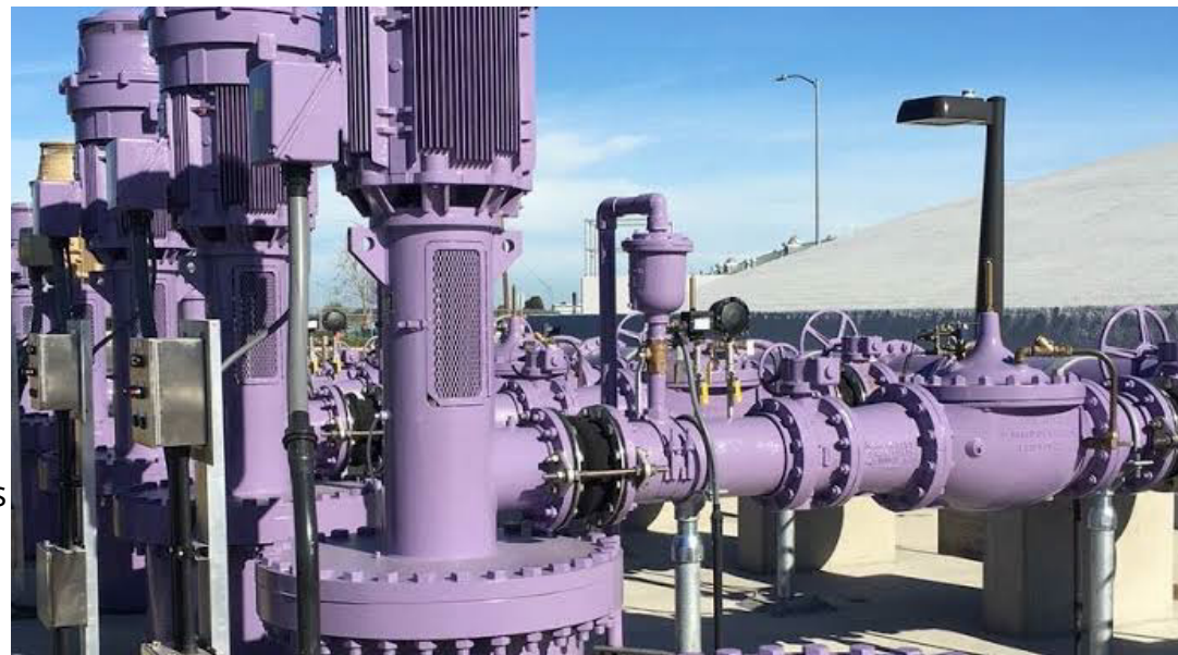
Photo above: Recycled water infrastructure

We coordinated with the Central Valley Region on its review and approval of Solano County's LAMP. We are continuing to work with Contra Costa, Marin, and Napa county staff, and are coordinating with the North Coast Regional Board, which has responsibility for approval of Sonoma County's LAMP.