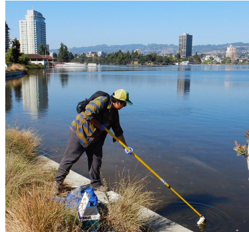
Photo above: Collecting a harmful algal bloom sample, Lake Merritt, Oakland