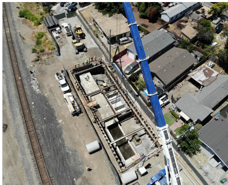
Photo above: Installation of an underground trash collection device, Oakland