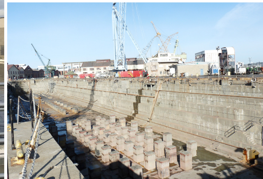
Photo below: Dry docks at Mare Island, covered under the Dry Docks NPDES general permit