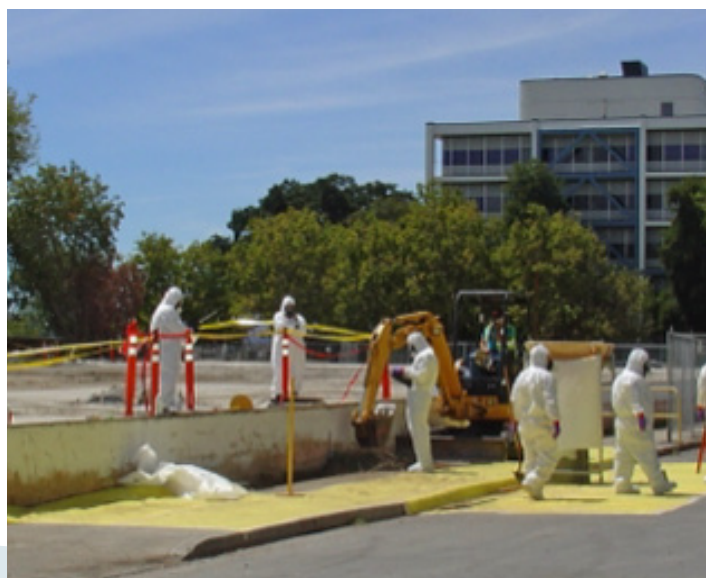
Photo above: Removal of mercury from soil at Lawrence Livermore National Laboratory, a DoE site

On October 15, 2025, we issued the final petroleum case closure to Lennar Mare Island, LLC for petroleum cleanup at the 675-acre Eastern Early Transfer Parcel. This was the last of approximately 240 petroleum cleanups at 14 investigation areas that have been open for over two decades. The remedial actions completed at the Eastern Early Transfer Parcel will enable the City of Vallejo to redevelop and create a vibrant mixed-use community with new housing, diverse commercial and industrial businesses, and expanded public spaces ensuring the maximum benefit to the environment and the people of Vallejo.