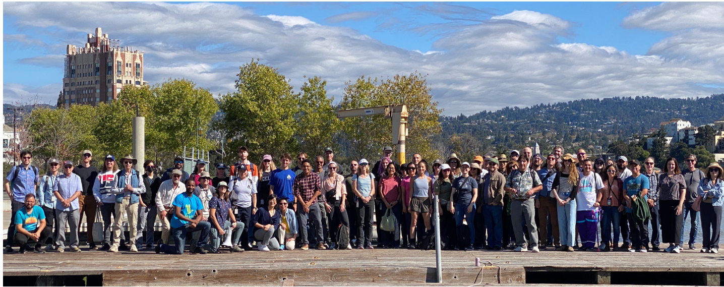
Photo below: Our staff gathered at our annual field trip at Lake Merritt, Oakland

We work across the nine Bay Area counties – Alameda, Contra Costa, San Francisco, Santa Clara, San Mateo, Marin, Sonoma, Napa, and Solano counties – to protect water quality and the environment for the region's over seven million residents.