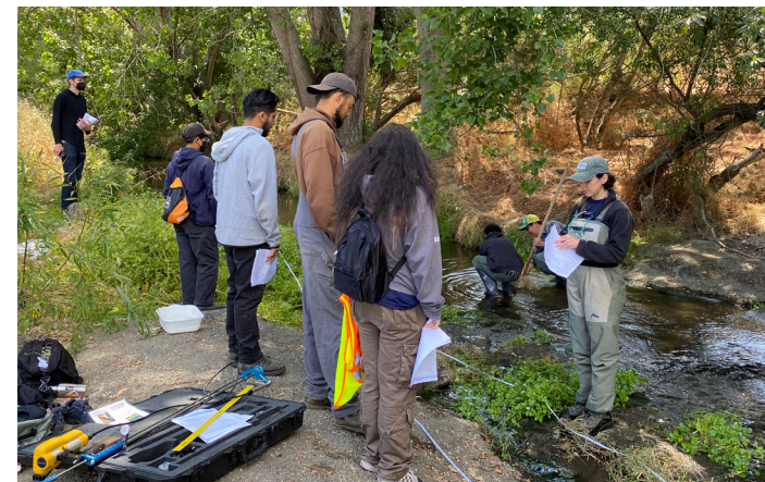
Photo below: Water Board staff provide a training on creek surveying in collaboration with Urban Tilth, a Richmond-based community group

At the state and national levels, we collaborate with the State Water Board, the California Department of Transportation, the California Department of Fish and Wildlife, the California Environmental Protection Agency and its agencies (including the Department of Toxic Substances Control and the Department of Pesticide Regulation), the U.S. Environmental Protection Agency, the U.S. Army Corps of Engineers, the U.S. Geological Survey, and many other state and national partners.