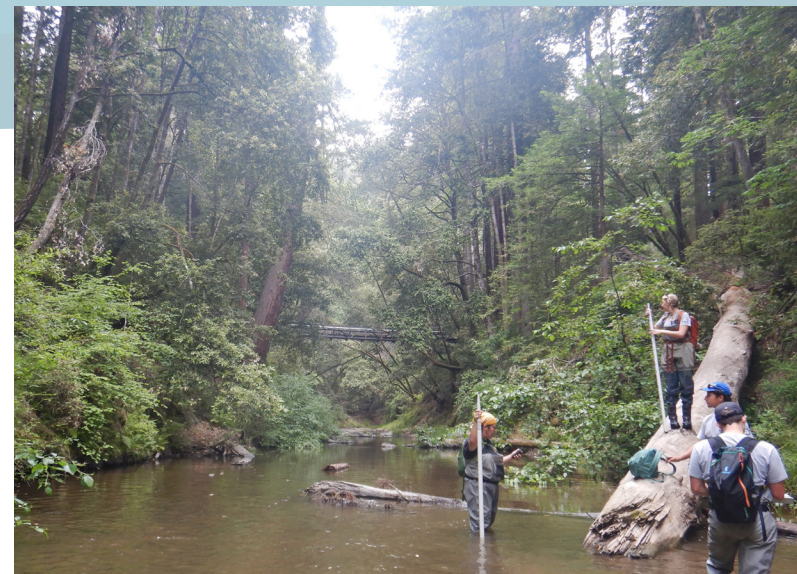
Photo to left: Staff studying sediment deposition in Pescadero Creek