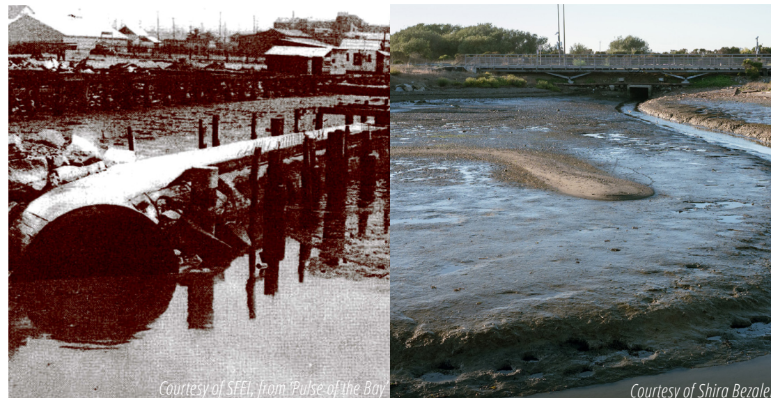
Photo above, left: A pre-Clean Water Act sewage discharge point

One of the pillars of our work is a shared, evidence-based understanding created by collaborative engagement with others. A key example is our work with Bay Area dischargers to initiate a cooperative regional monitoring program, resulting in the establishment of the San Francisco Bay Regional Monitoring Program (RMP) in 1993. The RMP involves a diverse coalition of interested parties, including regulatory agencies, industry representatives, environmental groups, engineers, and scientists. The program's primary objective is to provide sustained, scientifically robust data on the water quality and ecological health of San Francisco Bay, allowing for increased transparency and accountability and better-informed decision making. We are building on that effort with the Wetlands Regional Monitoring Program, launched in 2016. This program is intended to provide more cost-effective data on Bay wetland restoration efforts, improving our ability to adapt to rising tides.