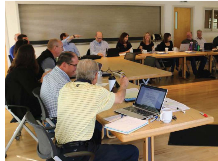
Photo below: A meeting of Bay Area Clean Water Agencies (BACWA), which works with State, federal, and non-governmental organizations to enhance the San Francisco Bay environment

At the local level, we partner with cities, counties, special districts, community groups, the San Francisco Bay Joint Venture, San Francisco Estuary Institute, the Bay Area One Water Network, Bay Area Regional Collaborative, San Francisco Bay Conservation and Development Commission, Baykeeper, Save the Bay, the Bay Planning Coalition, wastewater agencies and the Bay Area Clean Water Agencies, the Bay Area Municipal Stormwater Collaborative, and the Bay Area Flood Protection Agencies Association.