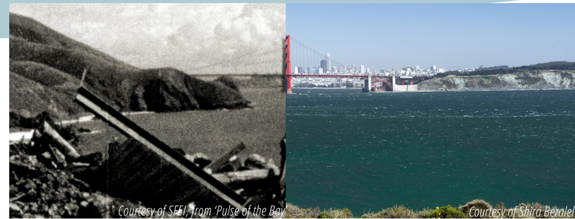
Photo above, left: A view of the Golden Gate Bridge taken from the Marin Headlands, pre-Clean Water Act