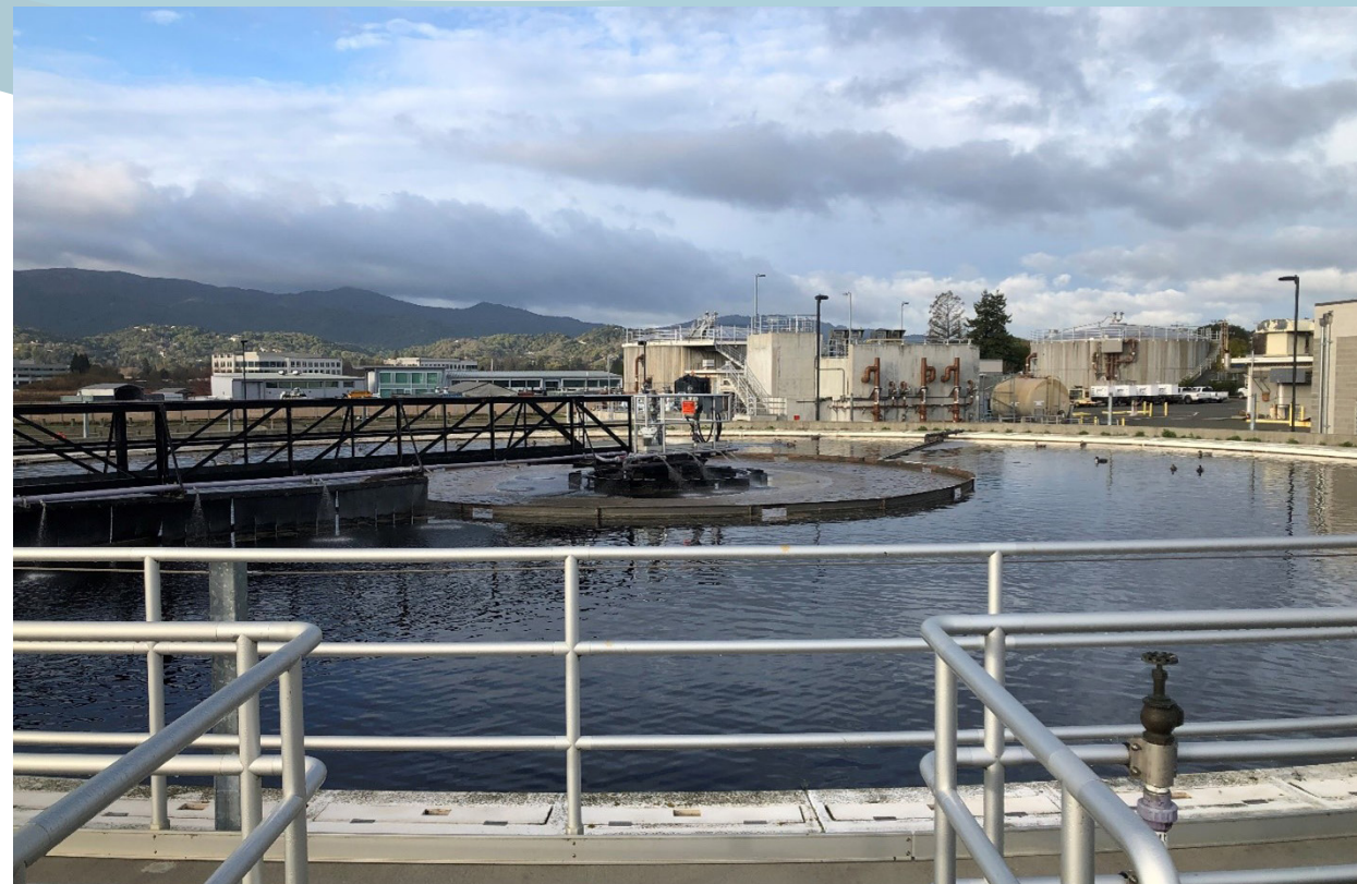
Photo to left: Secondary clarifier at Novato Sanitary District's wastewater treatment plant, covered under a NPDES permit

We issued two watershed NPDES permits that cover numerous dischargers. The Mercury and Polychlorinated Biphenyls (PCBs) Watershed Permit implements the TMDLs for mercury and PCBs in San Francisco Bay. The Nutrient Watershed Permit addresses municipal wastewater discharges of nutrients to San Francisco Bay and is funding studies to inform nutrient control levels and management actions to protect San Francisco Bay's beneficial uses.