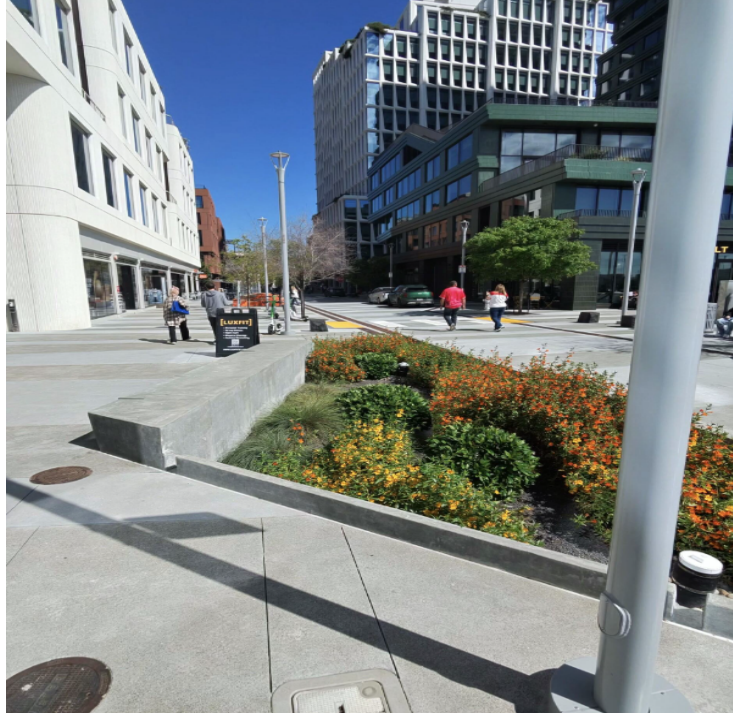
Figure 3: Flow-through planter within a public walkway in San Francisco's Mission Bay neighborhood.