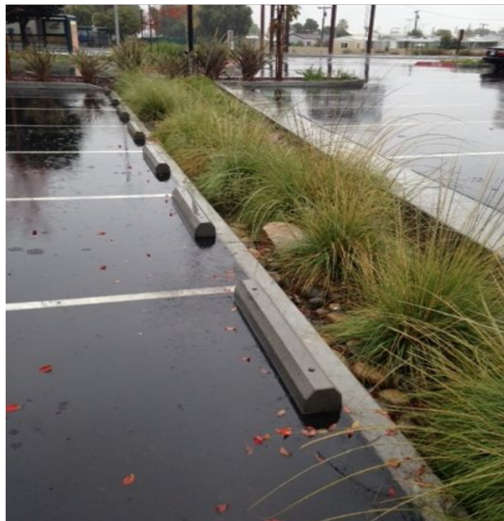
Figure 2: Bioswale managing stormwater runoff from a parking lot in San Jose. The swale has been located in the overhang space for parked cars.