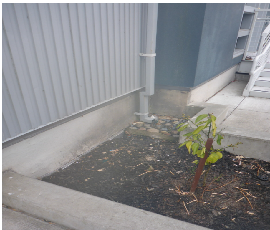
Figure 6: A building with a disconnected downspout to manage roof runoff by directing it to a vegetated surface.