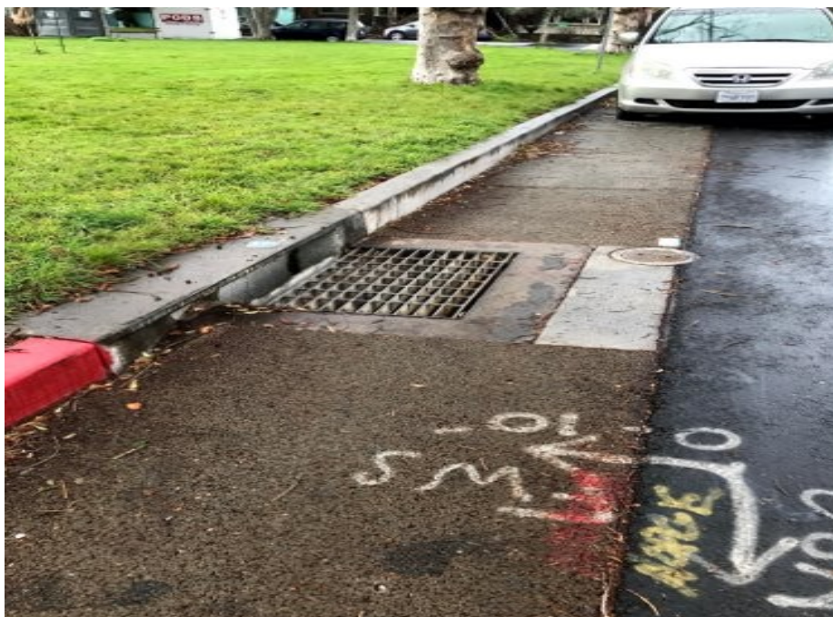
Figure 5: Pervious pavement installed in Berkeley to minimize runoff and pollutants from a streetscape before runoff enters a storm drain.