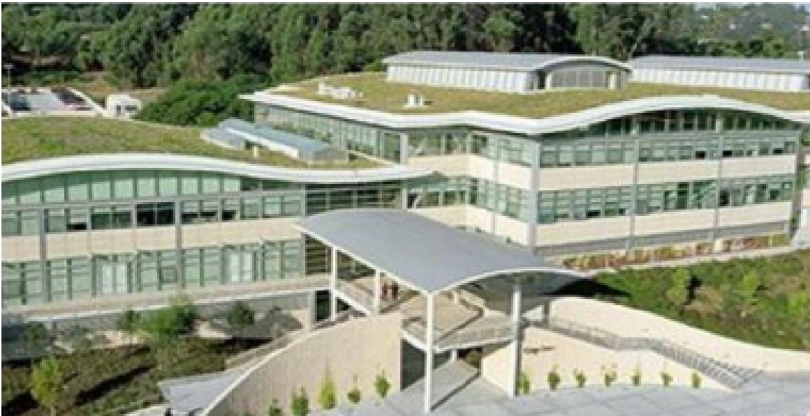
Figure 4: Extensive Green Roof at Gap Corporate Headquarters, San Bruno.