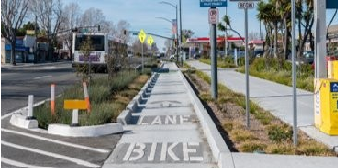
Figure 1: Bioswale adjacent to a bike path and roadway.