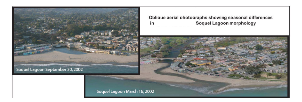
Figure 3: Photos of Soquel Lagoon