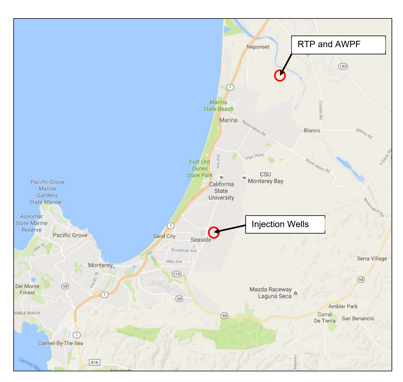
Figure 1 - Location of MRWPCA's RTP, AWPF and Injection Wells