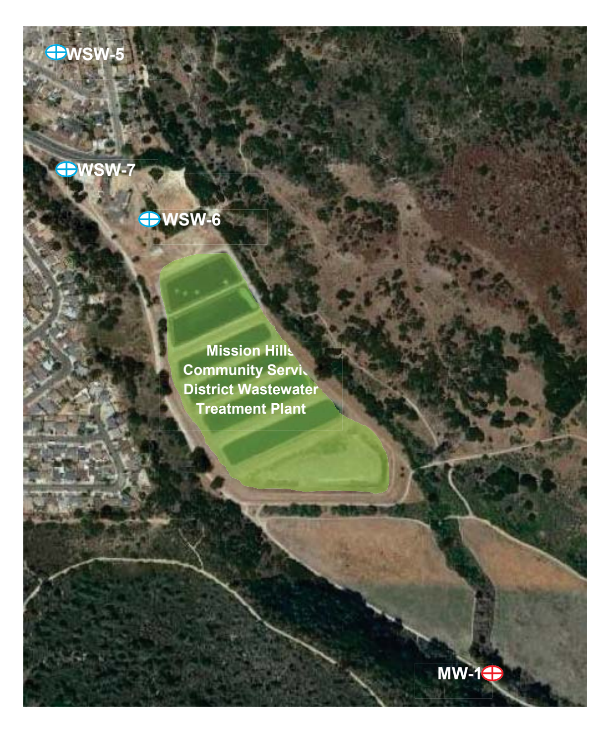
Figure 2 – Aerial photograph of Mission Hills Community Service District Wastewater Treatment Plant. Location of water supply wells labeled in top left corner with blue crosses. Location of monitoring well labeled in bottom right corner with red cross.