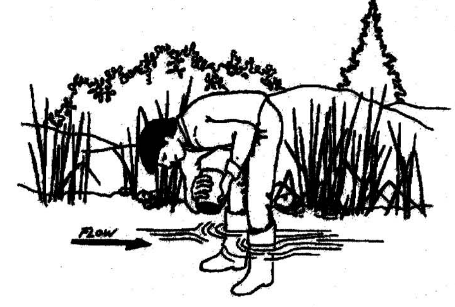
Getting into position to take a turbidity grab sample.