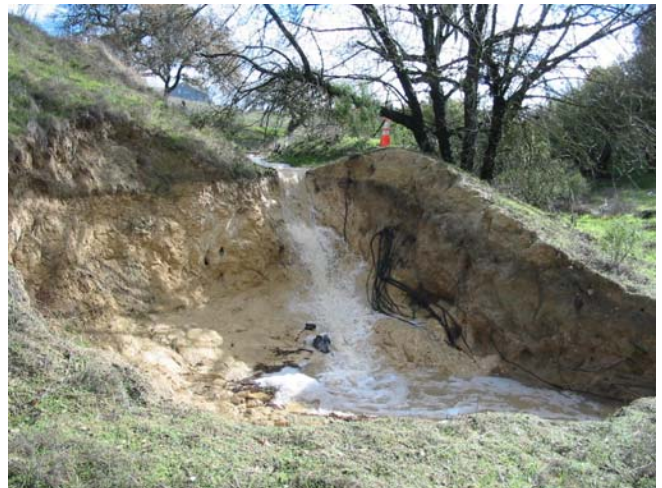
December 2002 – Uncontrolled runoff from construction site causes large scale erosion, continuing to fill in pond and riparian area.