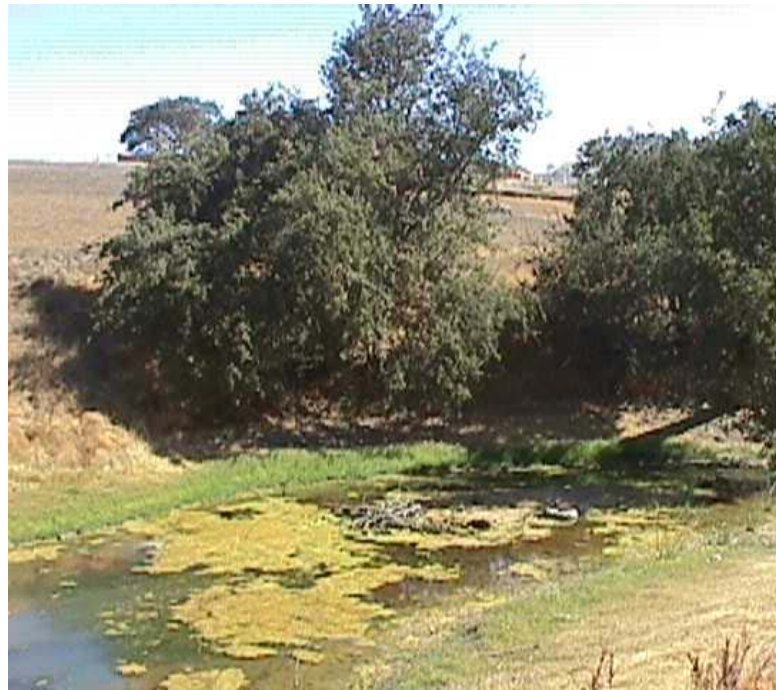
October 2002 – Pond in natural drainage was filling in from erosion caused by drainage overflow and sediment from construction site upstream. Pond and riparian area (not shown) contained construction debris, which demonstrated the source of the sediment and fill material.

One of my most memorable and tangible success stories during my career with the Water Board occurred early in my tenure in the Stormwater section. During my construction site inspections, I found a Paso Robles construction project which was allowing large amounts of eroded sediment to leave the site. The site is situated at the head of one of the many unnamed tributaries to the Salinas River. I walked the length of the tributary from the construction site down, and found that a moderate sized pond had been filled with sediment, straw bales, and construction debris from the construction site. The pond was situated within native oak habitat, and showed remnants of now-buried wetland and riparian plants along the edges of the pond. I pressed for the construction site owner to improve his on-site construction erosion/sedimentation practices, and to remove debris and sediment from the pond. The pond recovered from the inundation, and I have the pleasure of glimpsing the water-filled aquatic habitat nestled in the oak forest whenever I travel Highway 46E. I have satisfaction knowing that I took the time to follow the tributary from the construction site origin, document the full impact the sediment had on the aquatic and riparian zone, and pressed for full mitigation on- and off-site. This resulted in gaining back and protecting a gem of native habitat.