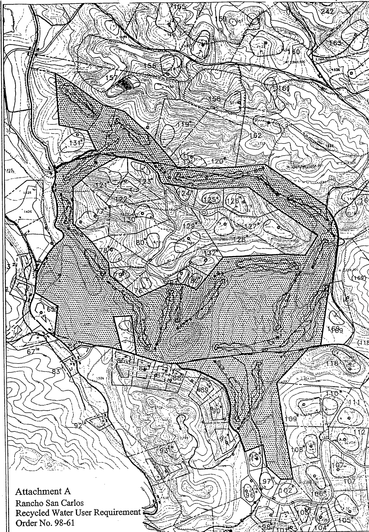
Attachment A Rancho San Carlos Recycled Water User Requirement Order No. 98-61