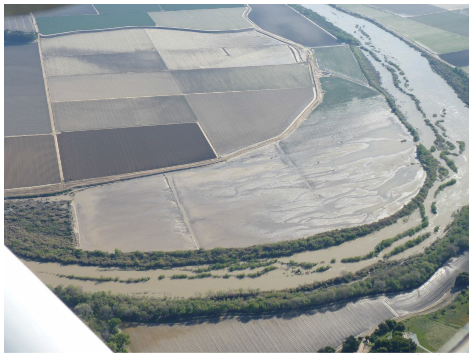
Item No. 15 Presentation September 24, 2015 The Otter Project and Monterey Coastkeeper