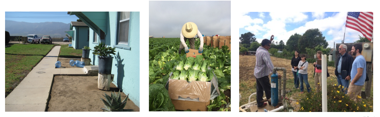
Integrated Drinking Water and Wastewater Plan for Disadvantaged Communities in the Salinas Valley and Greater Monterey County IRWM Region

1. Many more disadvantaged communities exist in the region than could be fully evaluated through this project. The Project Team identified a total of 21 disadvantaged and suspected disadvantaged communities within the region. Fourteen of these communities were classified as high priority, five were classified as medium priority, and two were classified as low priority. With the funds available, the Project Team selected seven of the high priority communities for further evaluation through this project. Additional funds will be needed to fully evaluate solutions for the remaining high and medium priority communities.