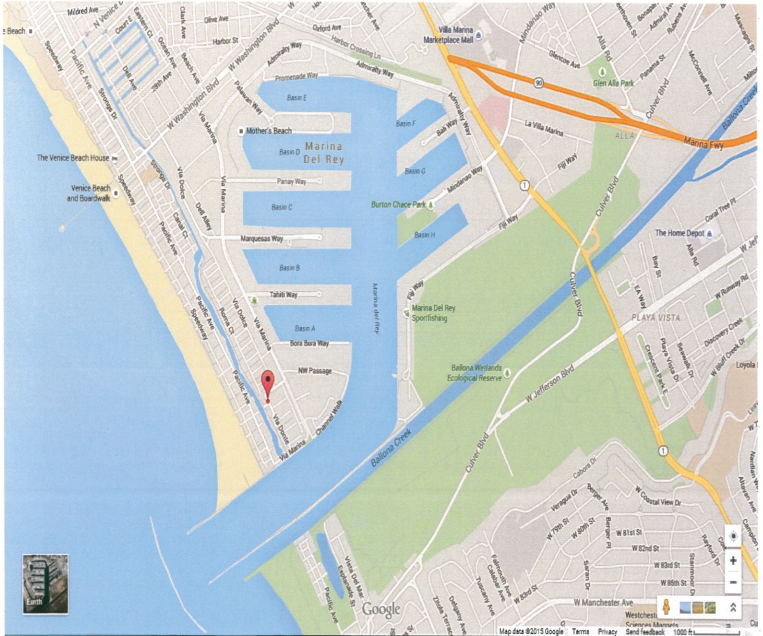
Figure 1 Area Map