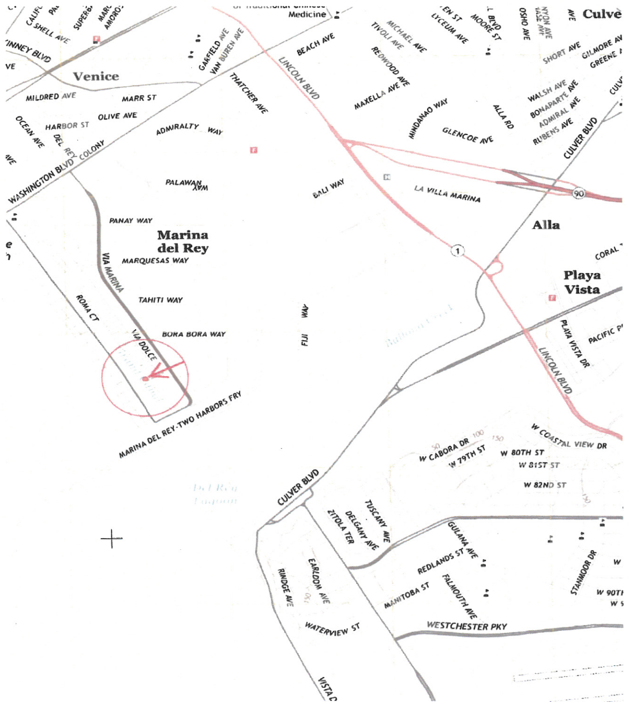
Figure 2 Site Map