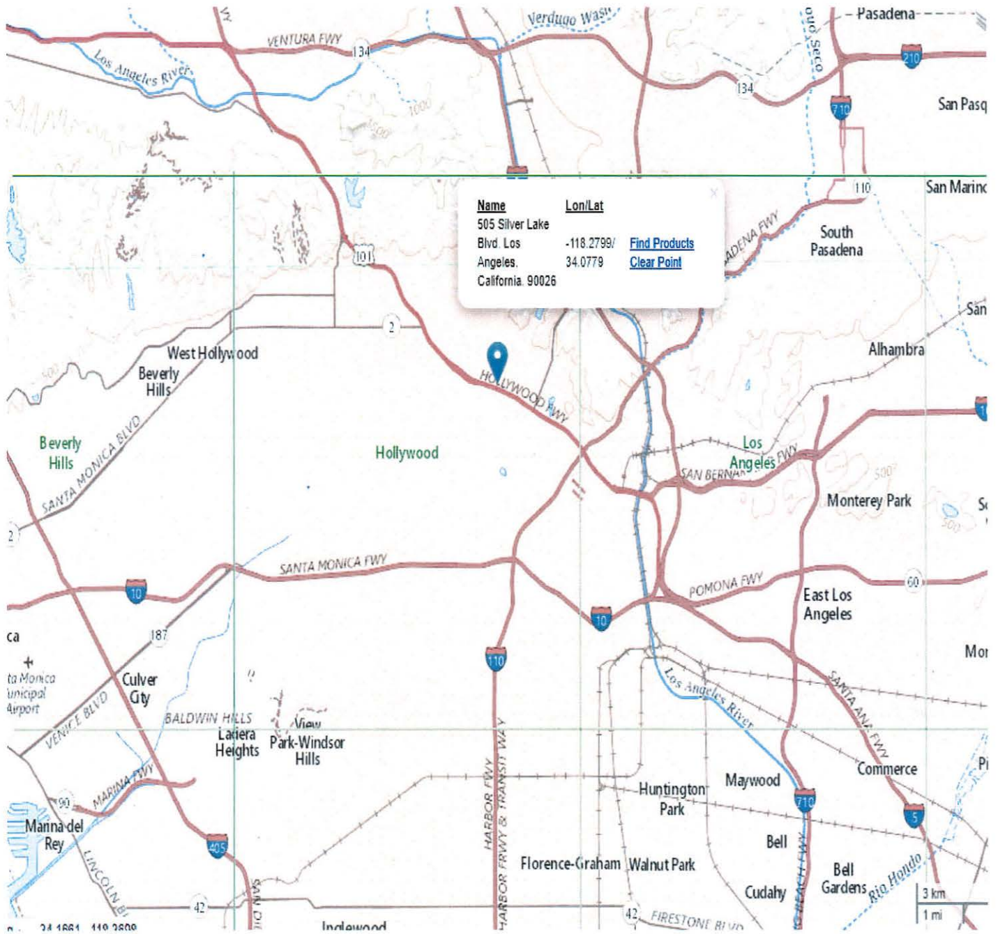
Figure 1. Area Map