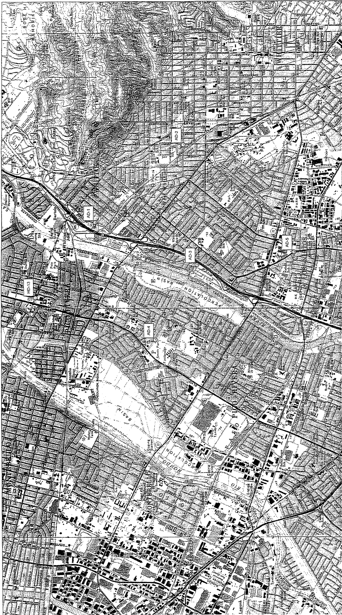
FIGURE 1.b CENTRAL BASIN MUNICIPAL WATER DISTRICT (CENTURY DISTRIBUTION SYSTEM)