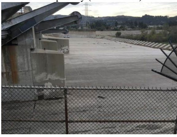
San Gabriel Spillway (downstream)