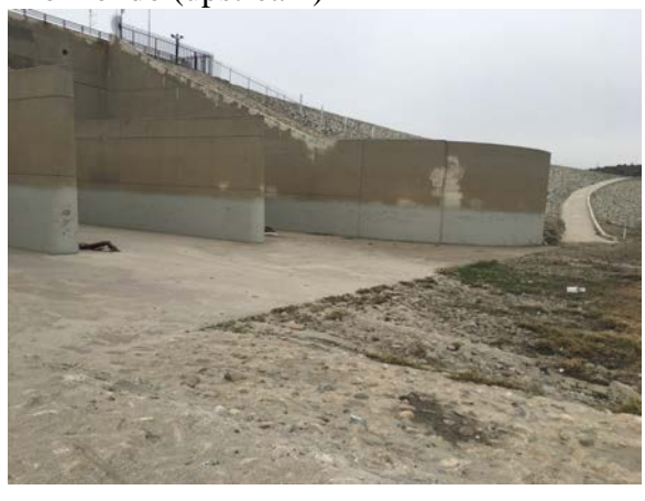
Rio Hondo (upstream)