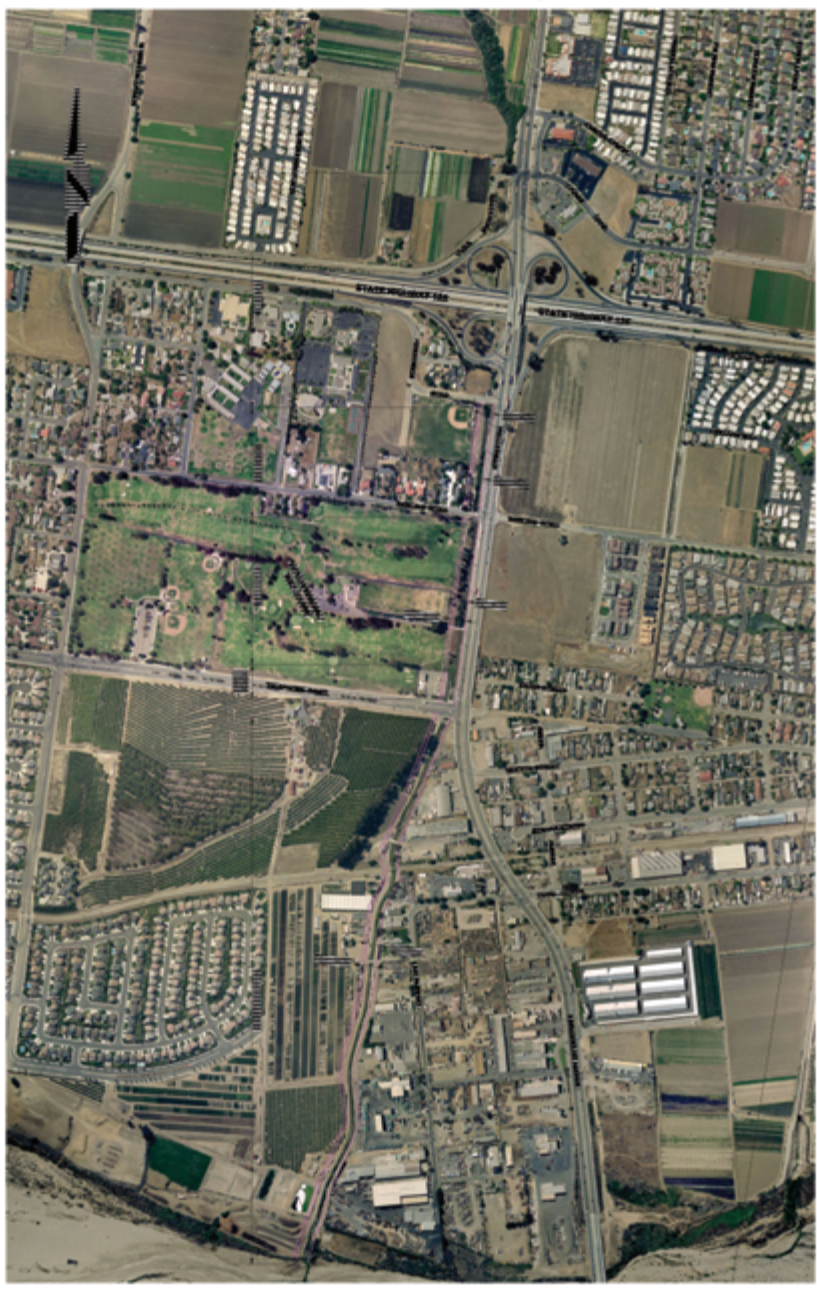
EXHIBIT PLAN SCALE: 1" = 200'